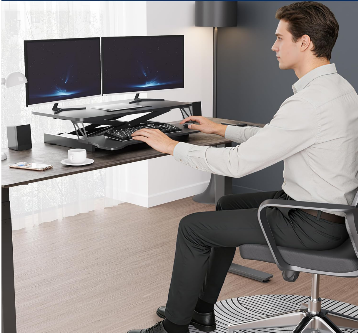
Image: User demonstrating the desk converter in a sitting position.