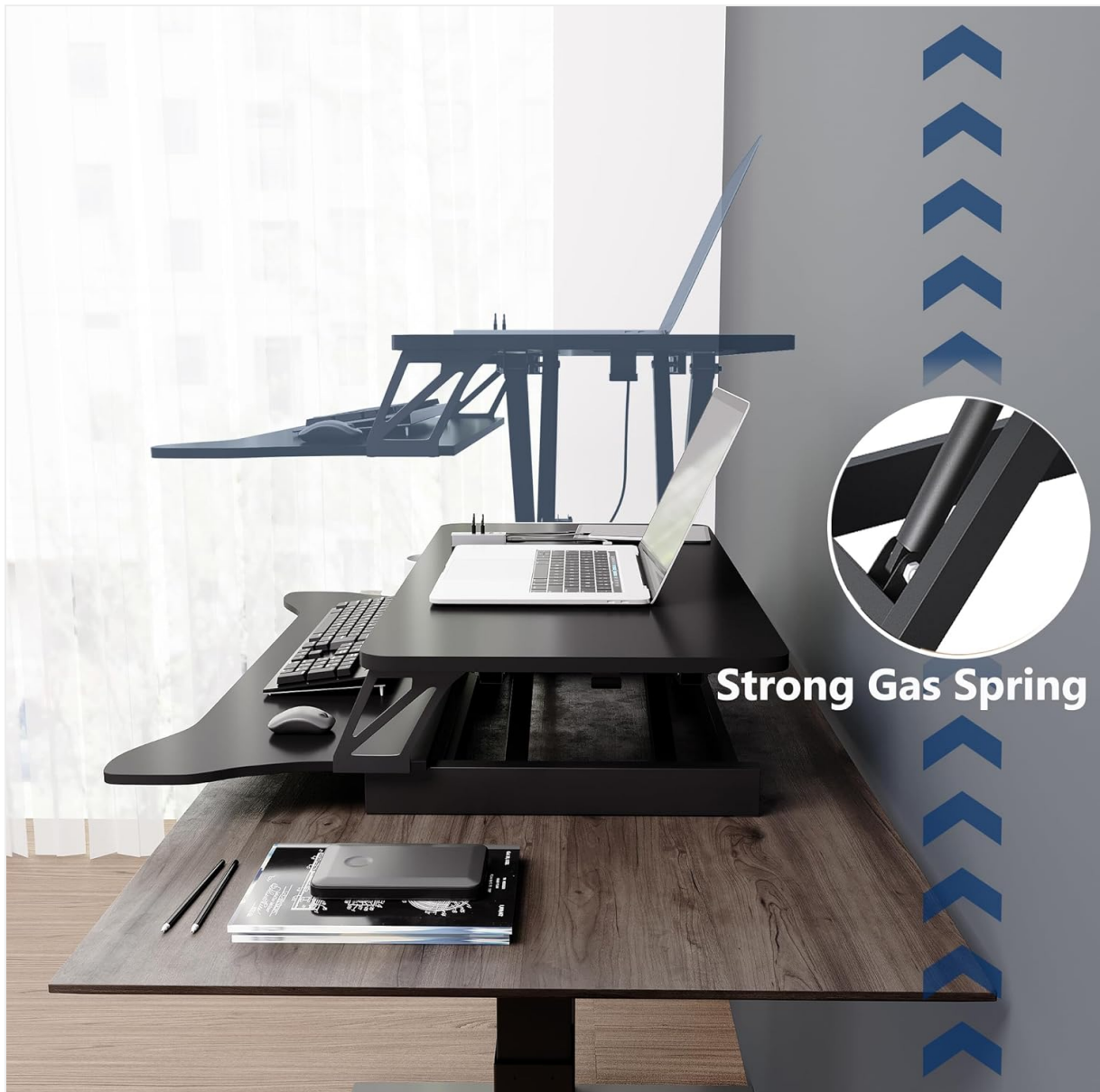
Image: Illustration of the strong gas spring system enabling smooth height transitions.