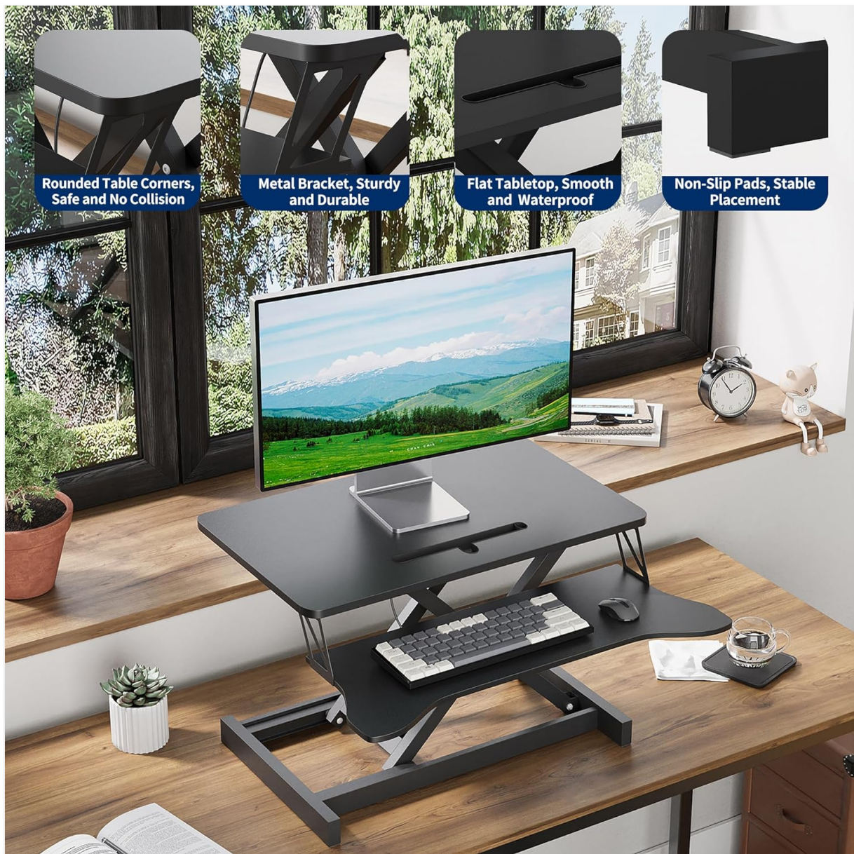
Image: Visual representation of the desk converter's quality features, including rounded corners, sturdy metal bracket, smooth tabletop, and stable non-slip pads.