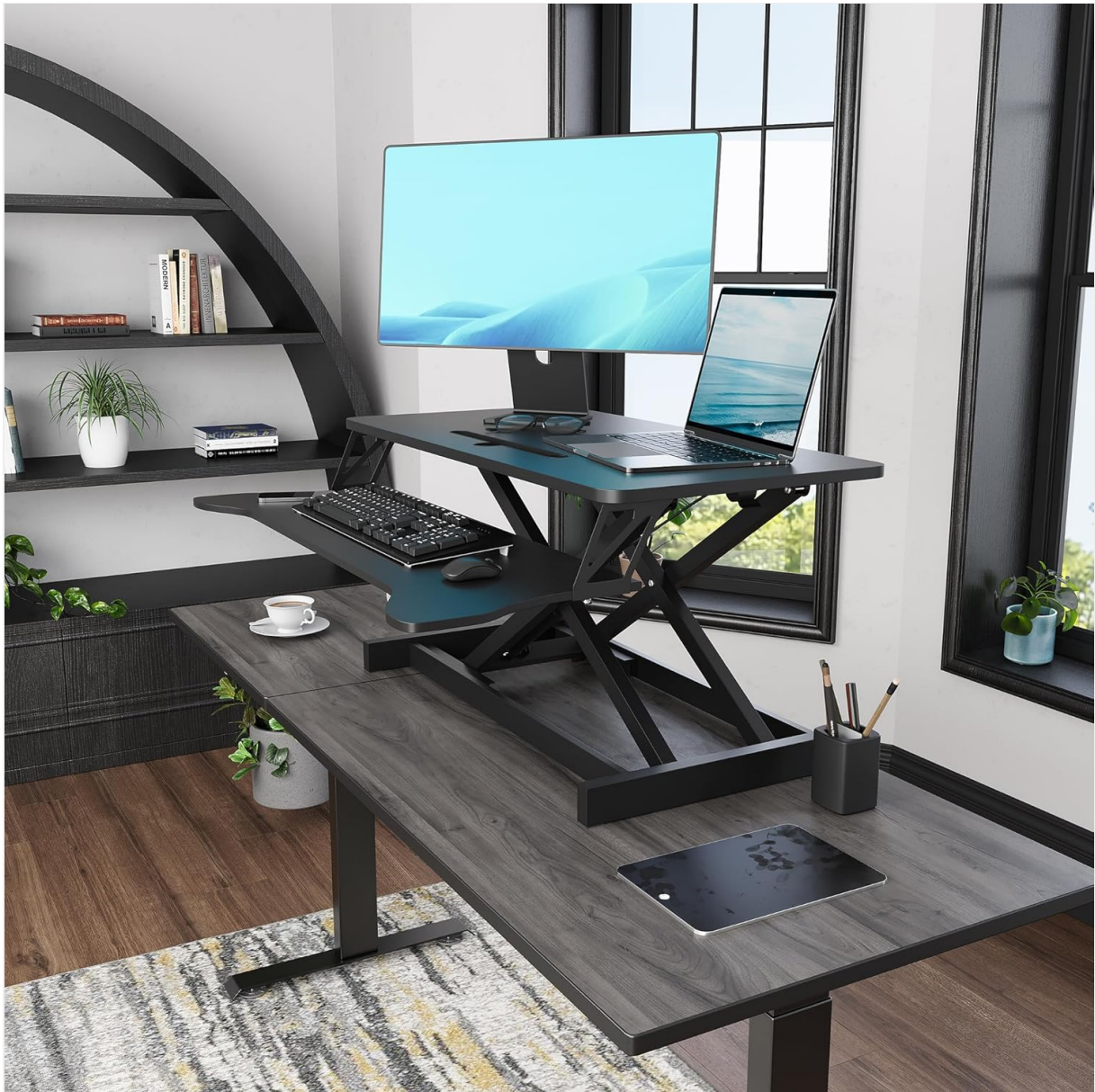
Image: The desk converter in a standing position, accommodating dual monitors and a laptop.