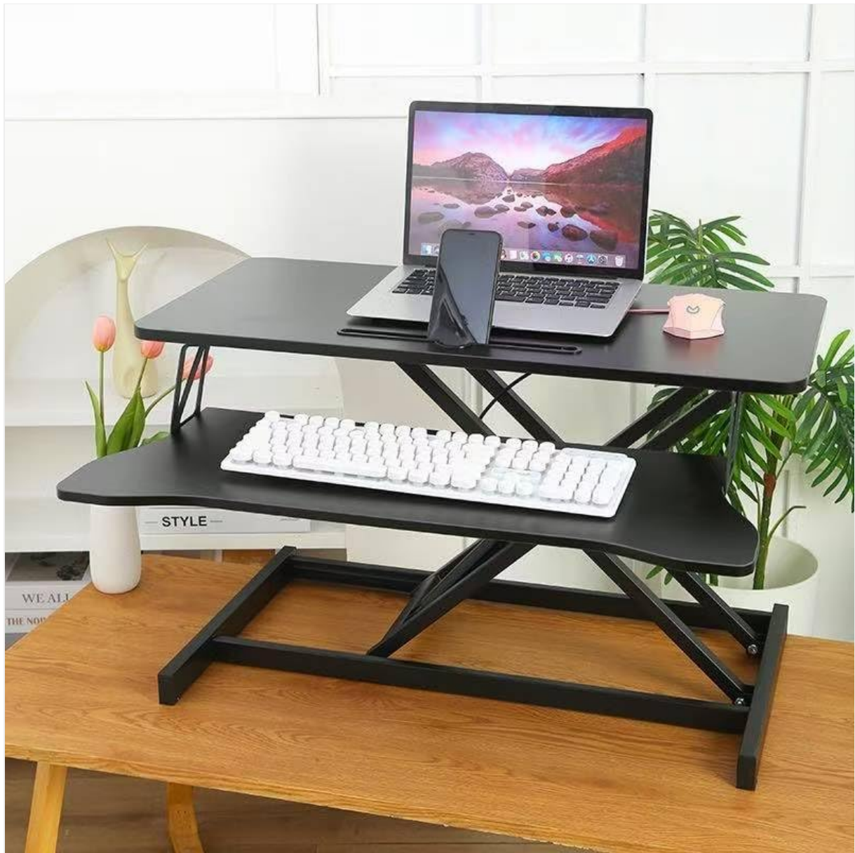
Image: The Panana Standing Desk Converter in use, showcasing its dual-level design with a laptop on the upper platform and a keyboard on the lower tray.