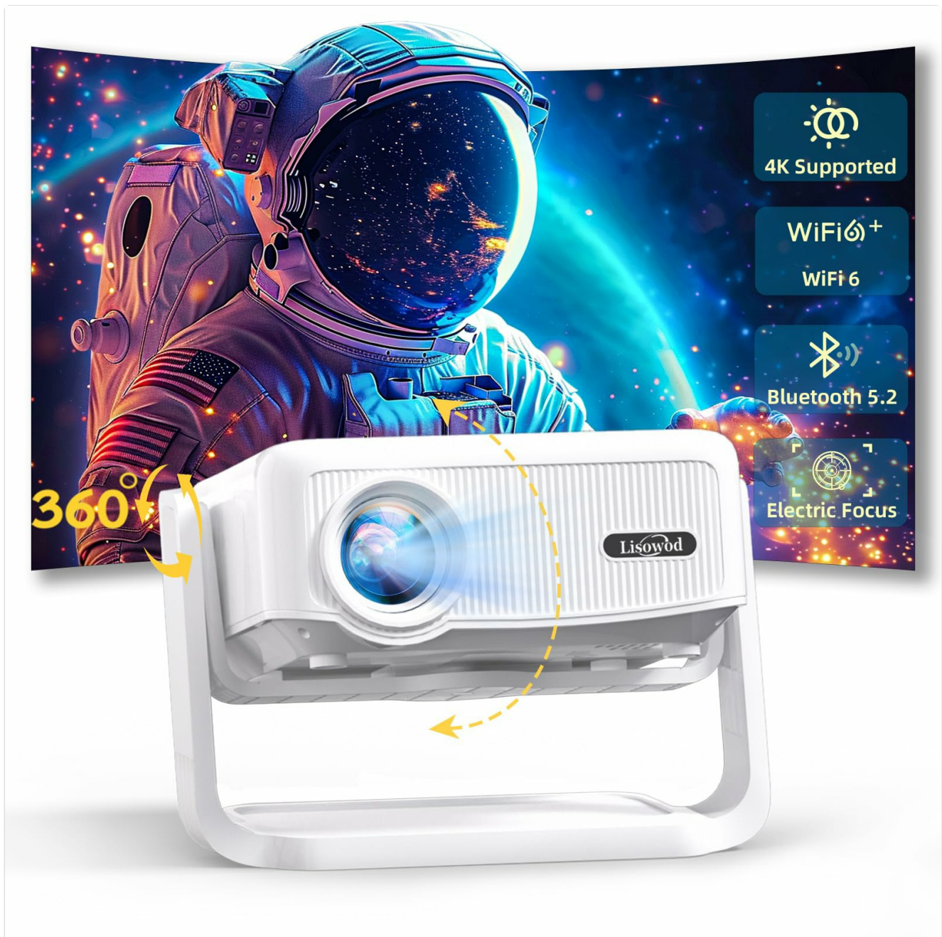
Image Description: Front view of the Lisowod L02 Mini Projector, showcasing its lens and compact white casing.