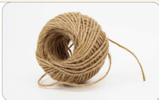
Figure 3: This image details the construction materials: durable particle board for structural integrity, soft plush fabric for comfort, and reinforced sisal rope for scratching posts, designed to withstand cat activity.

The durable sisal rope is strong enough to withstand constant scratching, satisfying your kittens instincts