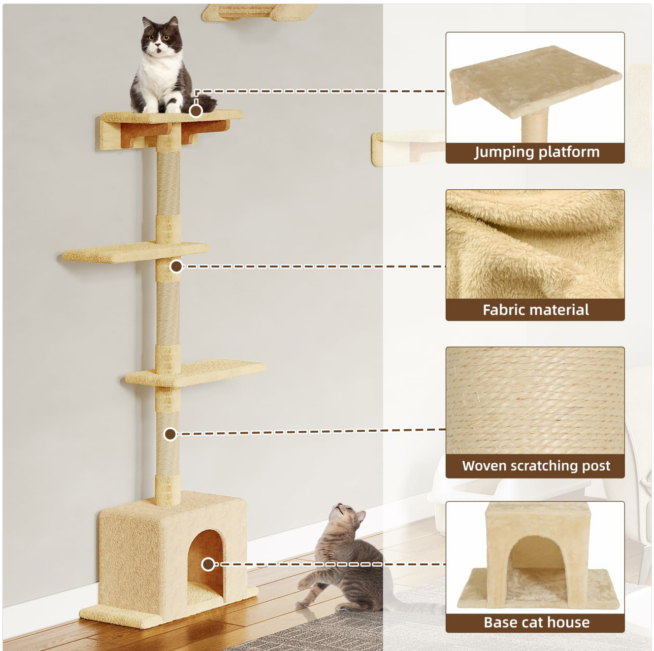
Figure 4: This image illustrates key features of the cat tree, including a jumping platform, soft fabric material, a durable woven scratching post, and a cozy base cat house.