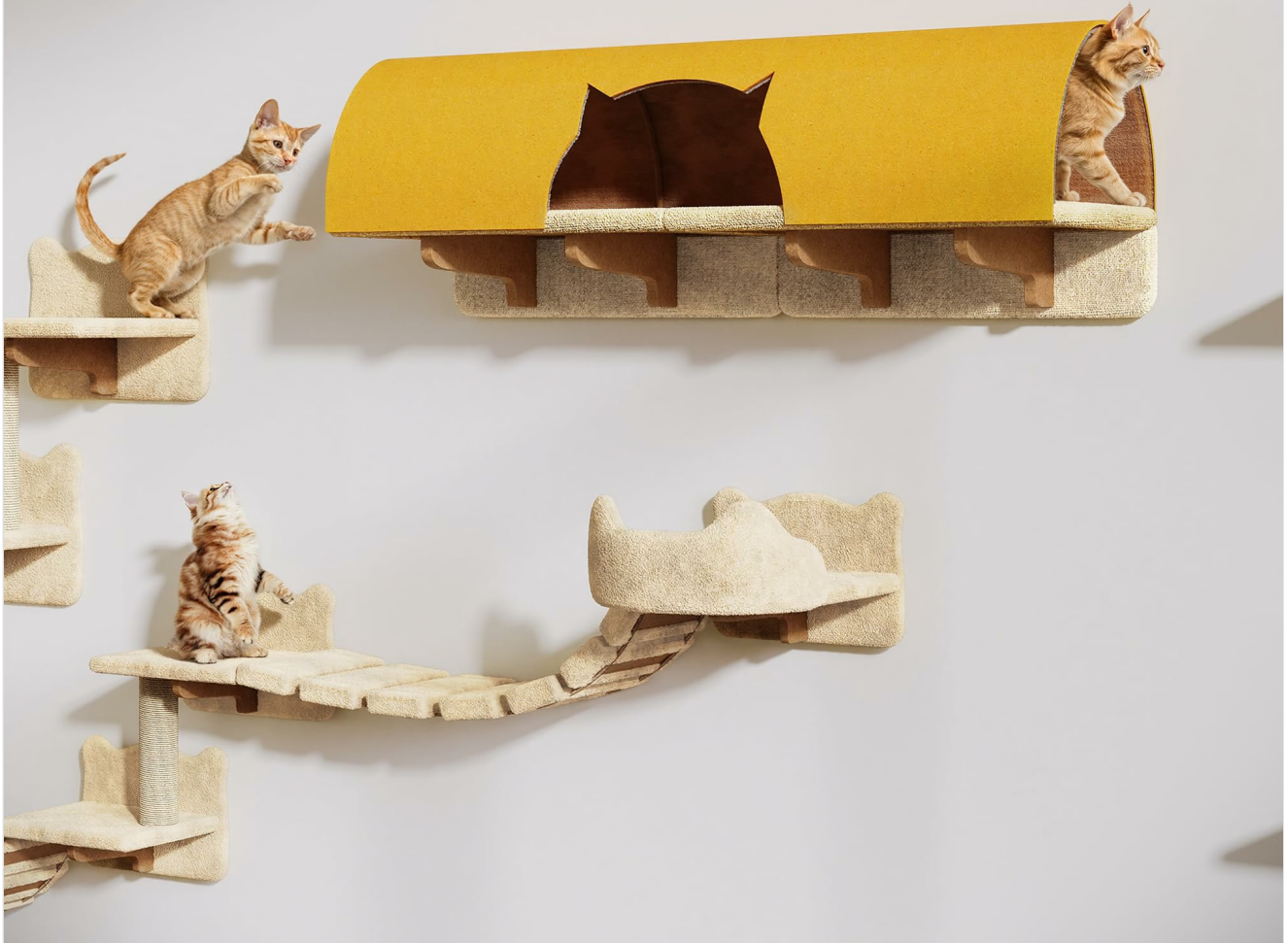
Figure 6: This image displays cats enjoying the multi-platform cat zone, featuring a tunnel and various shelves, providing peaceful resting and play areas.