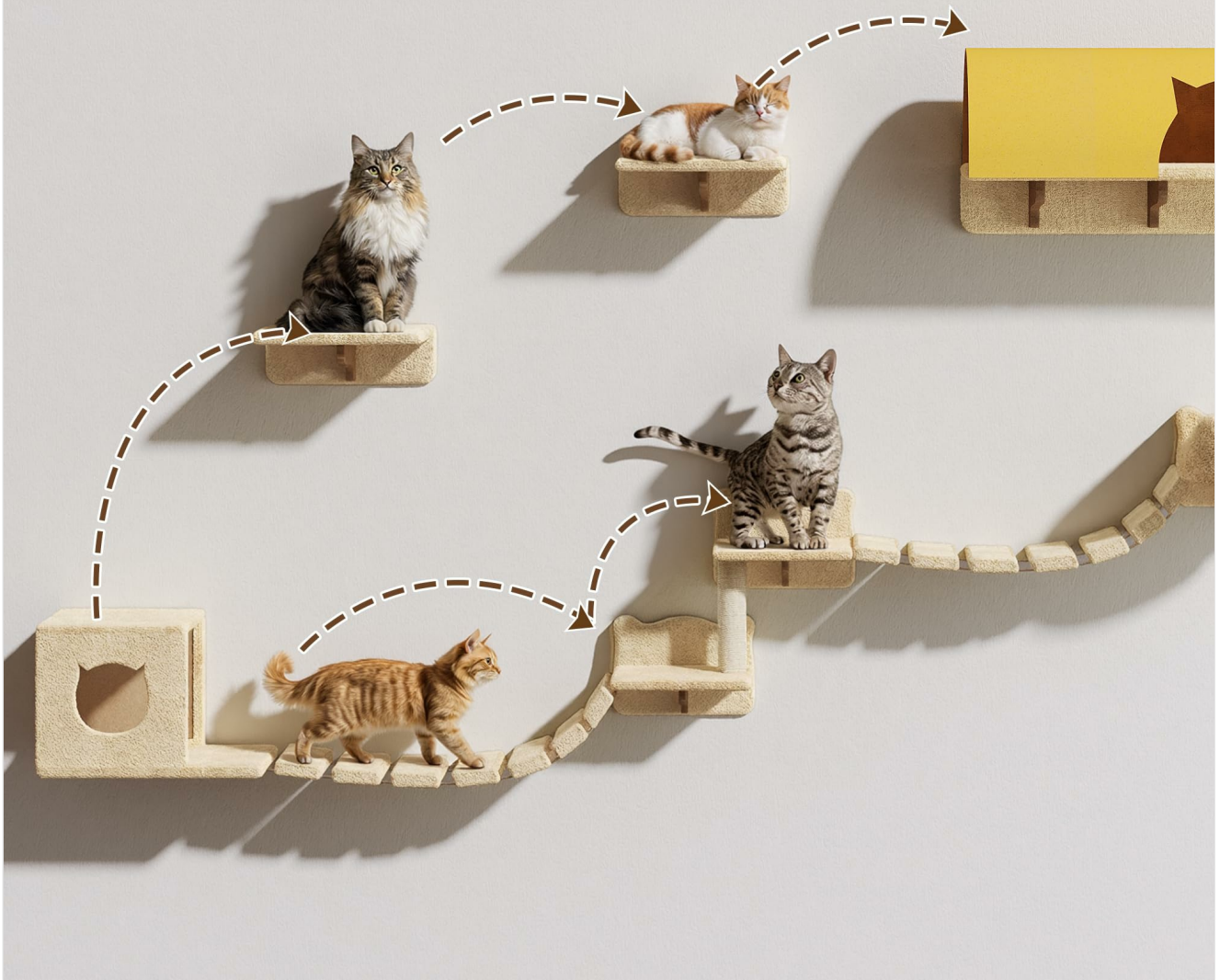
Figure 5: This image shows several cats actively using the wall-mounted system, illustrating how they can jump, explore, and relax on the various platforms and the bridge.

Allows your cat to jump, explore, & relax easily