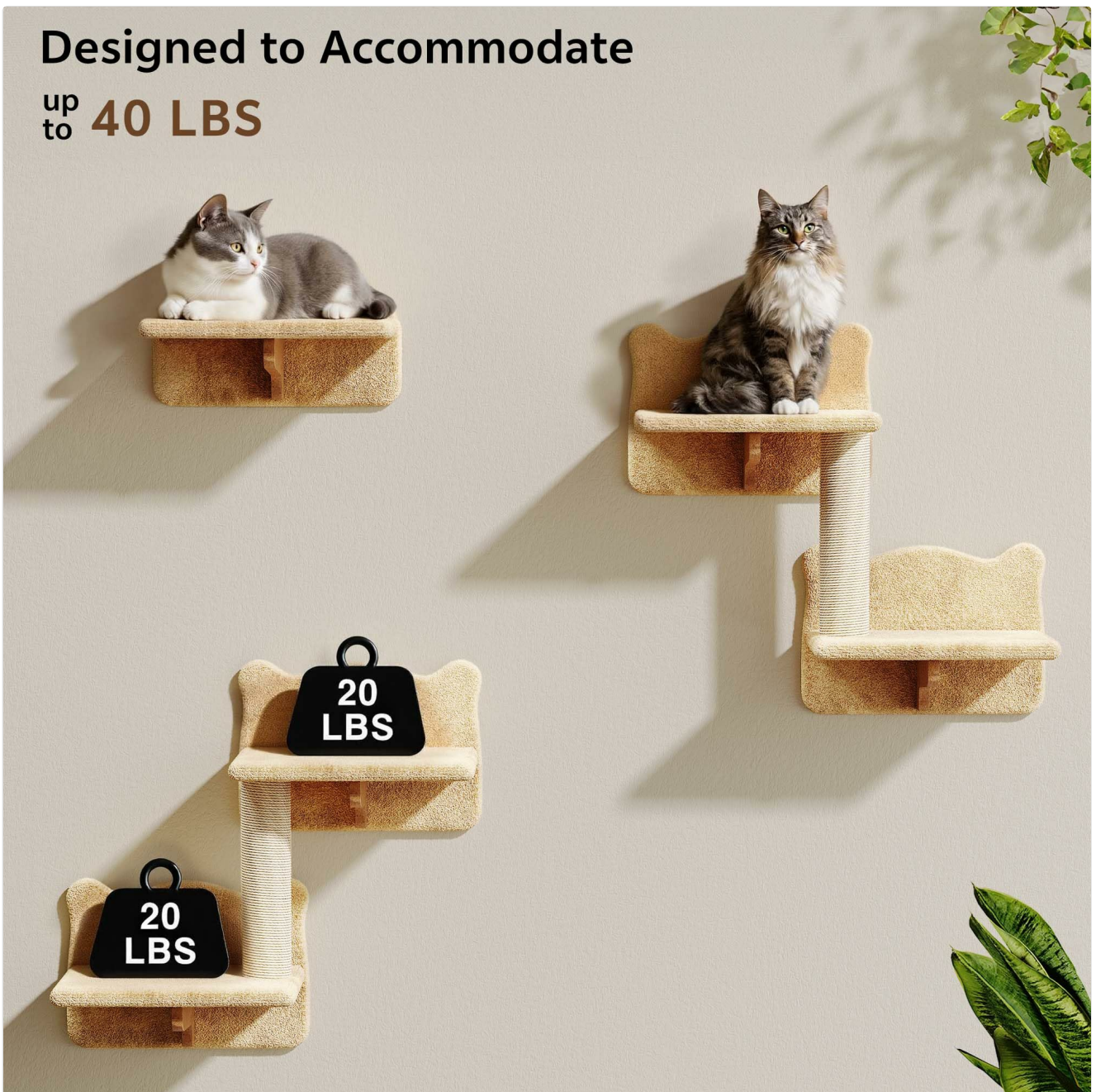
Figure 2: This image demonstrates the weight capacity of the shelves, indicating they are designed to accommodate cats up to 40 lbs.