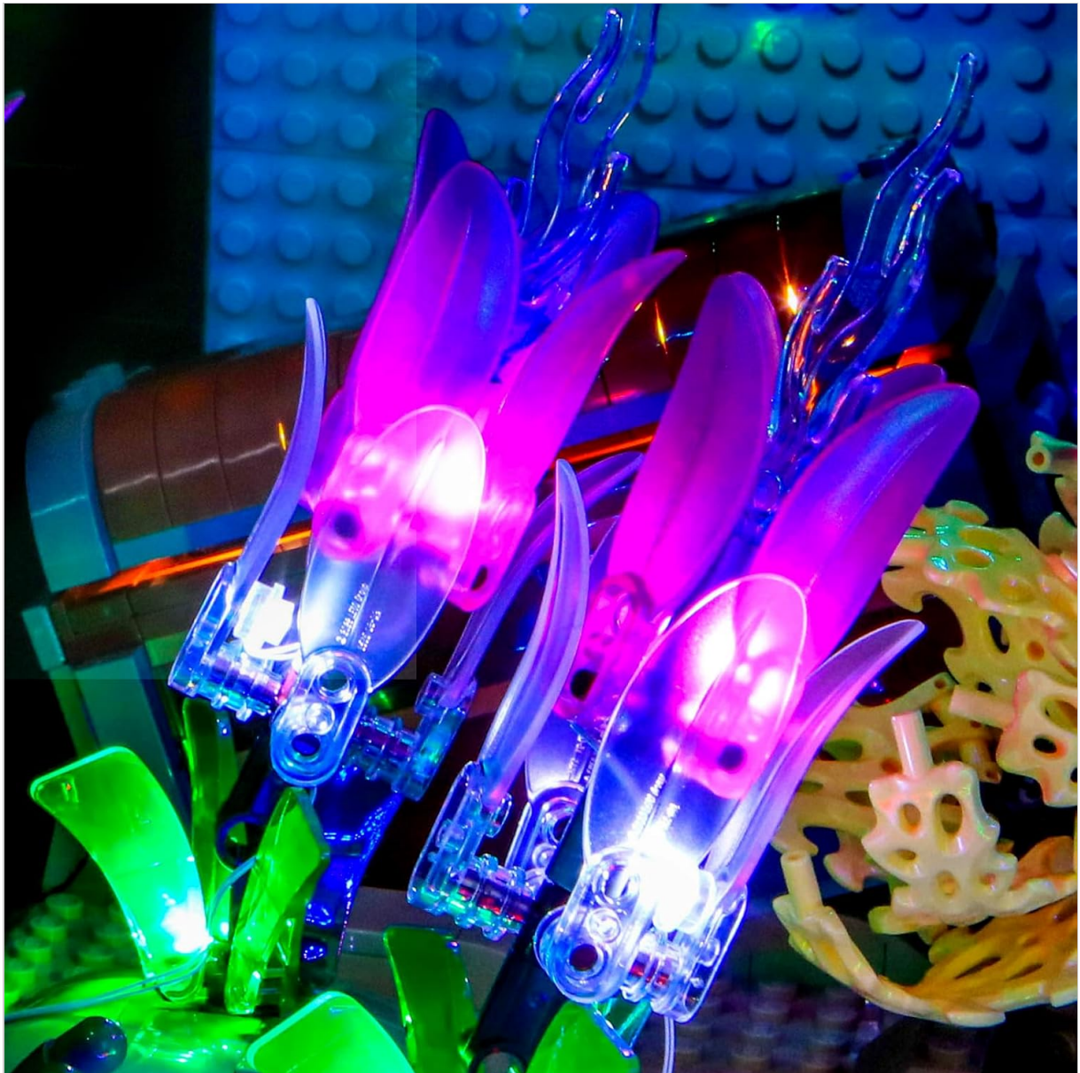
Image: A close-up view of plant-like structures in the LEGO aquarium, featuring purple and blue illumination from the light kit.

If you continue to experience issues, please contact LocoLee customer support for assistance.