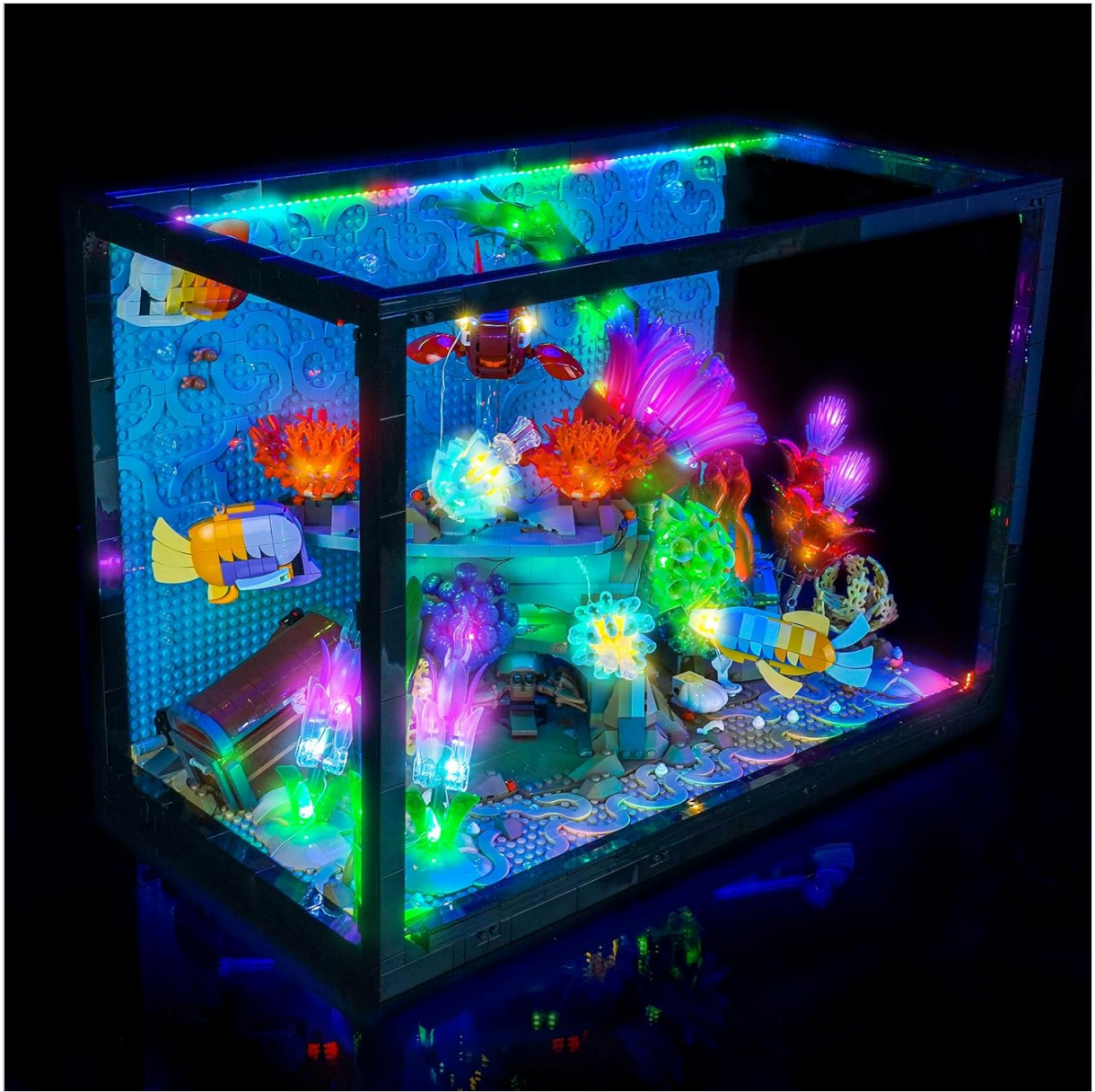
Image: The LEGO Tropical Aquarium model 10366, showcasing the light kit with blue illumination, highlighting the intricate details of the aquarium.