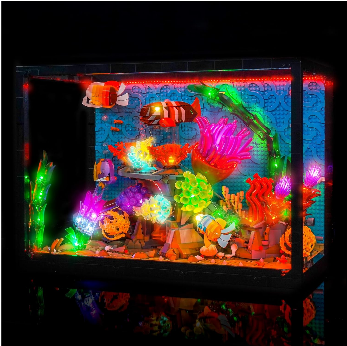
Image: The LEGO Tropical Aquarium model 10366, illuminated with red LED lights, demonstrating another color option for the lighting effects.