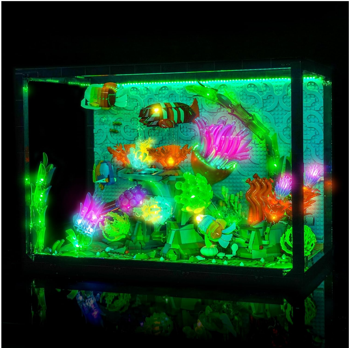
Image: The LEGO Tropical Aquarium model 10366, brightly lit with green LED lights, showcasing the enhanced visual effect of the light kit.