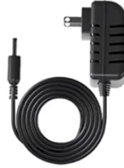
12V AC Adapter