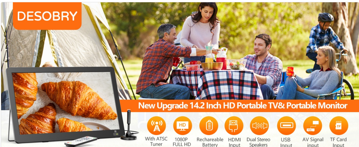
Image: HDMI input screen mirroring from a smartphone to the portable TV.