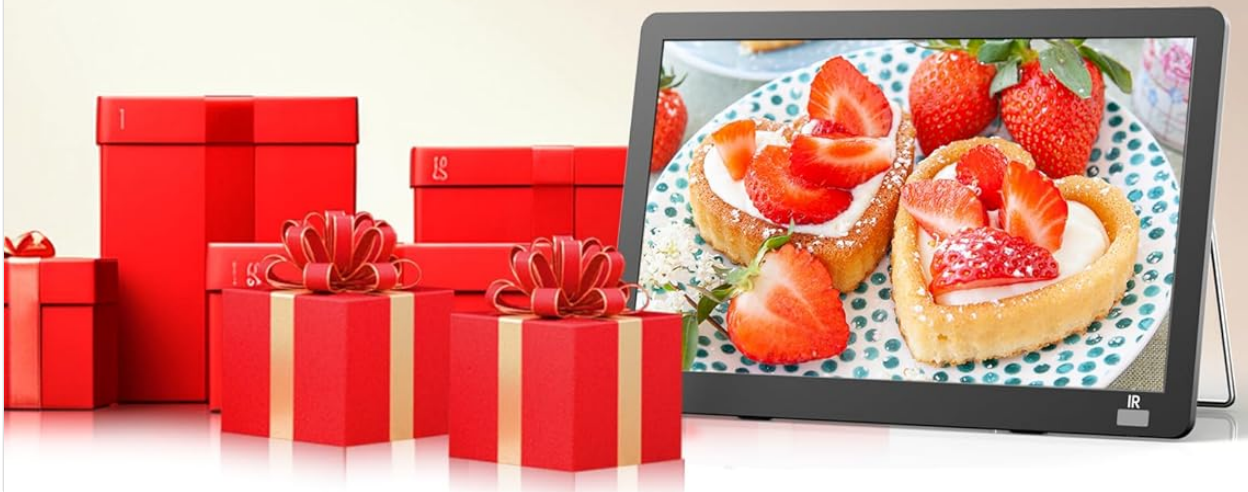
Image: All components included in the product packaging.