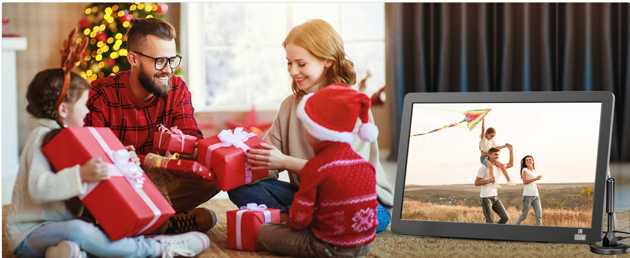
Image: Portable TV with built-in dual speakers highlighted.

Enjoy audio through the built-in dual stereo speakers (10) or connect headphones via the headphone jack (14) for private listening.