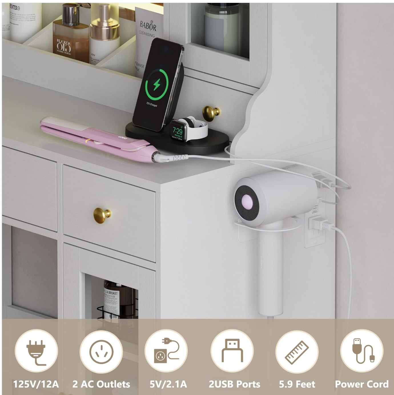
Figure 5.3: Close-up view of the integrated charging station, showing the AC outlets, USB ports, and the blow dryer holder.