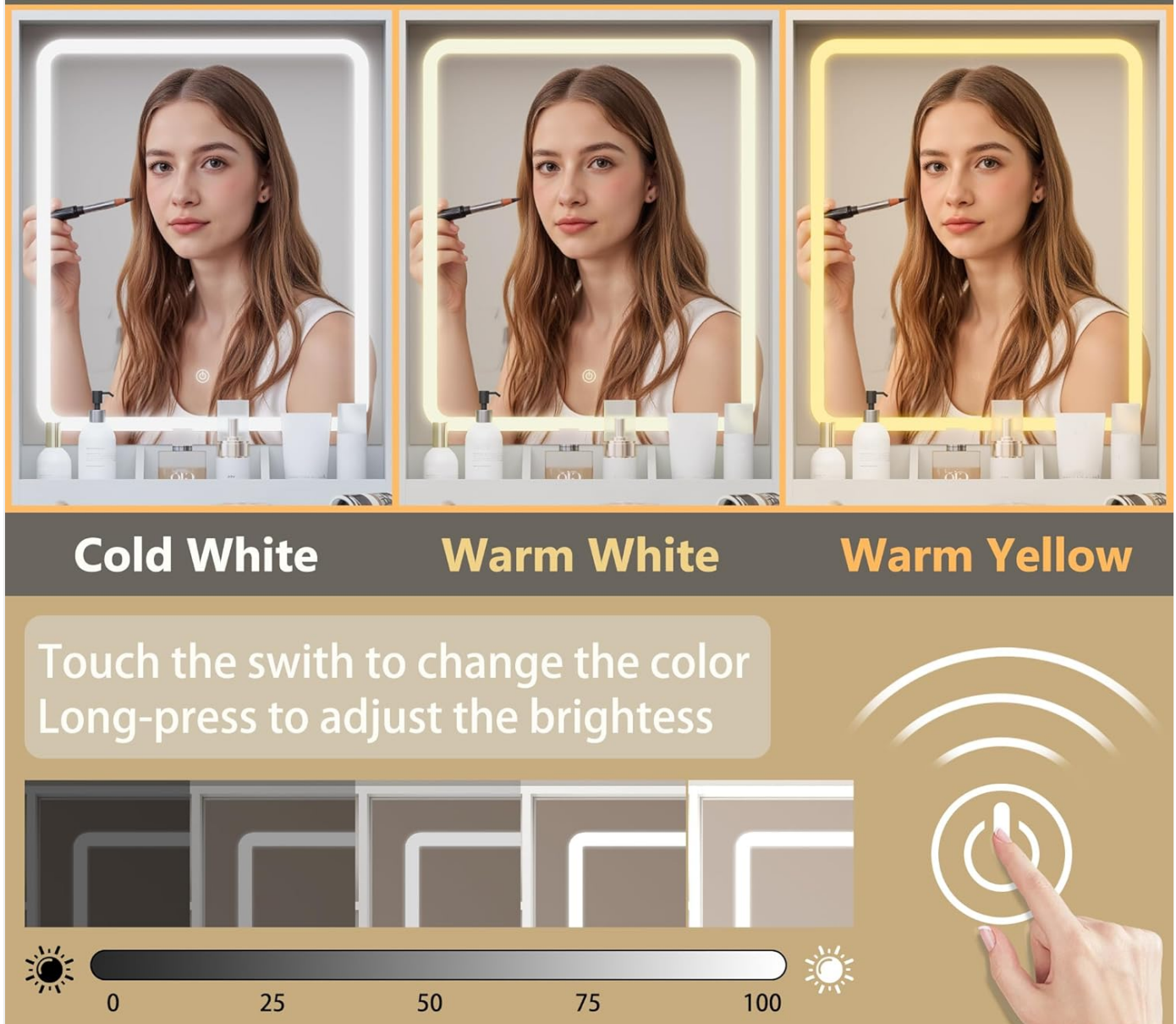
Figure 5.1: Illustration of the three lighting modes (Cool White, Warm White, Warm Yellow) and the touch control for brightness adjustment.