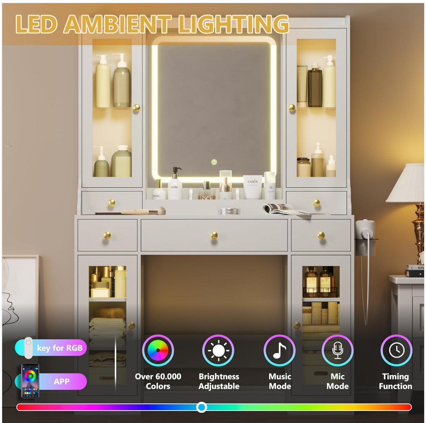
Figure 5.2: Visual representation of the RGB ambient lighting features, including app control, color options, and special modes.