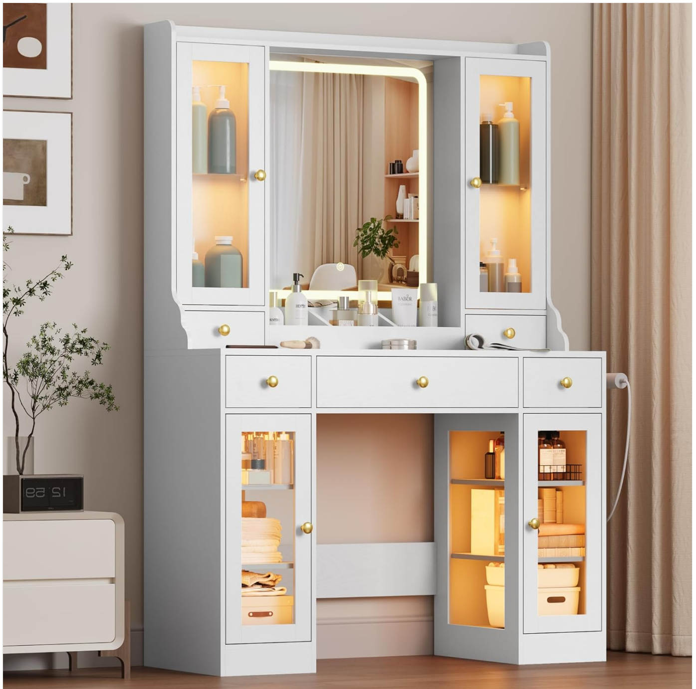
Figure 2.1: Overview of the BORNOON Vanity Desk, Elegant White 5-Drawer model.