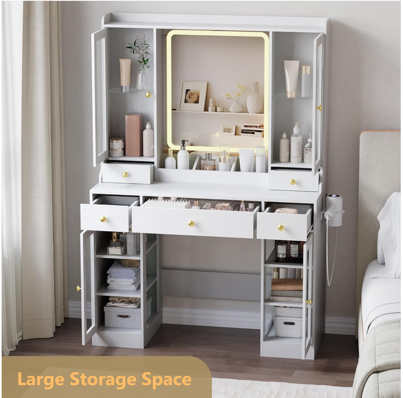
Figure 4.1: The vanity desk showcasing its various storage compartments, including drawers and glass-front cabinets.