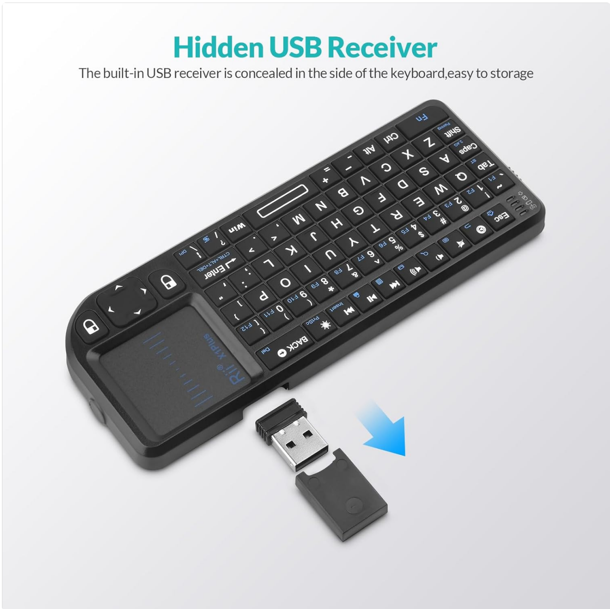
Image: The Rii Mini Bluetooth Keyboard X1 Plus, showing the hidden USB receiver being removed from its storage slot on the side of the keyboard. This receiver enables 2.4G wireless connectivity.

The built-in USB receiver is concealed in the side of the keyboard, easy to storage