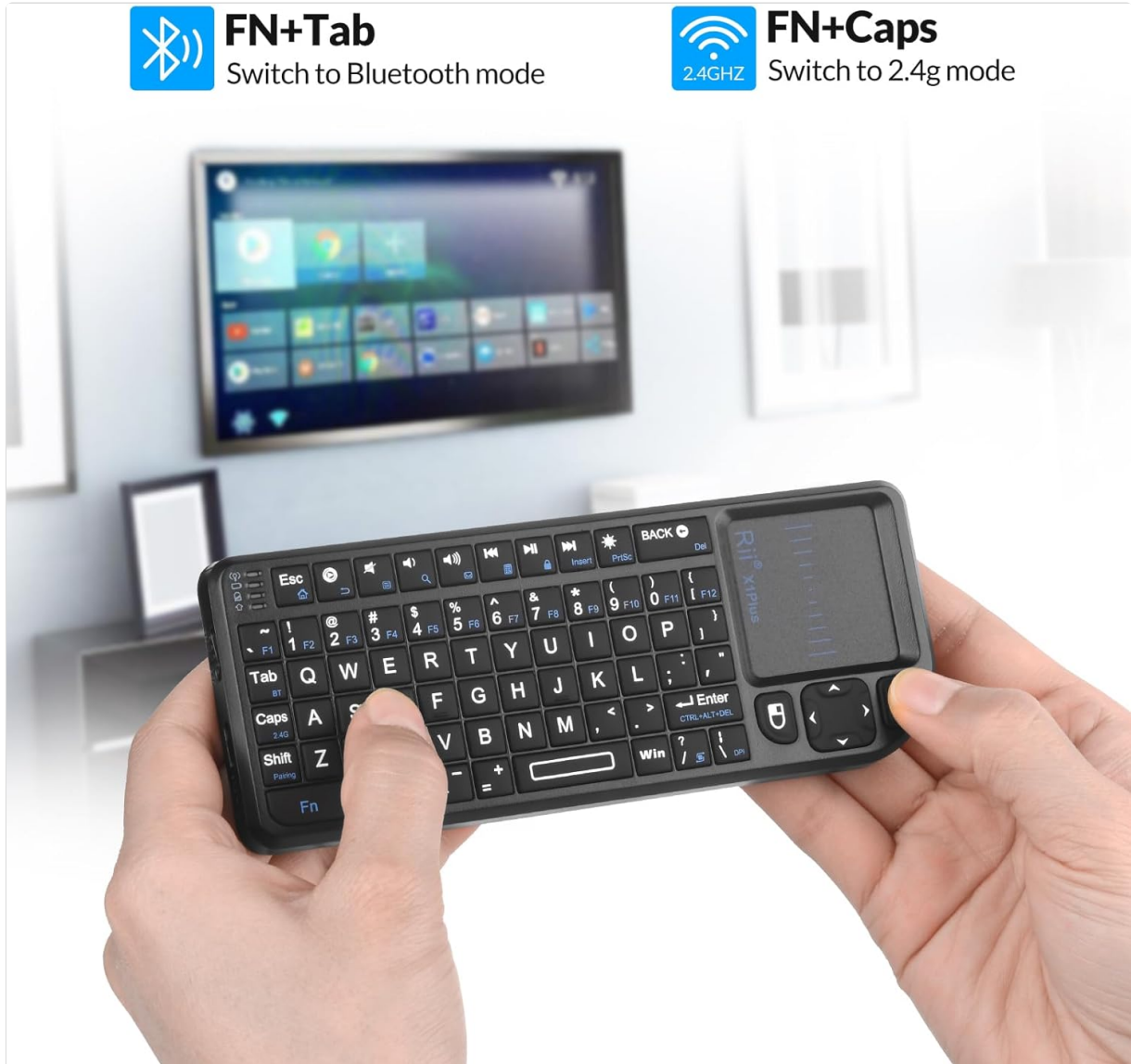
Image: A user holding the Rii Mini Bluetooth Keyboard, with an on-screen graphic indicating "FN+Caps" to switch to 2.4G mode. This mode uses the included USB receiver for connection.