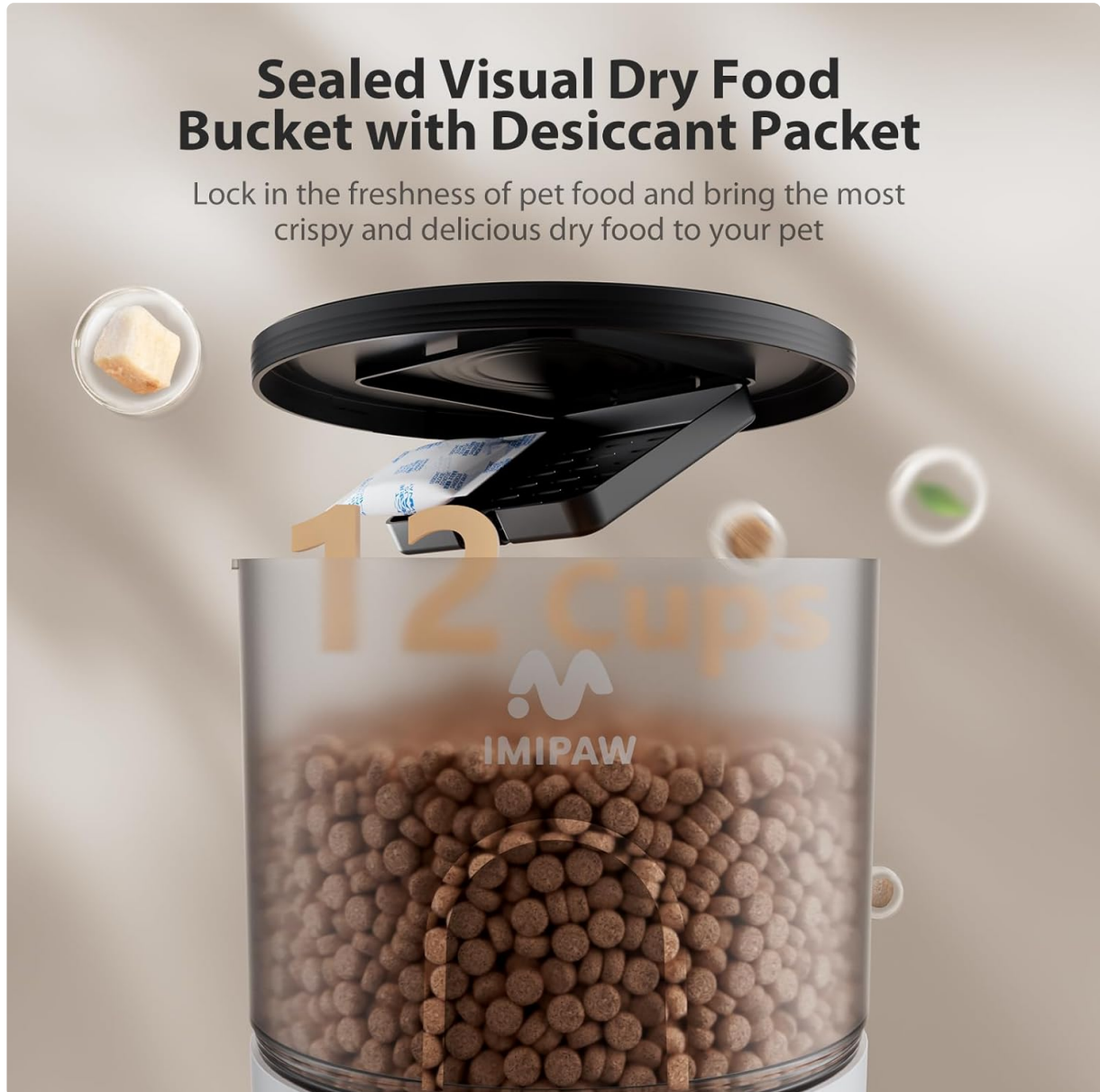
Image 2.1: Exploded view of the IMIPAW Automatic Cat Feeder components, including the main unit, food container, lid, and feeding bowl.

The feeder features a dual rotor structure to prevent food from getting stuck and a six-compartment rotor design for consistent portions. The internal tilt angle ensures smooth food delivery.