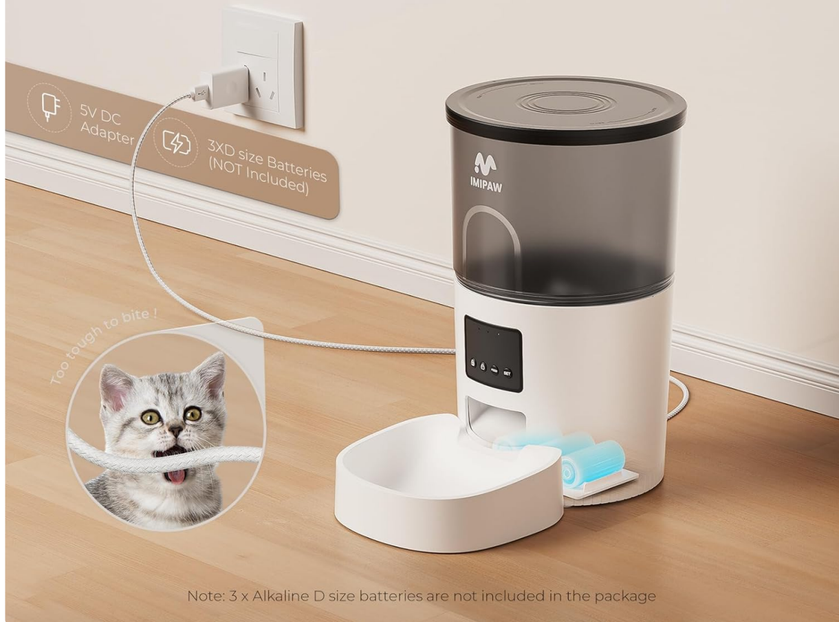
Image 3.2: Illustration of the dual power supply options, showing connection to a 5V/1A adapter and the location for 3x D-size batteries.

Prevent power outages so your pet doesn't miss a meal