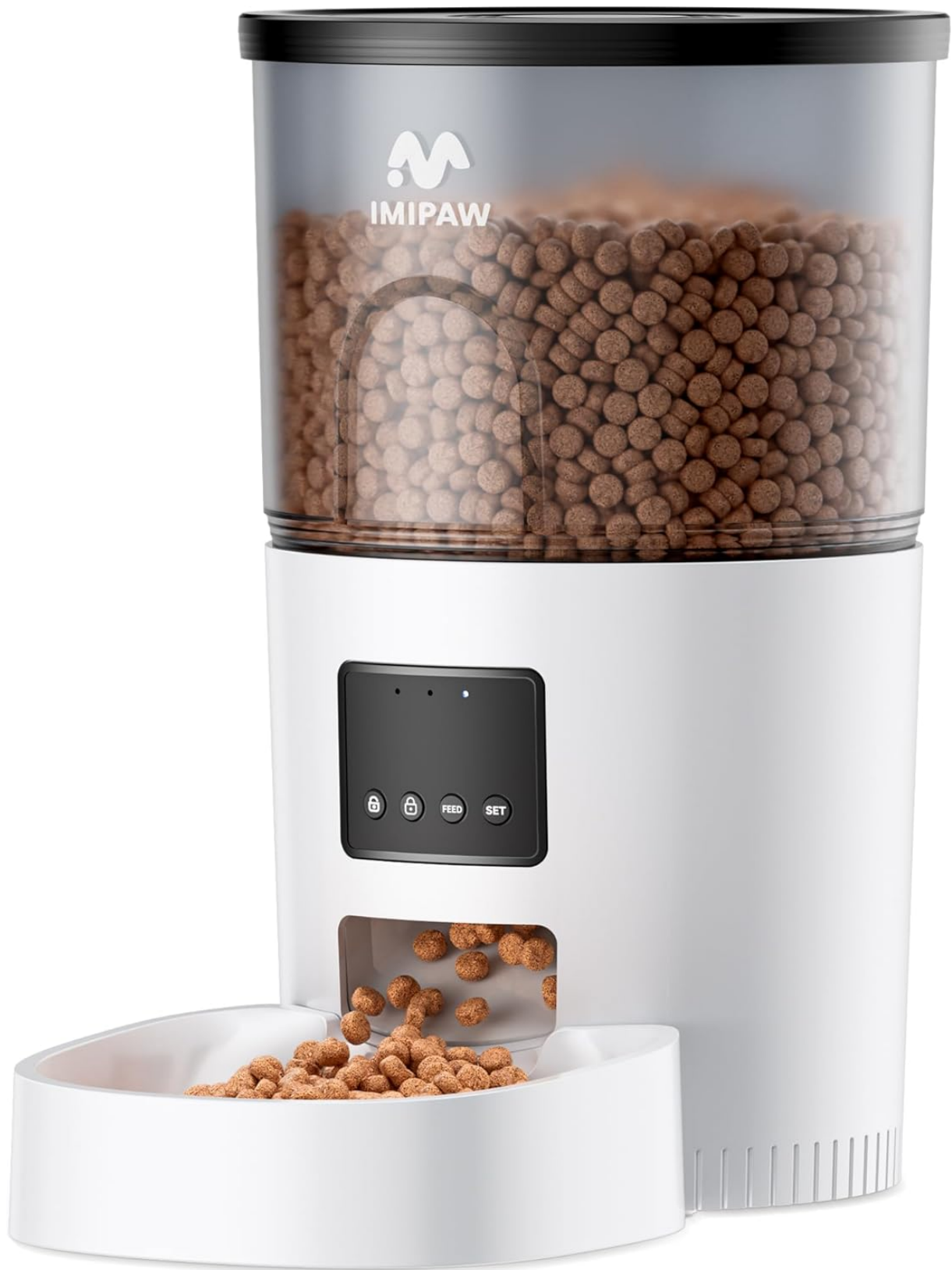
Image 1.1: IMIPAW Automatic Cat Feeder 3L. This image displays the complete feeder unit with the food container filled with kibble and the feeding tray attached.