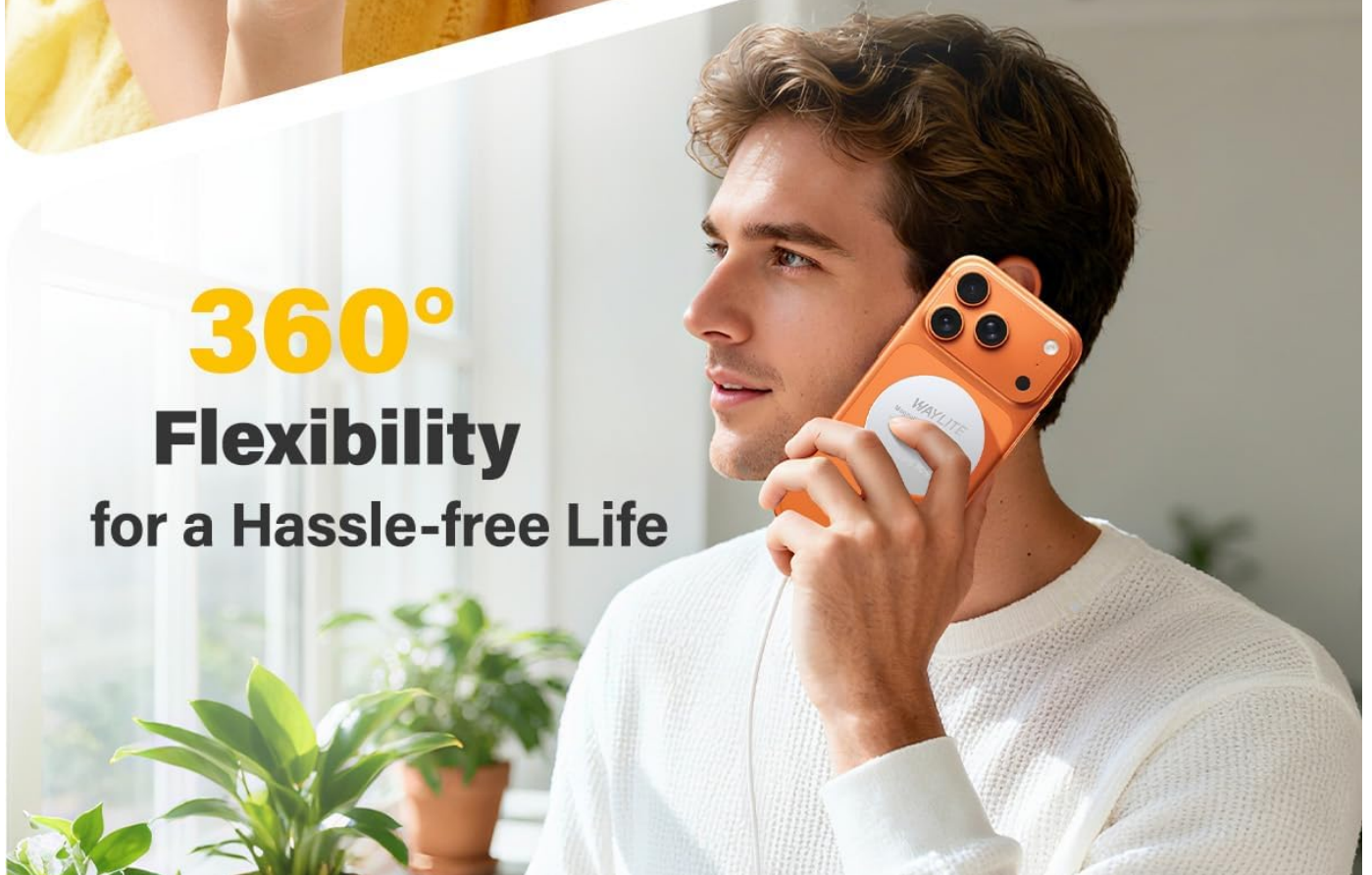
Image: A user demonstrating the 360-degree flexibility of the magnetic charger, allowing for comfortable use in any orientation while charging.