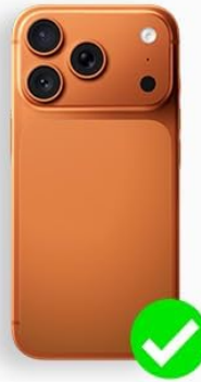
iPhone 12-17 No Case