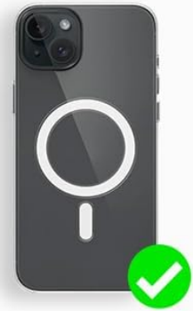
Magsafe/ Magnetic Case