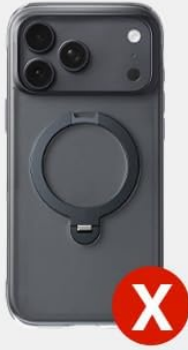
Ring Stand Case