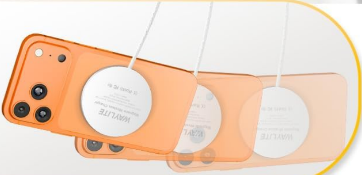
Image: The WayLite 25W Wireless Charger emphasizing its ultra-strong magnetism for secure device attachment.