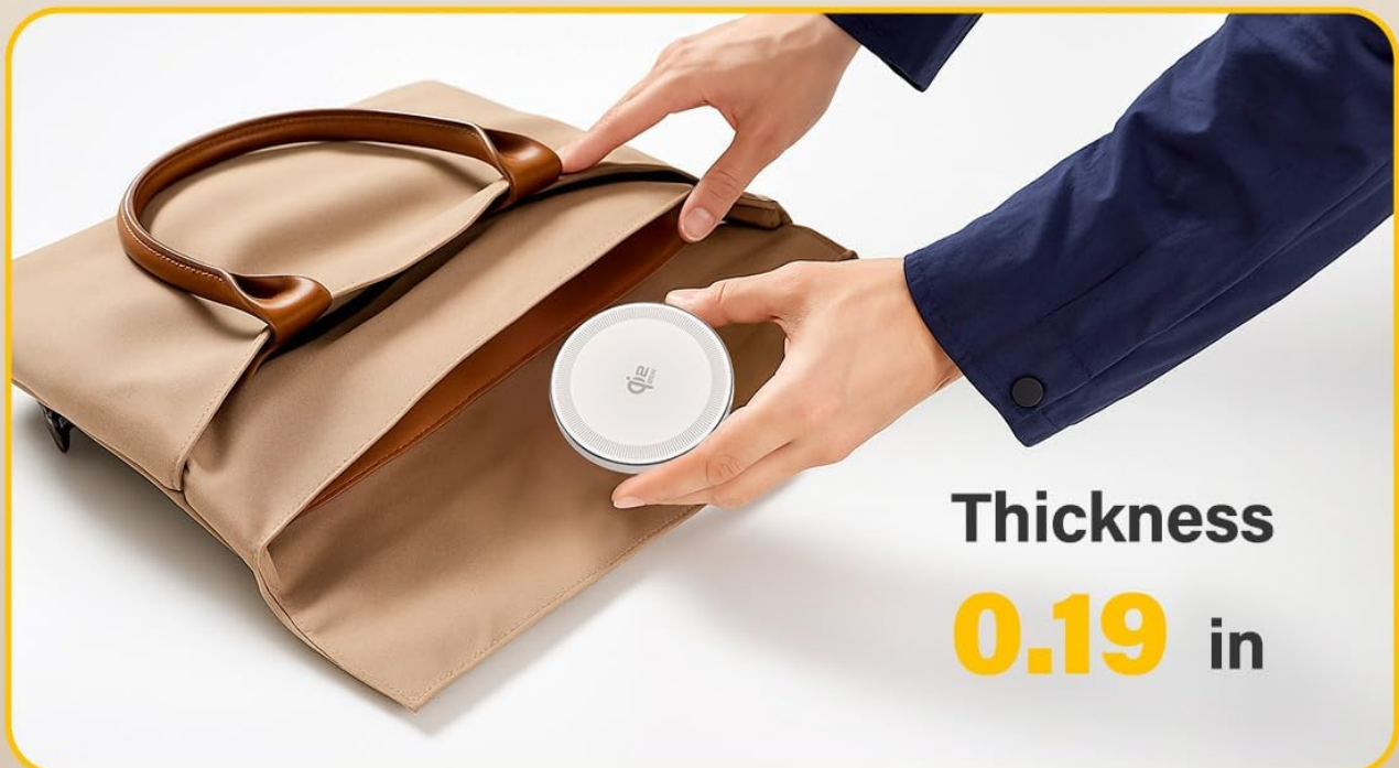
Image: The ultra-slim and portable design of the WayLite 25W Wireless Charger, highlighting its light weight and thin profile.