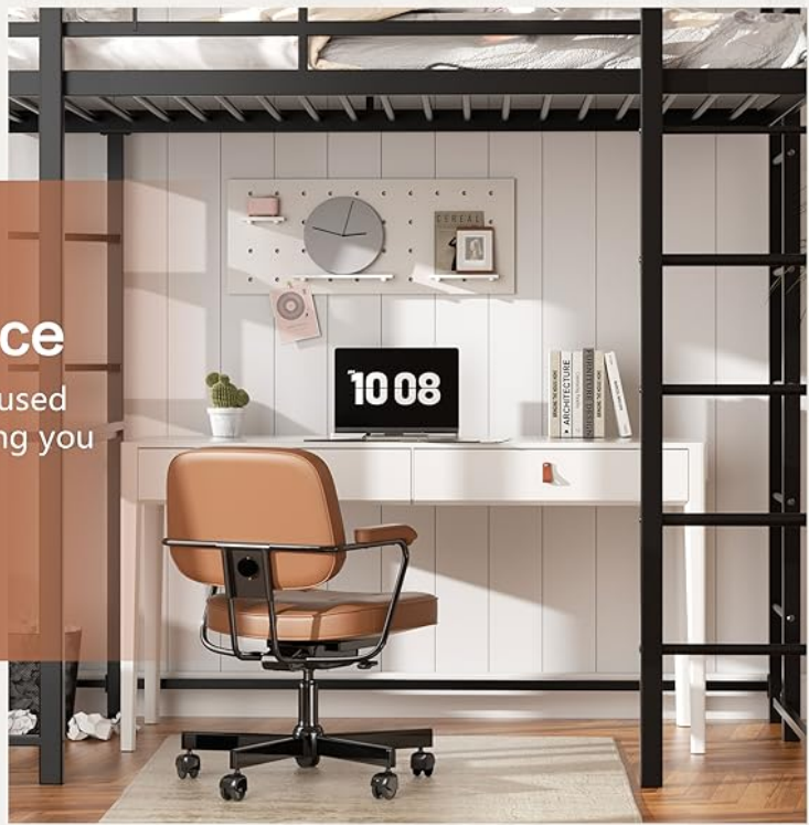
Image: The loft bed provides an expansive area underneath, ideal for a desk and chair, creating a dedicated study or work zone.

The area under the bed can be used for study, work, leisure or anything you want, creating a perfect private space for you