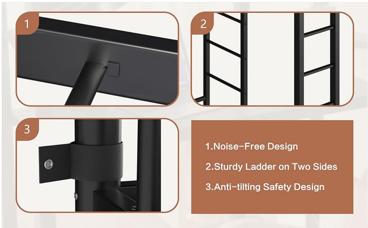
Image: Diagram illustrating key safety and design features, including the noise-free design, sturdy two-sided ladders, and the anti-tilting safety mechanism for wall attachment.