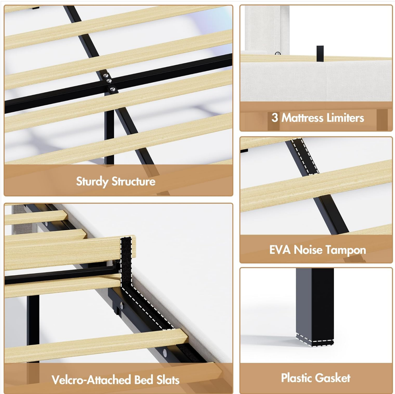
Figure 3.1: Detail of the bed frame's sturdy construction, including slat attachment and noise reduction features.

7. Final Check: Verify all screws and bolts are tightened, and the frame is stable.