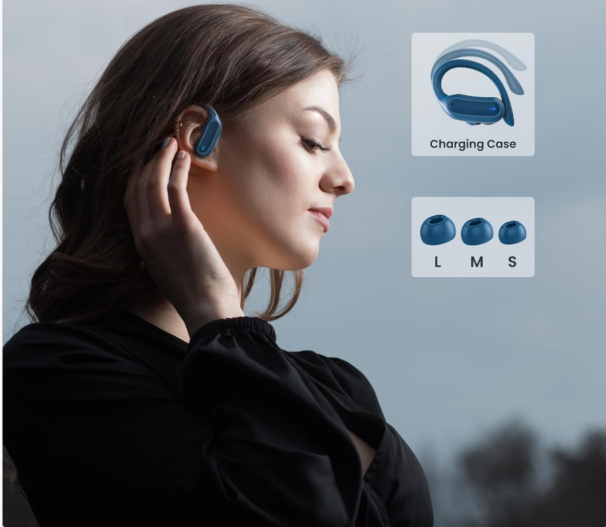
Image: Secure and comfortable fit of the earbuds.

Each earbud is equipped with a noise-cancelling microphone for clear calls and touch controls for easy management of audio and calls.