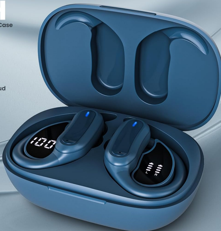
Image: Earbuds and charging case battery life indication.