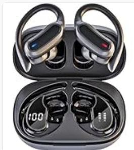
Image: All components included in the TRAUSI i27 Wireless Earbuds package.