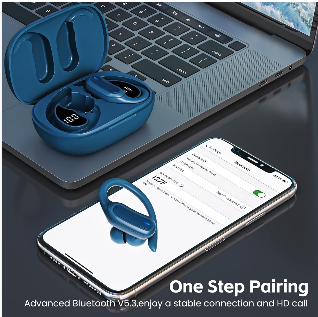
Image: One-step pairing process with a mobile device.