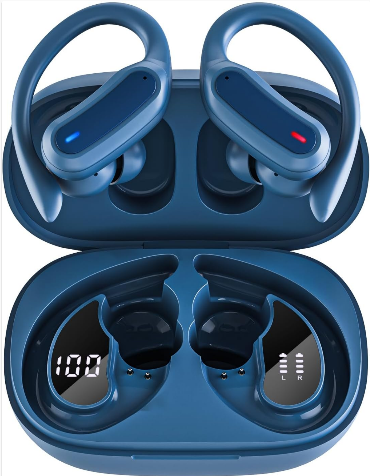
Image: TRAUSI i27 Wireless Earbuds and charging case.

The TRAUSI i27 Wireless Earbuds feature an ergonomic over-ear hook design for secure and comfortable fit, ideal for active use. The charging case is compact and includes an LED display to show battery status.