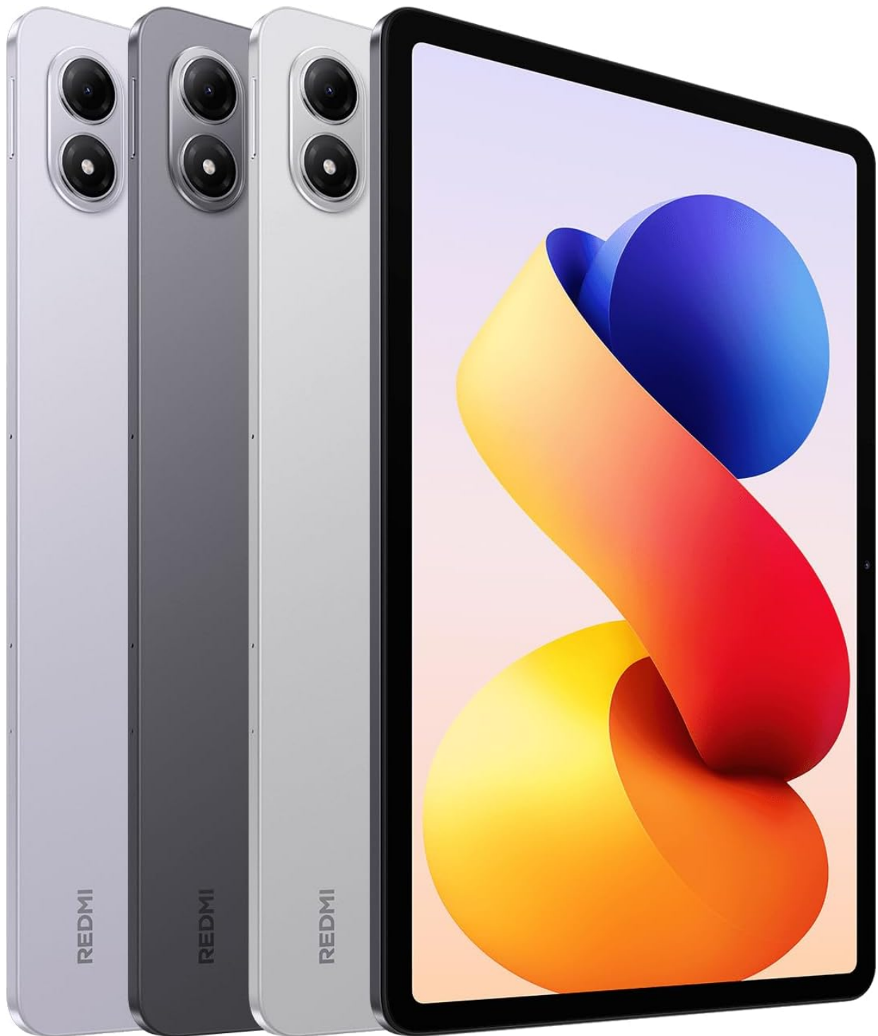
Image: Rear view of the XIAOMI Redmi Pad 2 Pro in silver, highlighting the camera module.