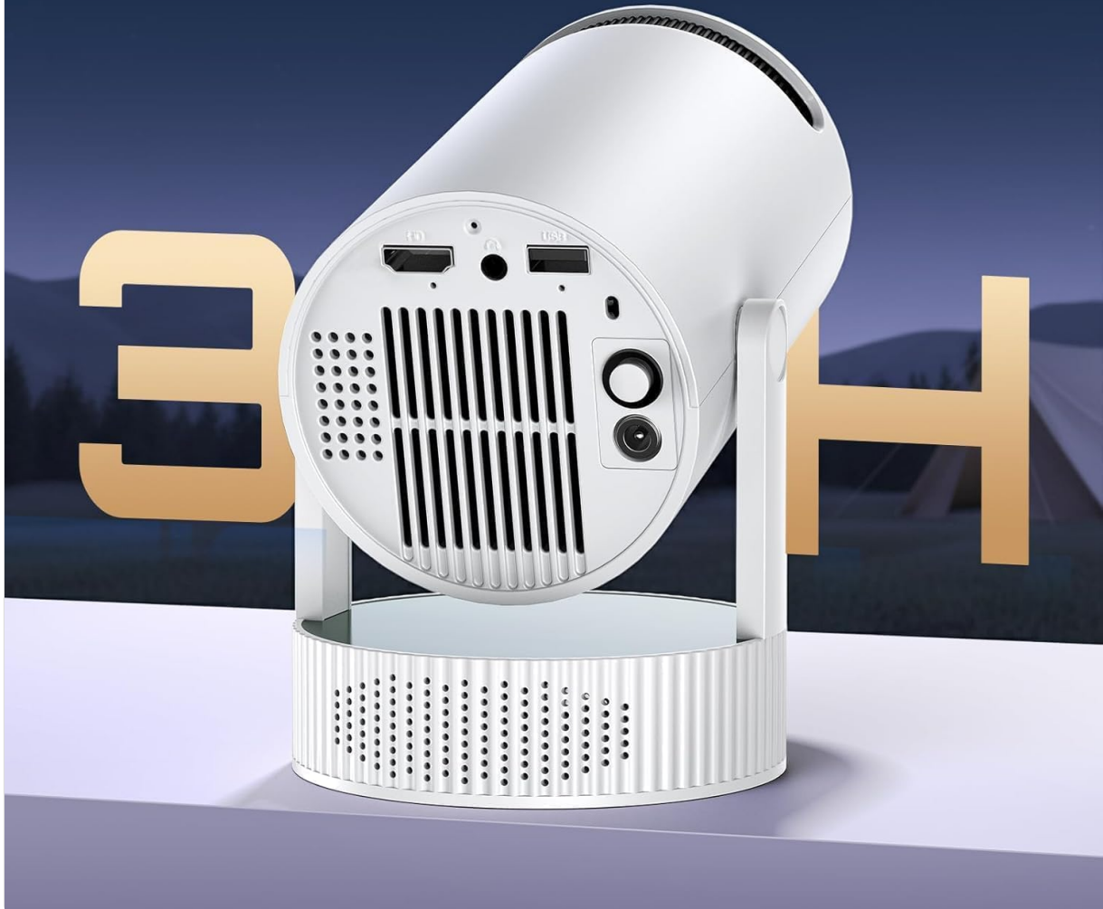
Figure 3: Rear view of the CAMWORLD Mini Projector 09-4K, detailing the HDMI, USB, and power input ports for various connections.

The projector features an HDMI port, a USB port, and a 3.5mm audio port for versatile connectivity. The power input is also located at the rear. A manual focus dial is present for adjusting image clarity.