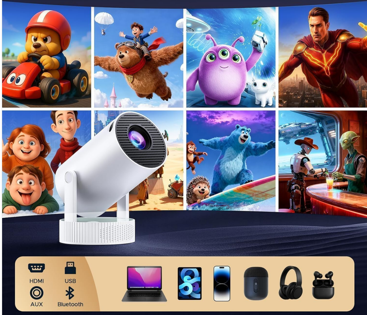
Figure 8: The CAMWORLD Mini Projector 09-4K demonstrating its wide compatibility with various devices via HDMI, USB, and 3.5mm audio ports.

Connect devices like TV Sticks, laptops, gaming consoles, or USB drives to the respective HDMI or USB ports on the projector. Select the correct input source from the projector's menu to display content.