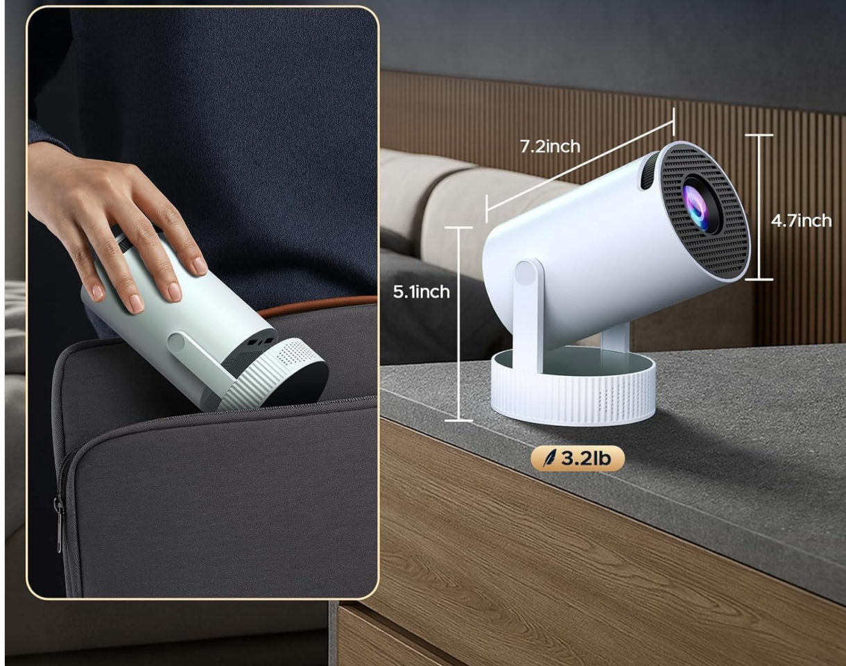
Figure 2: The compact and lightweight design of the CAMWORLD Mini Projector 09-4K, illustrating its portability and ease of transport.