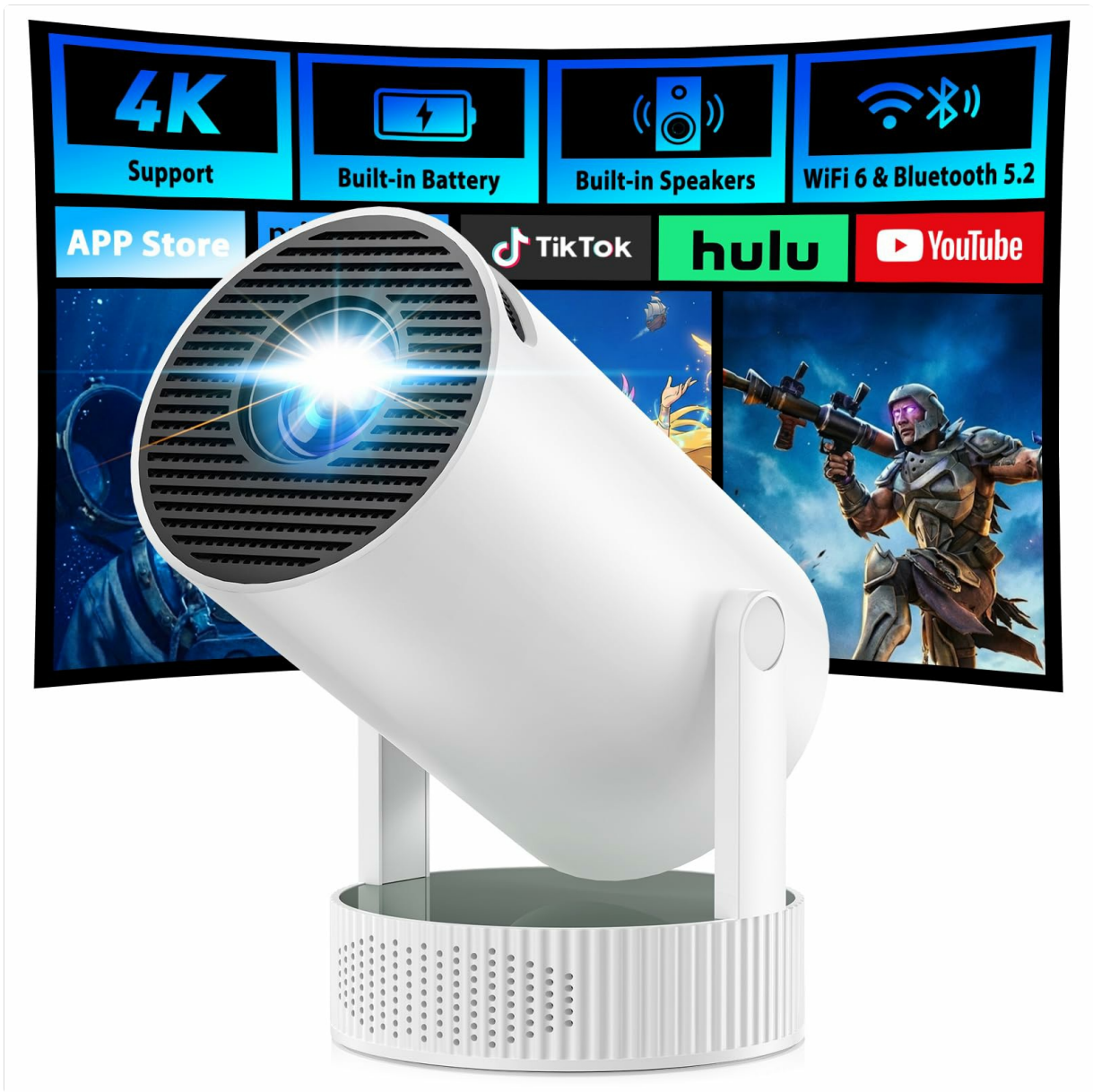
Figure 1: Front view of the CAMWORLD Mini Projector 09-4K, showcasing its sleek design and projection lens.