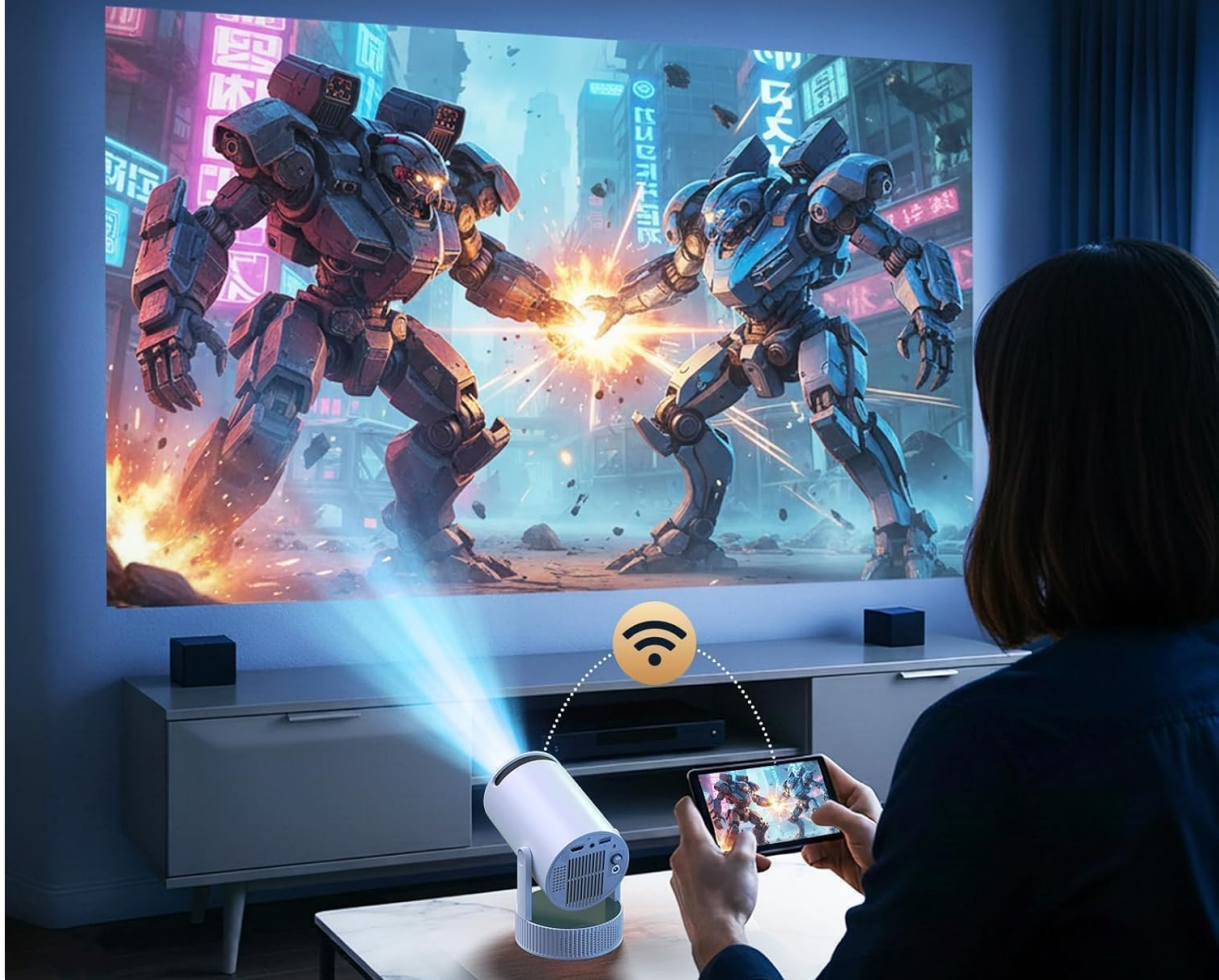
Figure 7: The CAMWORLD Mini Projector 09-4K wirelessly connected to an external Bluetooth speaker, illustrating its capability for an immersive audio experience.

Faster wireless speed,wider range,smoother transmission