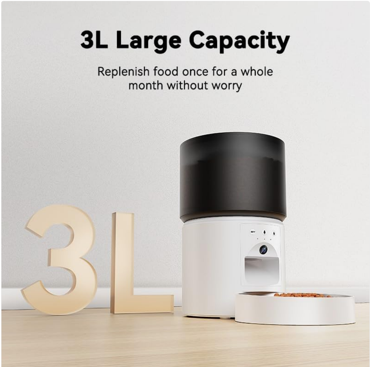
Image: 3L Large Capacity. The feeder's hopper can hold up to 3 liters of dry pet food.