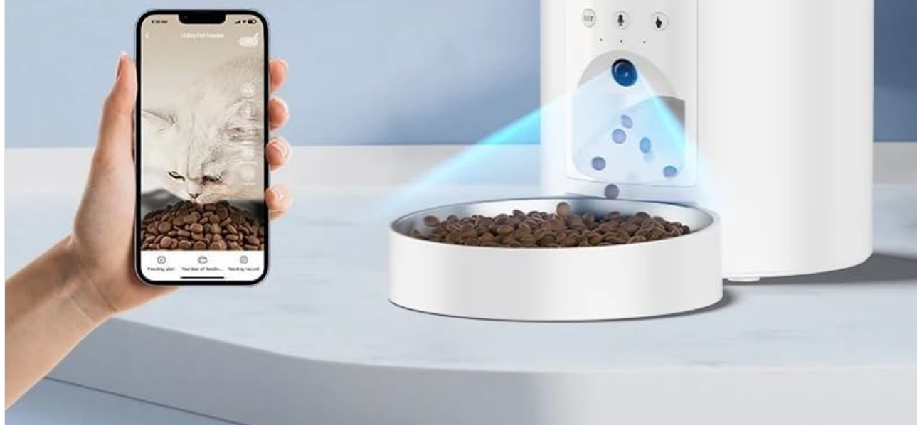
Image: 1080P HD Camera and App Remote Control. The feeder integrates with a mobile app for real-time video, voice, and remote feeding.