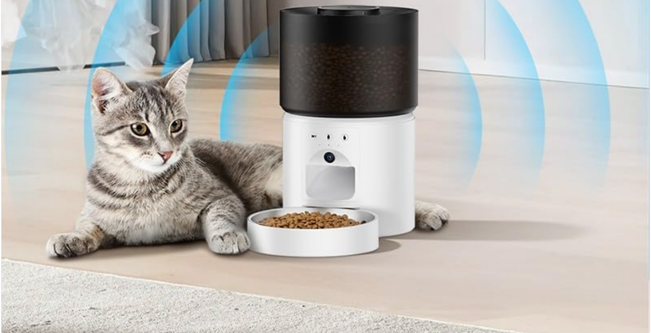
Image: 10S Personalized Meal Call. Record a voice message that plays at mealtime to call your pet.

Record a voicemail (up to 10 seconds) that plays at mealtime, accompanied by your pet anytime, anywhere