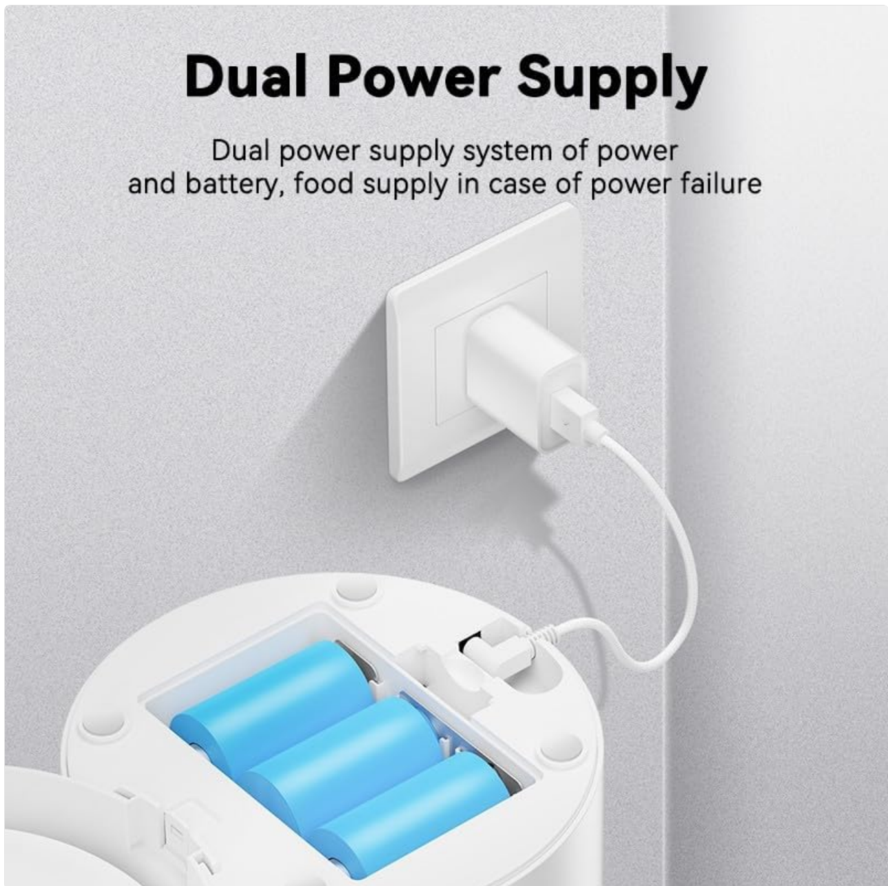
Image: Dual Power Supply. The feeder can be powered by a USB-C adapter or 3 D-cell batteries for backup.