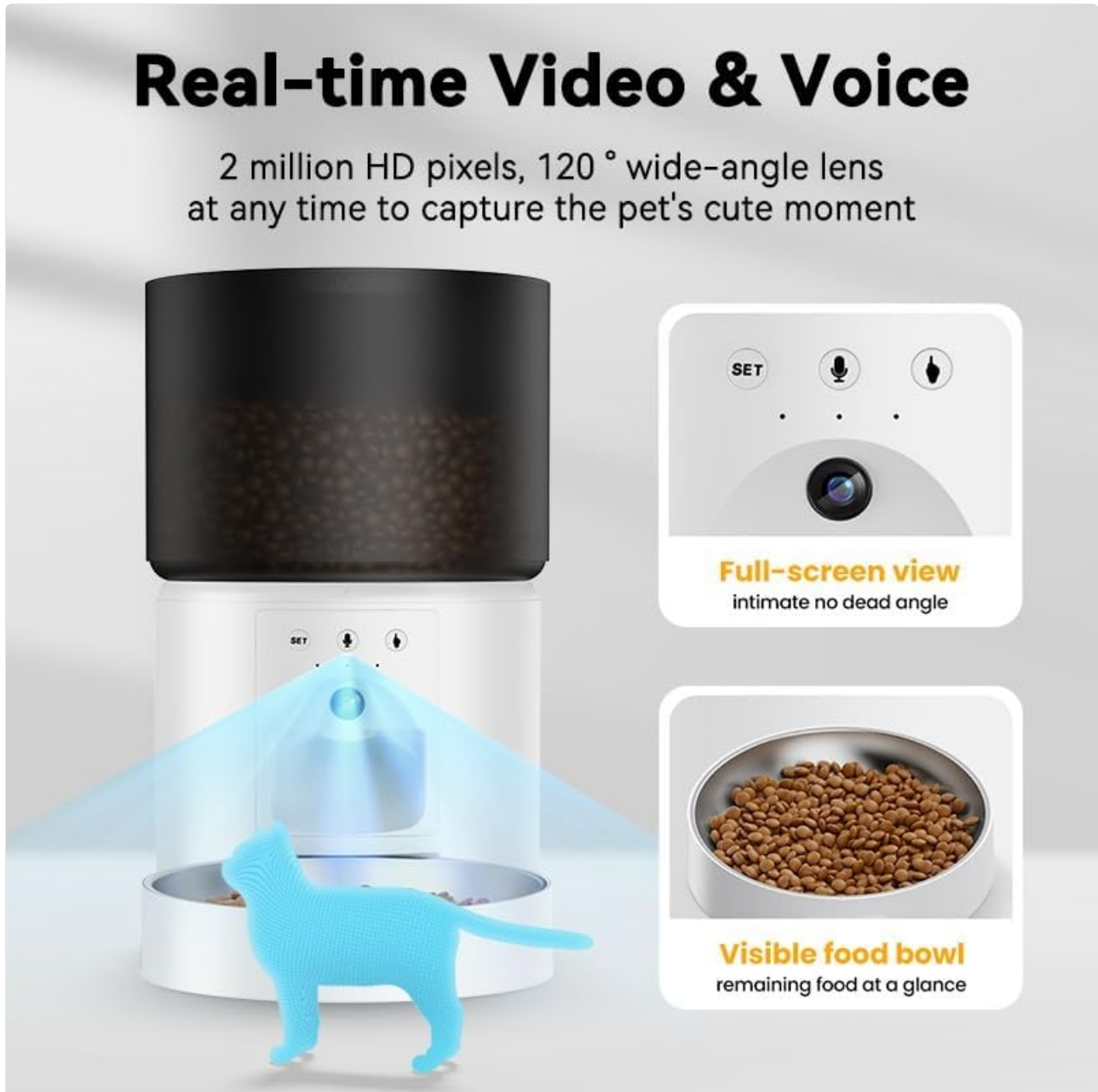
Image: Real-time Video & Voice. The feeder's camera provides a full-screen view, and the food bowl is visible for monitoring.