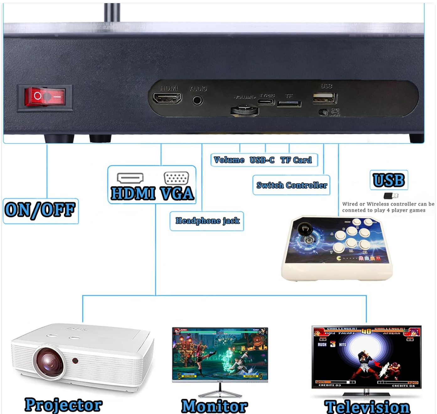
Figure 4.3: Rear Panel Ports and Connectivity