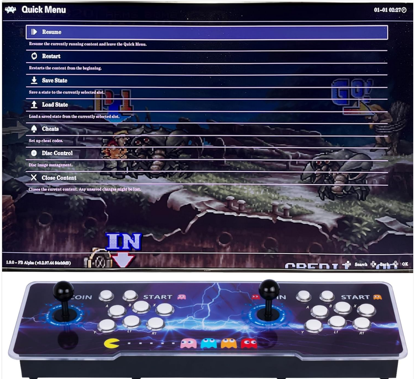
Figure 6.2: Quick Menu for Game Management