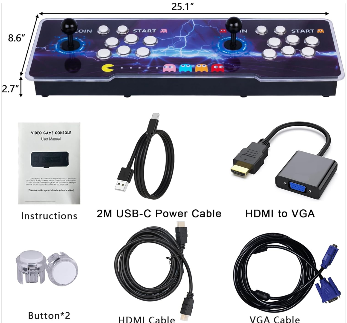
Figure 3.1: Package Contents