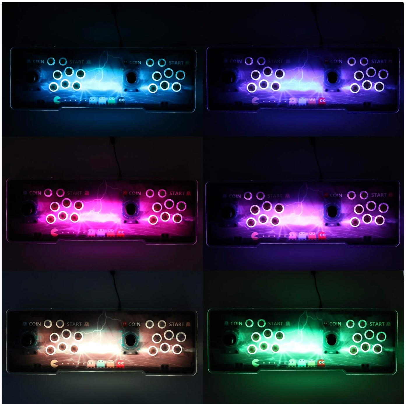
Figure 4.4: Multi-color Backlighting Options