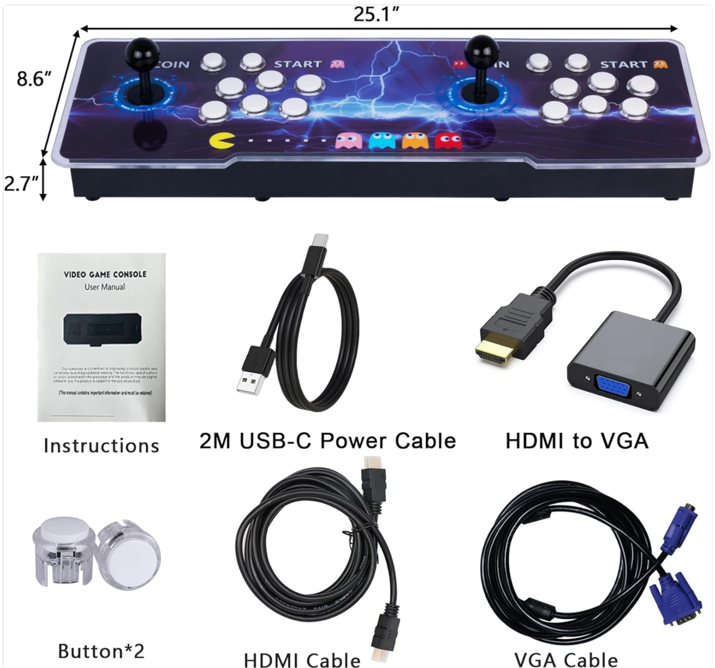
Figure 4.2: Console Dimensions