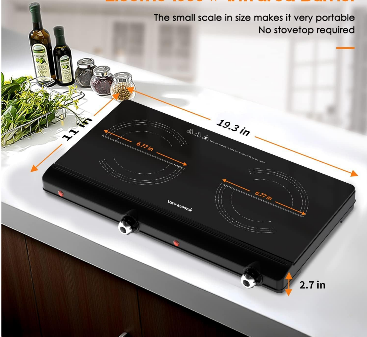
Figure 6: Product dimensions for the Vayepro HP202-T5G.

The small scale in size makes it very portable No stovetop required