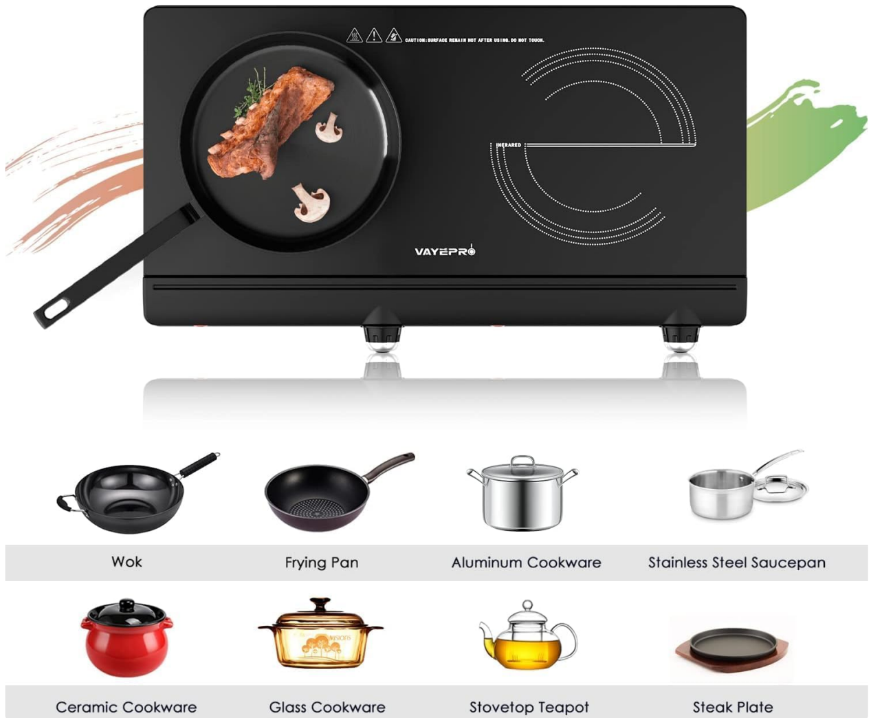
Figure 5: The cooktop is compatible with a wide range of cookware materials.