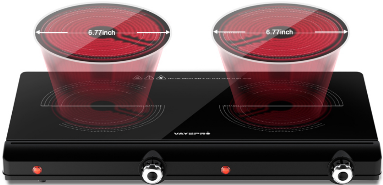
Figure 4: Infrared heating elements glow red when active.