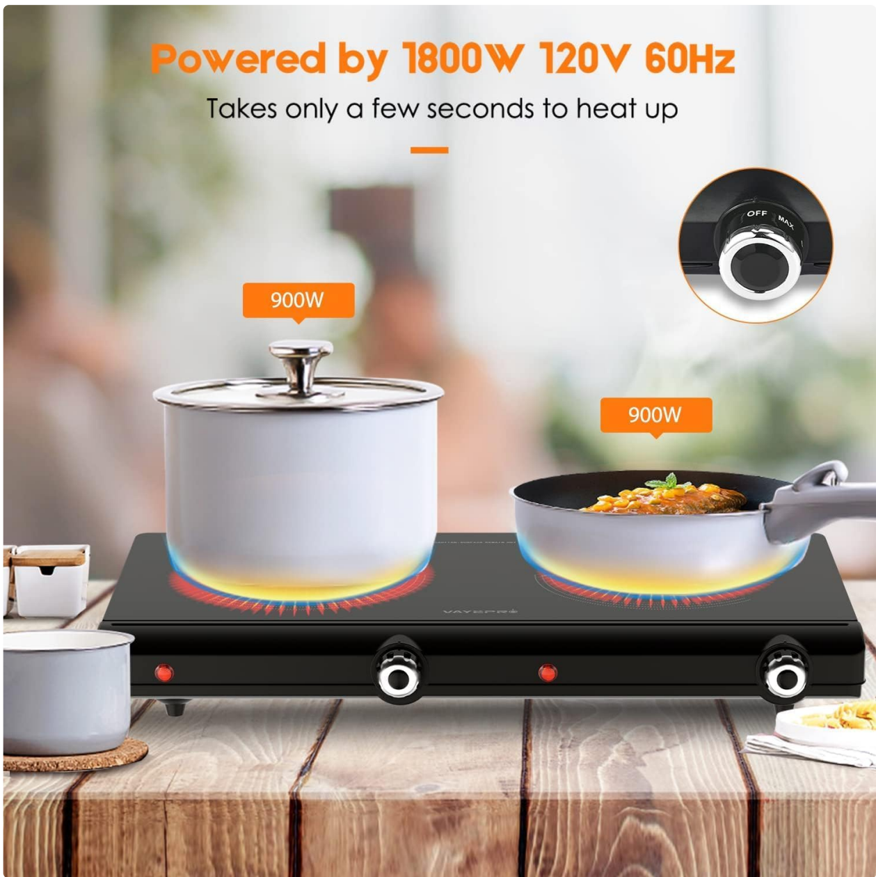
Figure 3: The 1800W power supply ensures rapid heating.