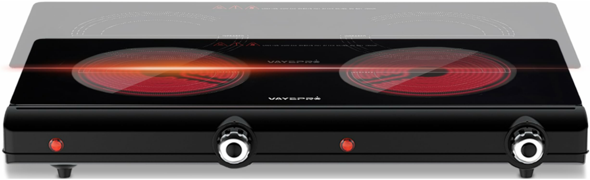
Figure 1: Vayepro HP202-T5G Infrared Double Burner Electric Cooktop.

The Vayepro HP202-T5G features a sleek, compact design with two independent infrared burners, each controlled by its own knob. The ceramic glass surface ensures durability and high heat efficiency.