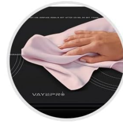
Simply wipe with a clean damp cloth when cool