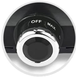
Side Knob Design To Prevent Scalding