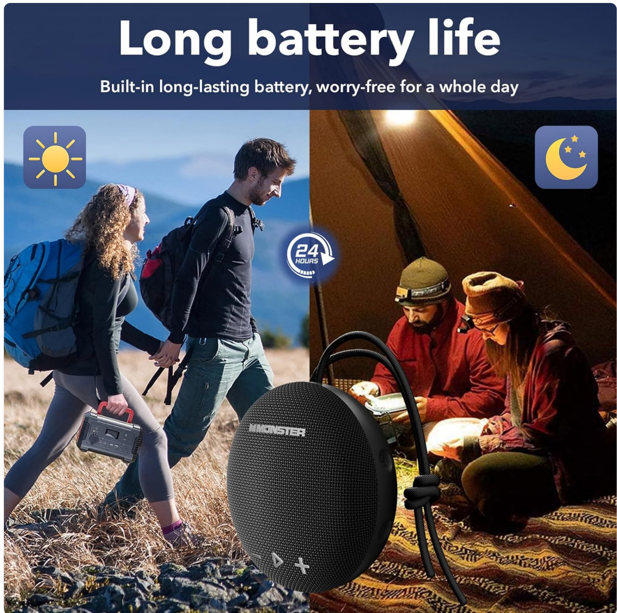
Image: The speaker's front panel with play/pause and volume controls.