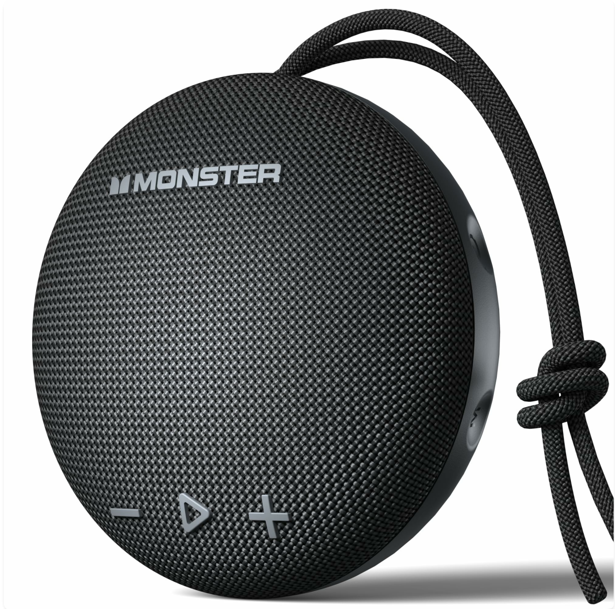
Image: Monster Round One Portable Wireless Speaker in Ink Black.