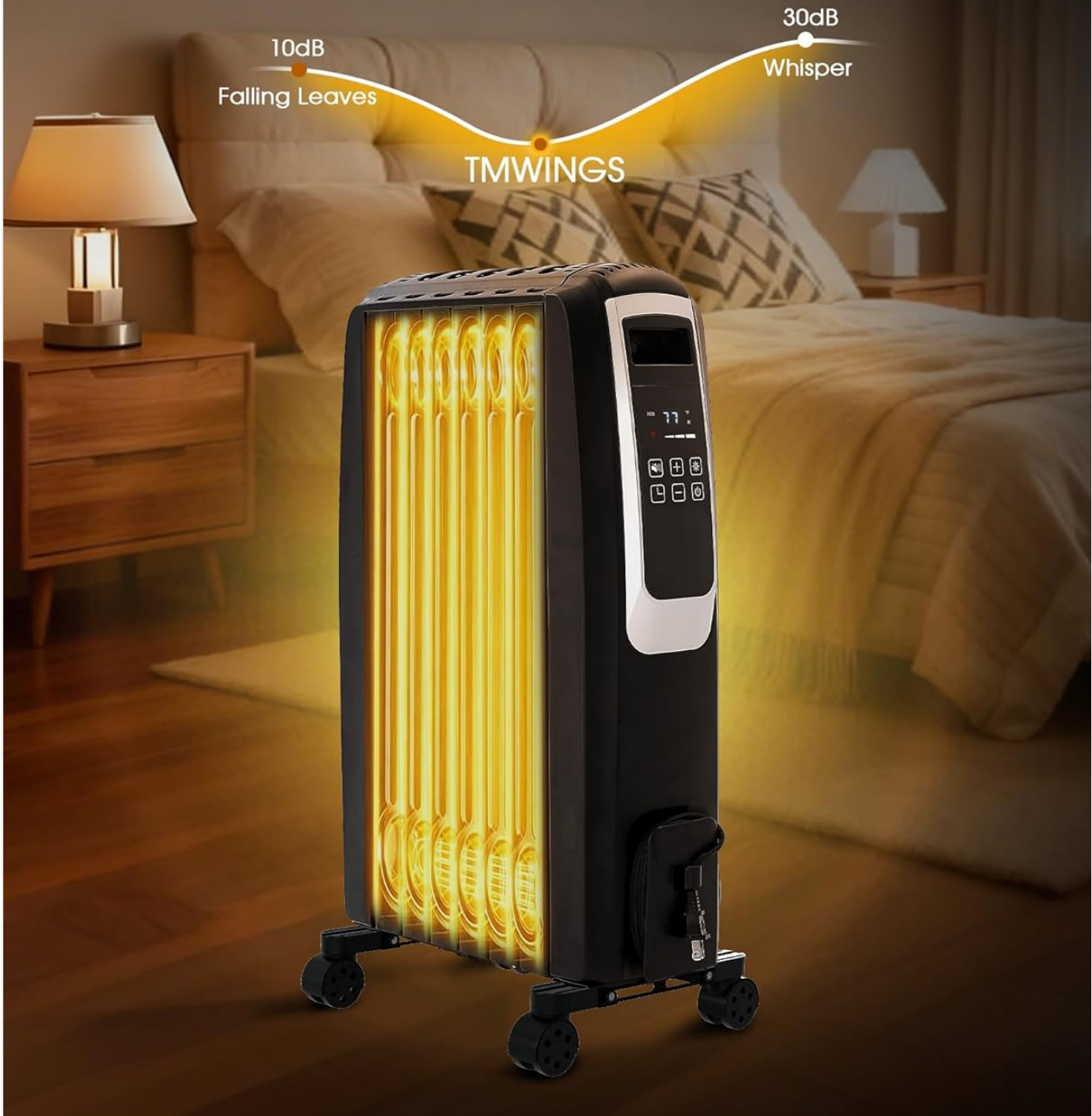
Image: The TMWINGS Oil Filled Radiator Heater in a bedroom setting, with a graphic indicating its ultra-quiet operation (10dB for falling leaves, 30dB for whisper) for warmth without disturbing noise.

Enjoy cozy heat without disturbing noise or drafts