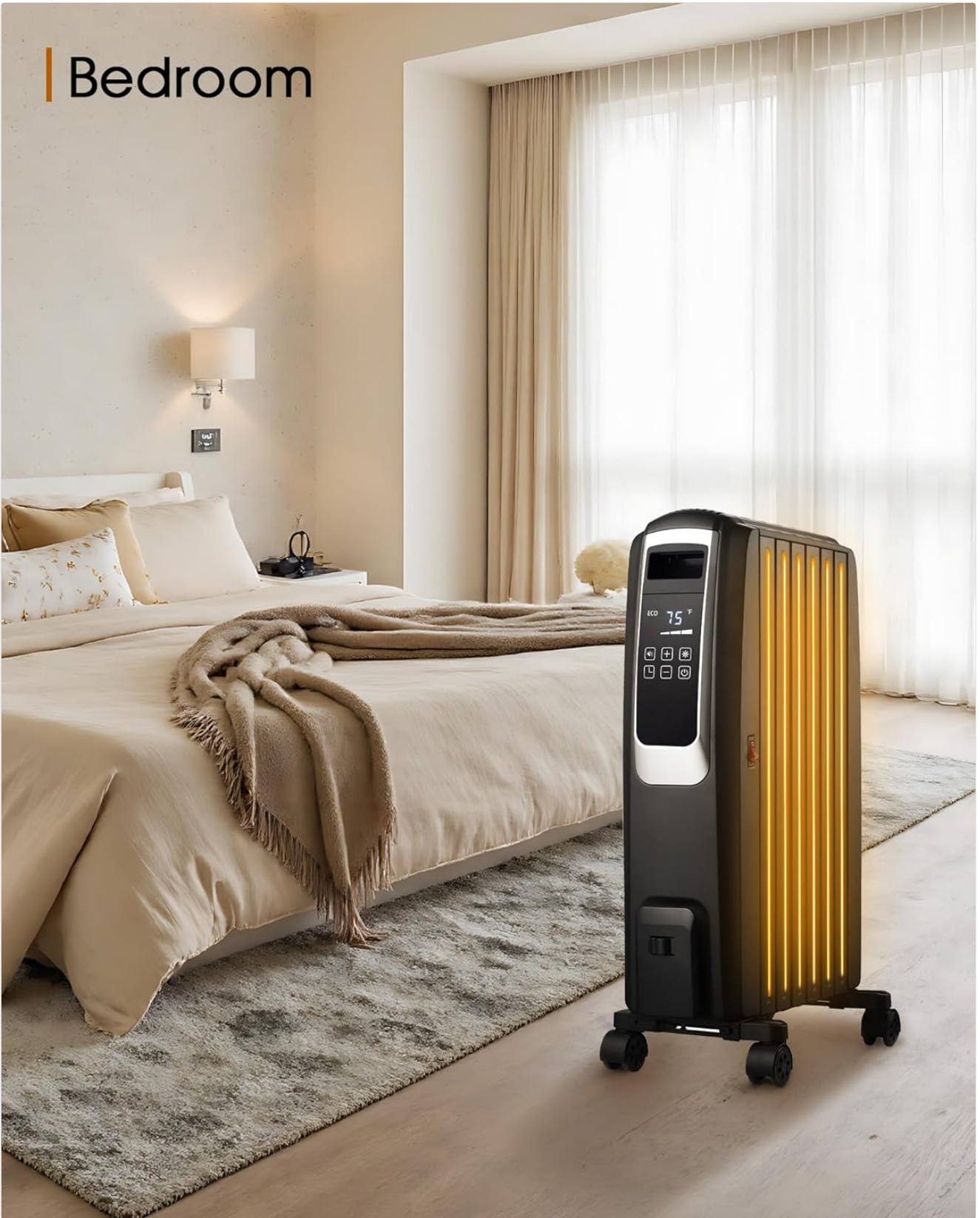
Image: The TMWINGS Oil Filled Radiator Heater placed in a bedroom, illustrating its quiet operation and ability to provide warmth in sleeping areas.