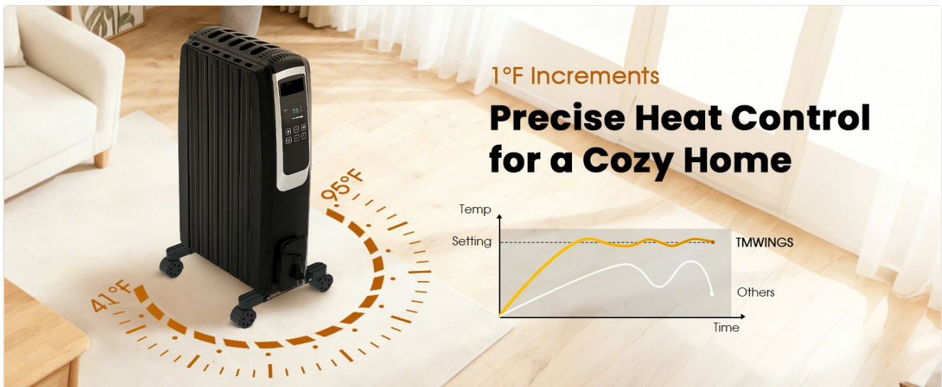
Image: The TMWINGS heater with a graphic illustrating precise heat control in 1°F increments, showing a temperature range from 41°F to 95°F. A graph compares the stable temperature maintenance of the TMWINGS heater against other heaters over time.