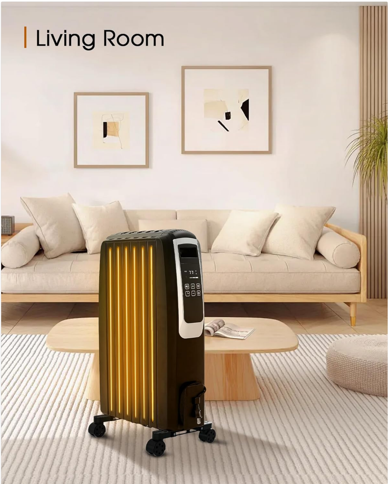
Image: The TMWINGS Oil Filled Radiator Heater positioned in a modern living room setting, demonstrating its suitability for common household areas.