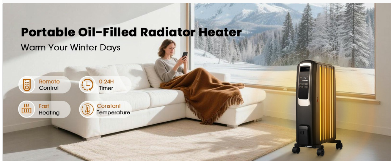
Image: A lifestyle shot of a person using the TMWINGS Portable Oil-Filled Radiator Heater, with icons highlighting key features: Remote Control, 0-24H Timer, Fast Heating, and Constant Temperature. This image provides an overview of the heater's operational benefits.