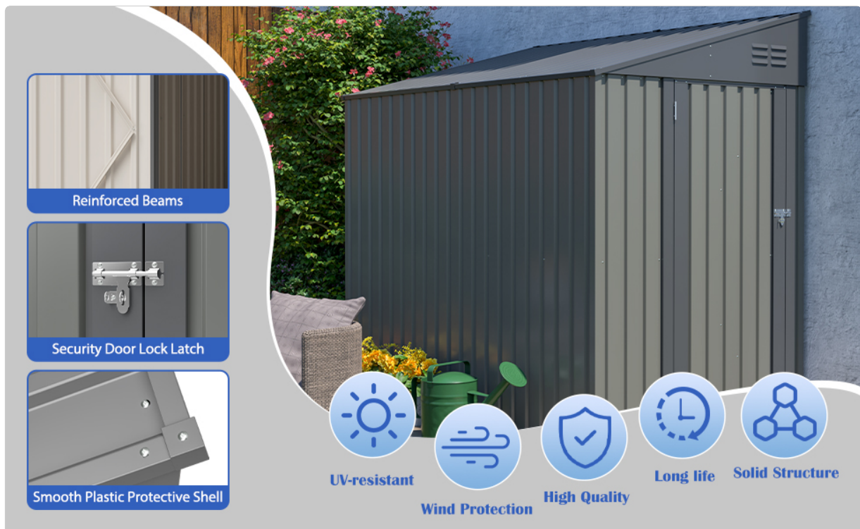
Figure 5: The double-door design provides wide access to the shed's interior.

Attach the double doors using the provided hinges and hardware. Ensure the doors are aligned properly and swing freely. Install the lockable latch mechanism as per the instructions.