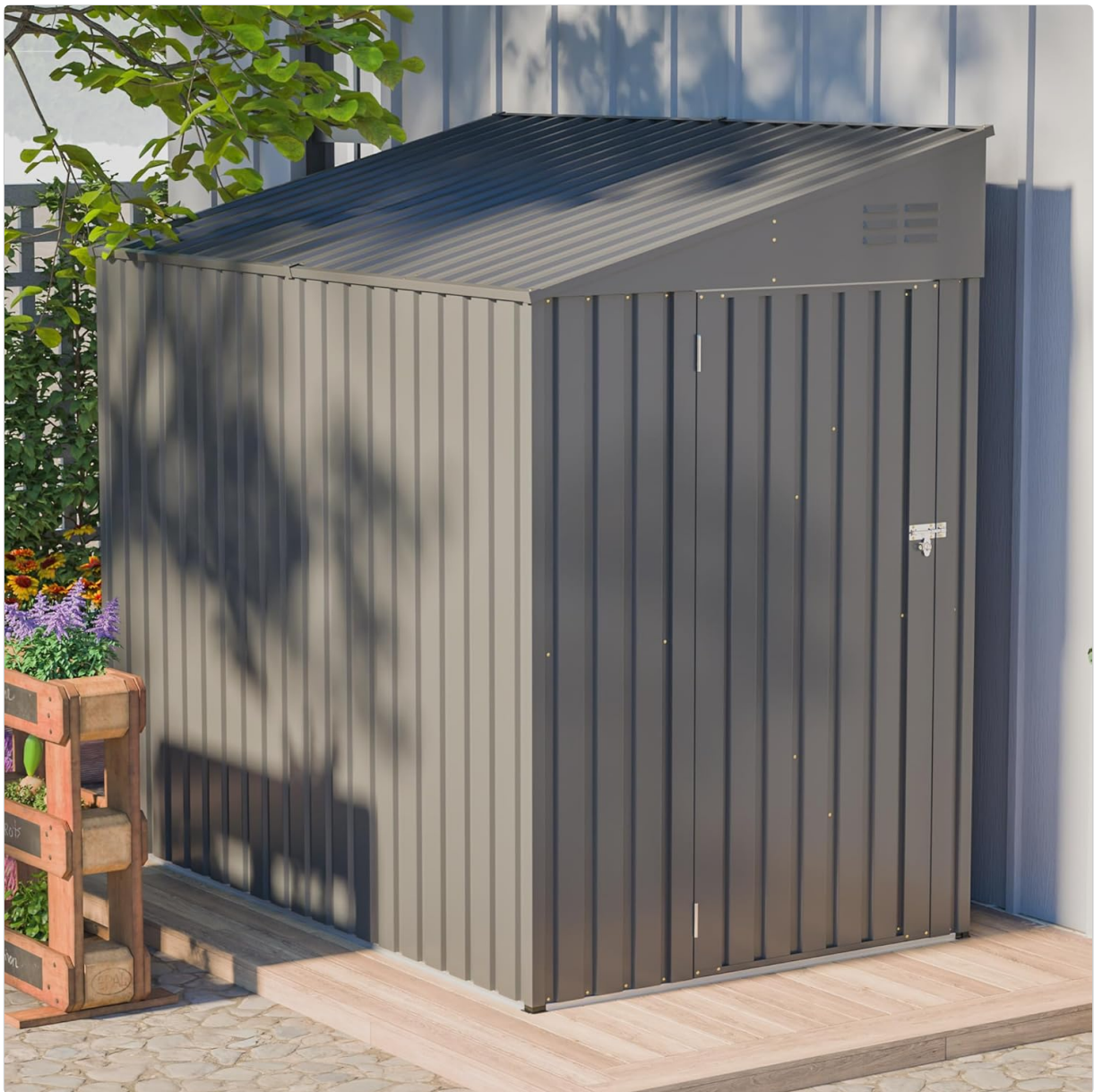
Figure 6: The robust lockable latch provides security for your stored items.

The shed is equipped with a secure lockable door mechanism. You can attach a padlock (not included) to the latch for enhanced security, protecting your stored items from unauthorized access.