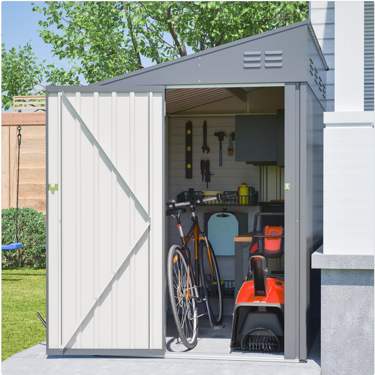
Figure 1: Overall view of the YOPTO 4x7 FT Outdoor Metal Lean-to Storage Shed.