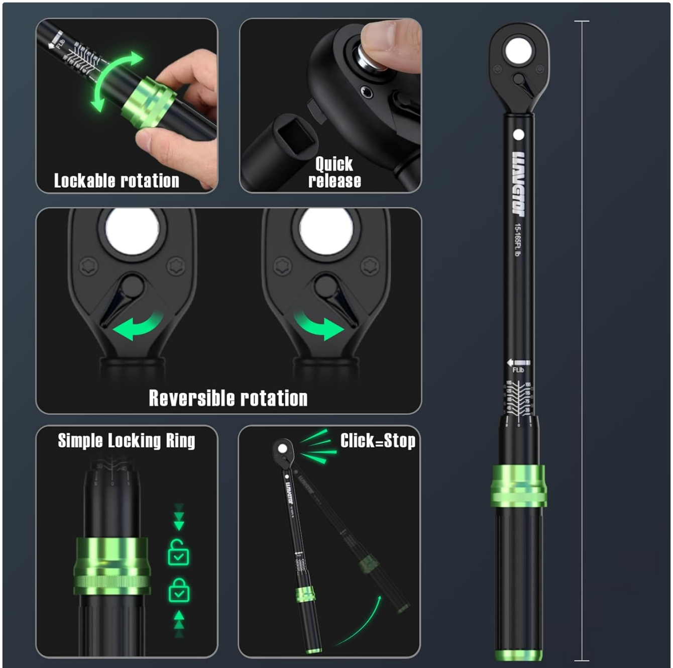
Image 3.1: Quick-release mechanism and reversible rotation feature of the torque wrench head.

To attach a socket or bit, press the quick-release button on the head of the torque wrench, insert the desired socket or bit onto the square drive, and release the button. Ensure the socket or bit is securely locked in place before use.