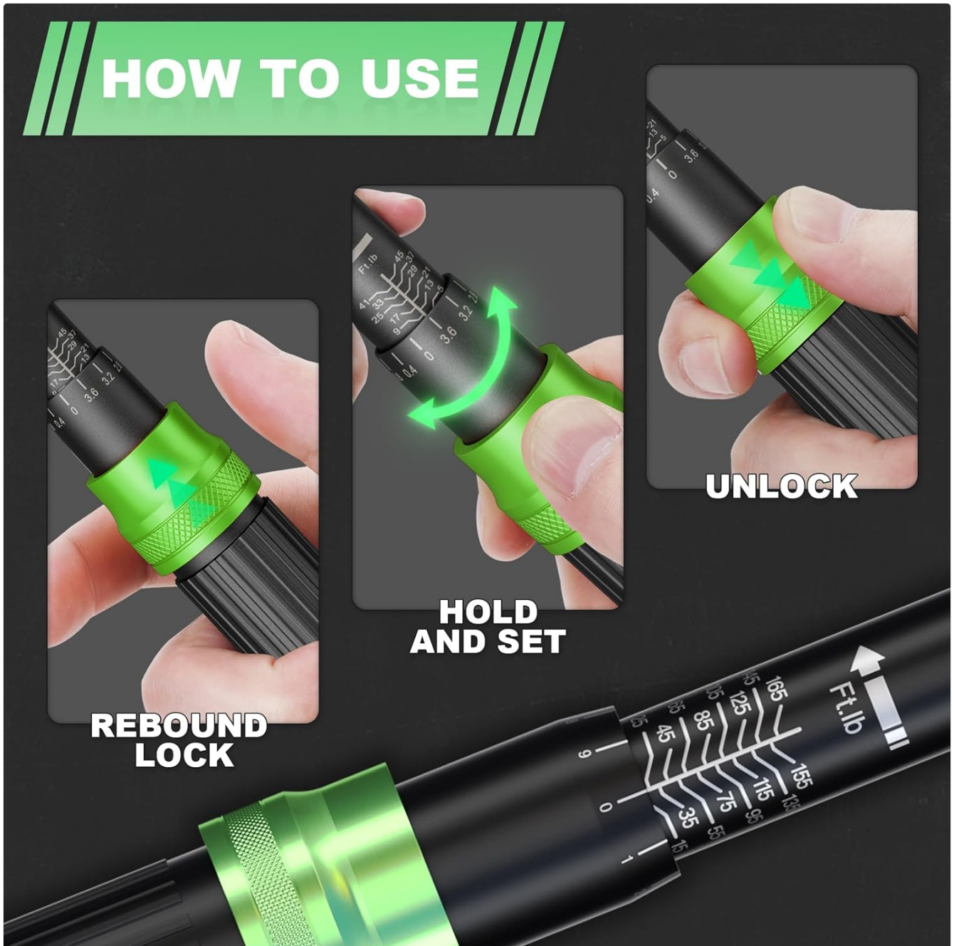
Image 4.1: Step-by-step guide for setting the torque value on the wrench.