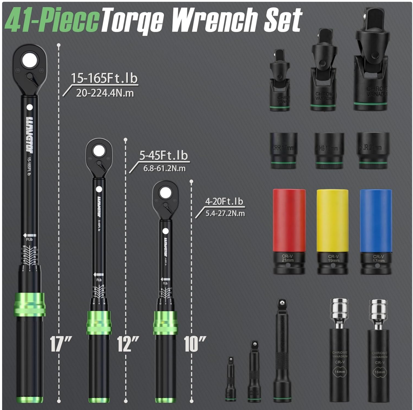
Image 1.1: Overview of the LLAVETOR 41-Piece Torque Wrench Set and its components in the storage case.