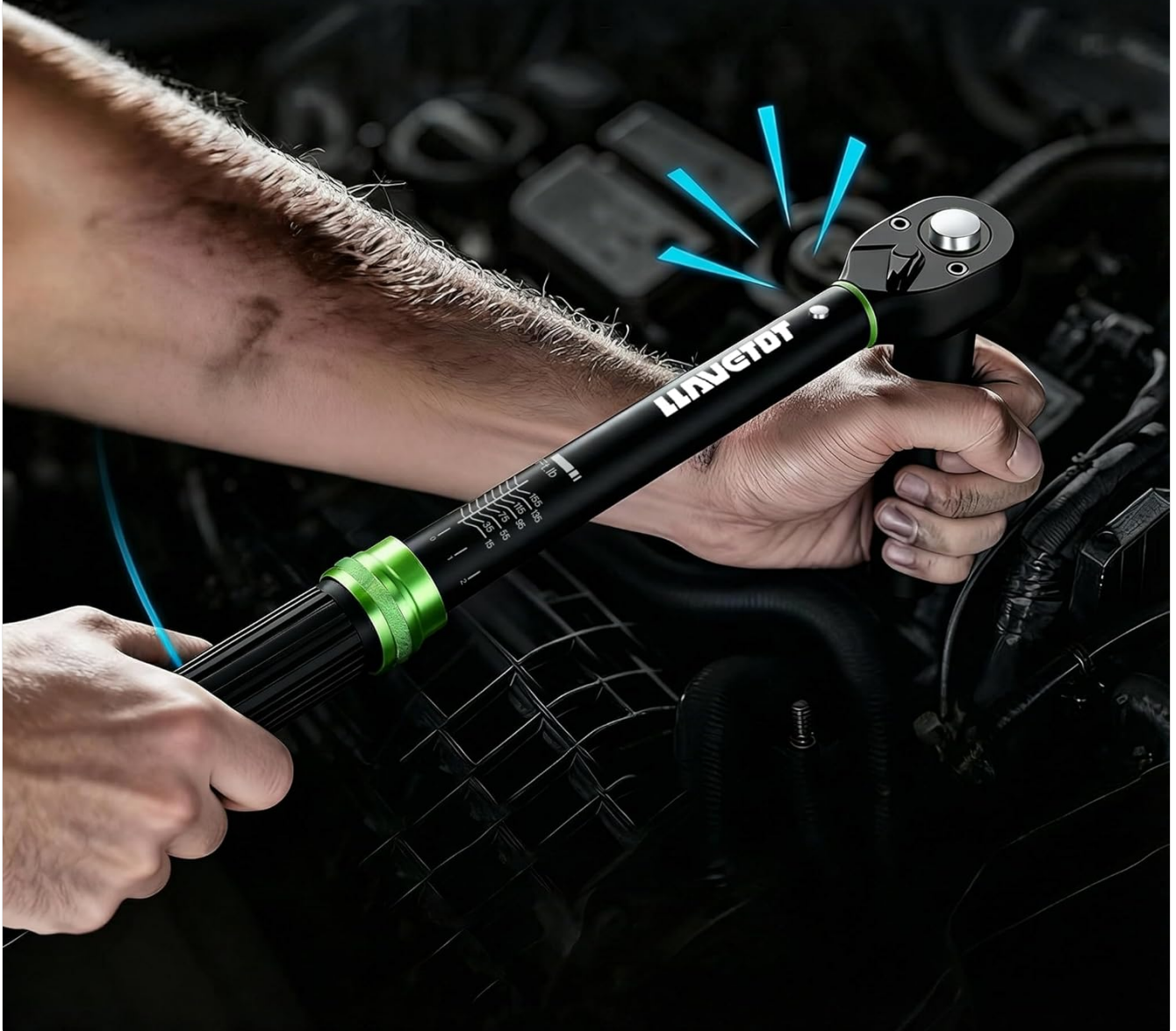
Image 4.2: The "click" sound indicates that the preset torque has been achieved.