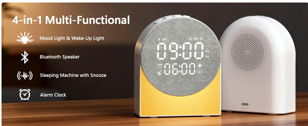
Image: The Gemmac SM16 device showcasing its 4-in-1 multi-functional capabilities including mood light, wake-up light, Bluetooth speaker, sleeping machine with snooze, and alarm clock.

The Gemmac SM16 is a versatile device combining a sunrise alarm clock, white noise sound machine, night light, and Bluetooth speaker. It is designed to enhance your sleep and wake-up experience with its various features.