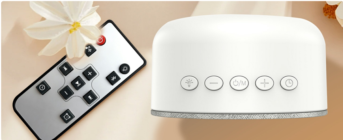
Image: The remote control for the Gemmac SM16, showing buttons for power, volume, track control, light, and alarm settings.

The included remote control provides convenient access to all functions. Refer to the remote control diagram for specific button functions.