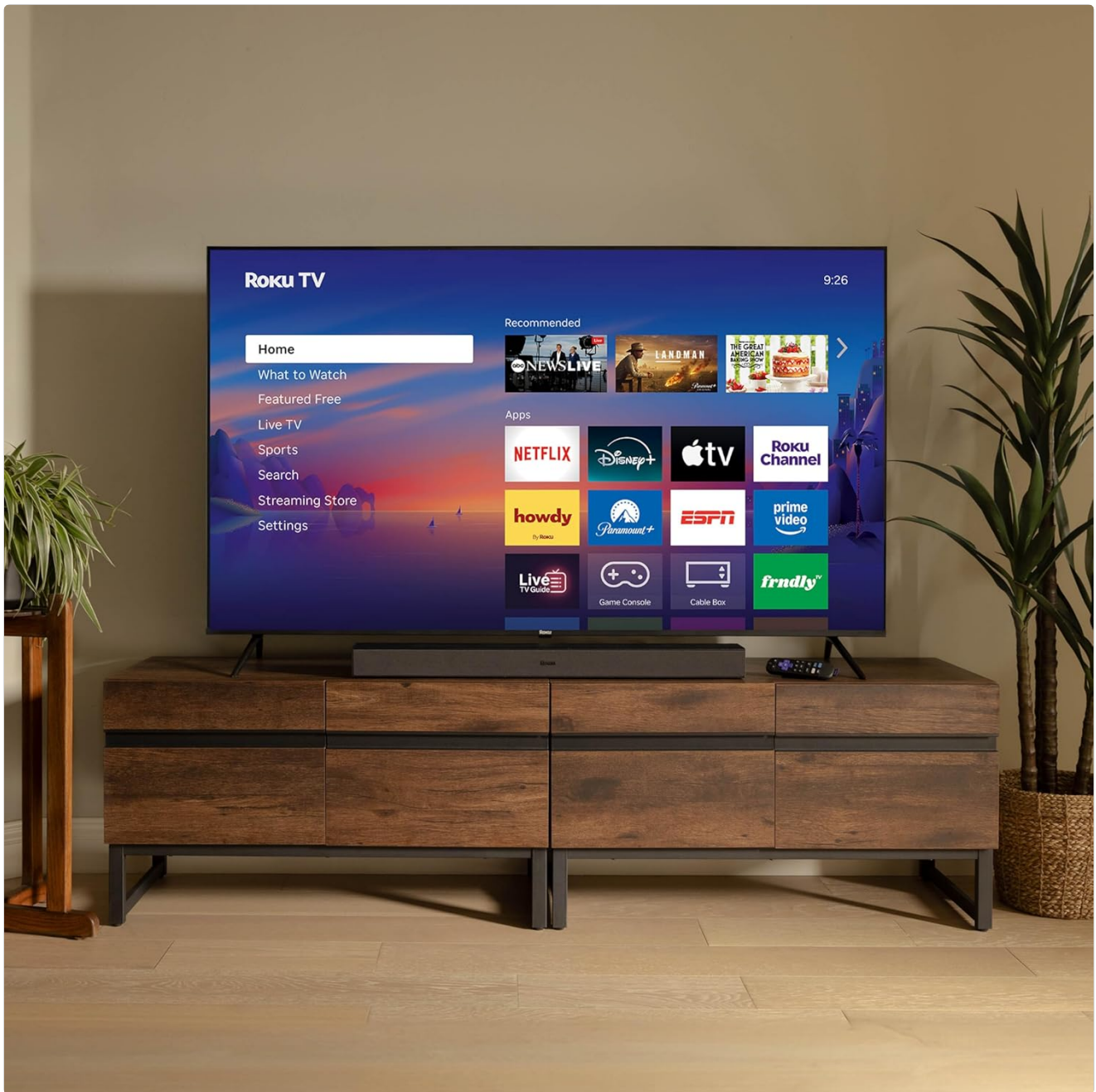
Image: Front view of the Roku 50-Inch Select Series 4K QLED TV on its stands.