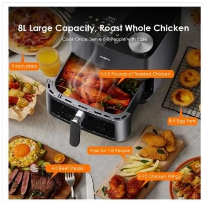
Image: The air fryer basket filled with a whole chicken, surrounded by other cooked items like pizza, fries, steaks, and tarts, demonstrating its 8L large capacity.