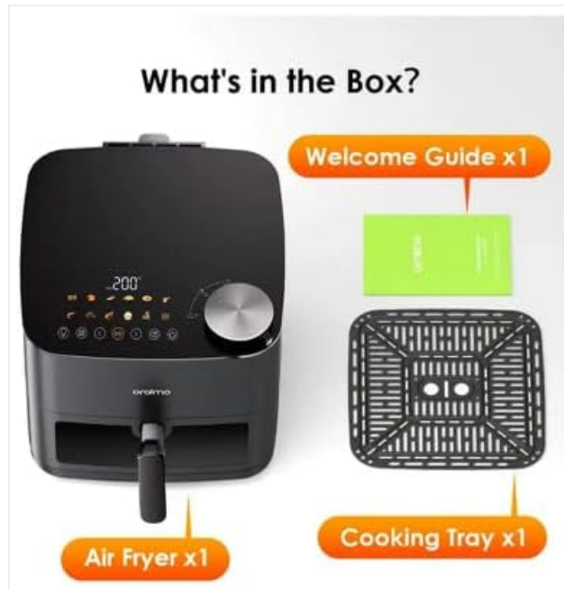
Image: Contents of the product packaging, including the Air Fryer unit, a cooking tray, and the Welcome Guide.