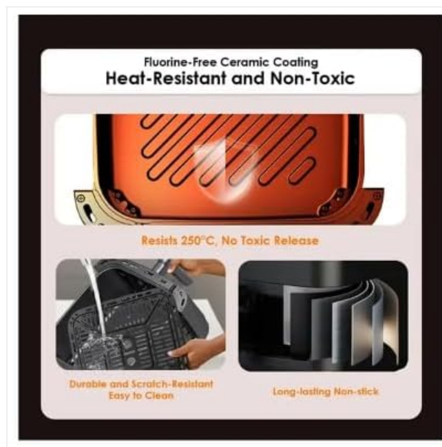
Image: Details about the fluorine-free ceramic coating, highlighting its heat resistance up to 250°C, non-toxic properties, durability, scratch resistance, and non-stick surface for easy cleaning.