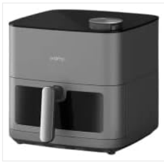
Image: Front view of the Oraimo NutriFry Max Air Fryer OAF-501A, showcasing its sleek design and digital control panel.