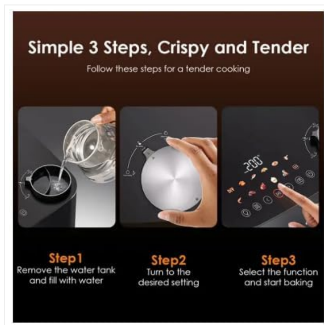
Image: A three-step visual guide showing how to use the air fryer: Step 1: Remove water tank and fill with water. Step 2: Turn knob to desired setting. Step 3: Select function and start cooking.