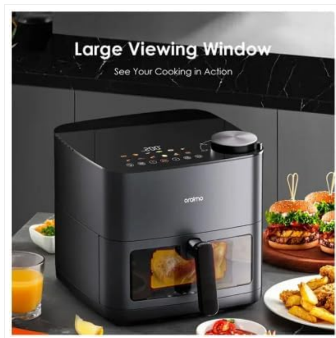
Image: The Oraimo Air Fryer in a kitchen setting, highlighting its large transparent viewing window, allowing users to monitor cooking progress.