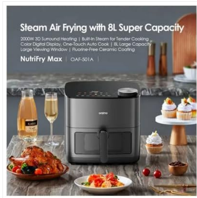
Image: The Oramo NutriFry Max Air Fryer shown with various cooked foods, emphasizing its steam air frying capability and 8L capacity.