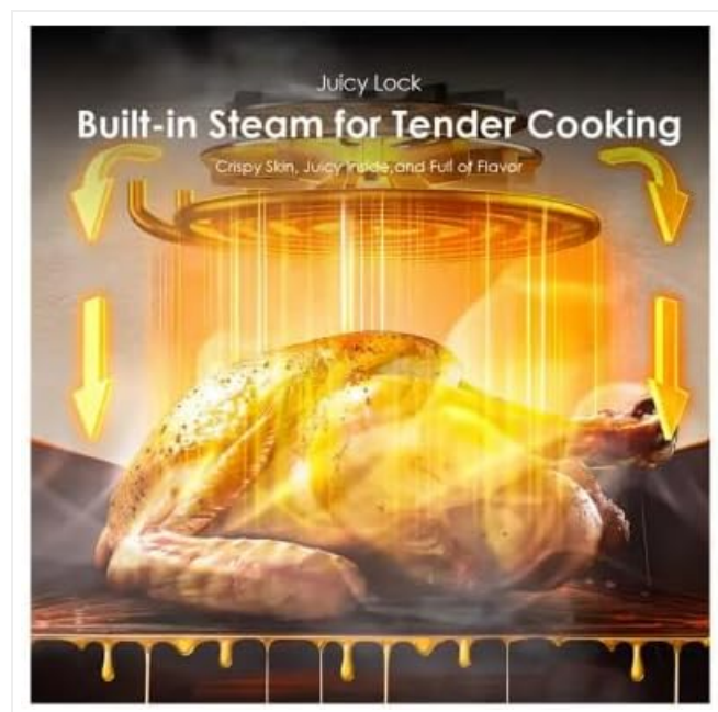
Image: Diagram illustrating the Built-in Steam function, showing steam circulating to ensure tender and juicy results while maintaining a crispy skin.