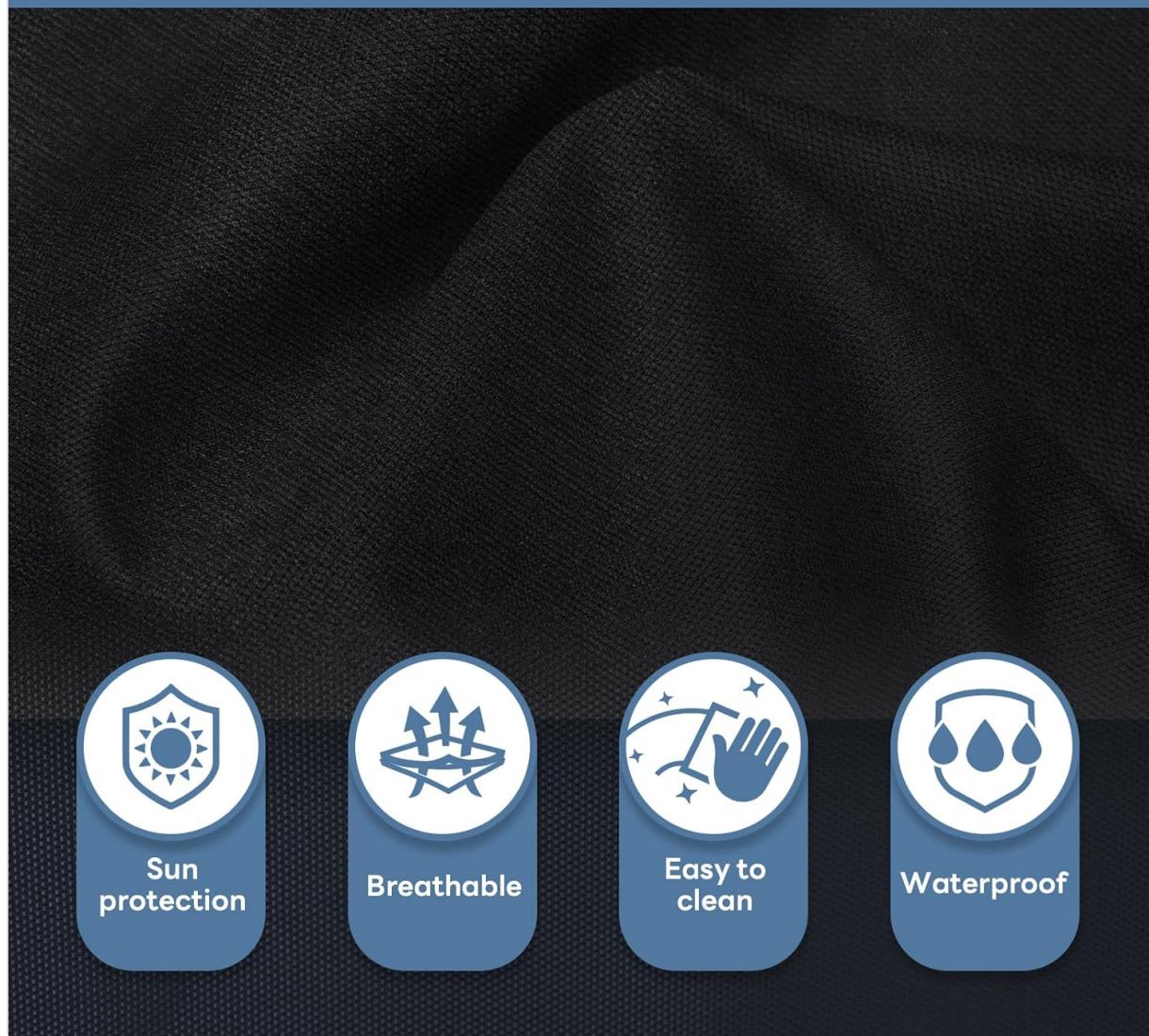
Image: Close-up of the fabric material highlighting its breathable, sun-protective, easy-to-clean, and waterproof properties.