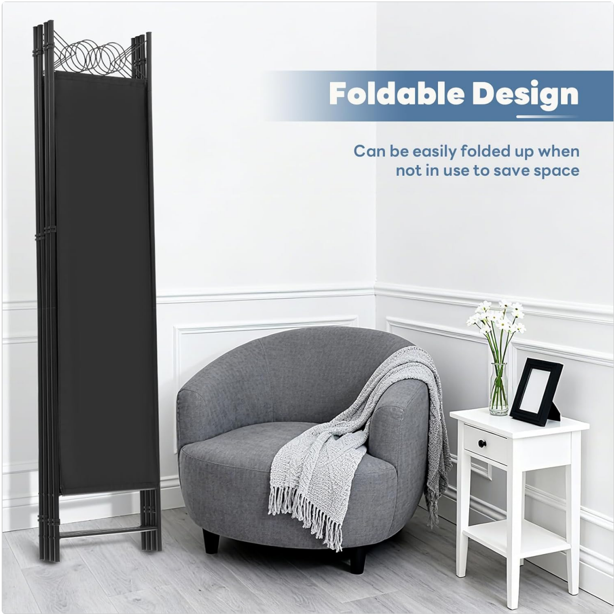
Image: The room divider shown in its folded, compact state, positioned for storage.

Can be easily folded up when not in use to save space