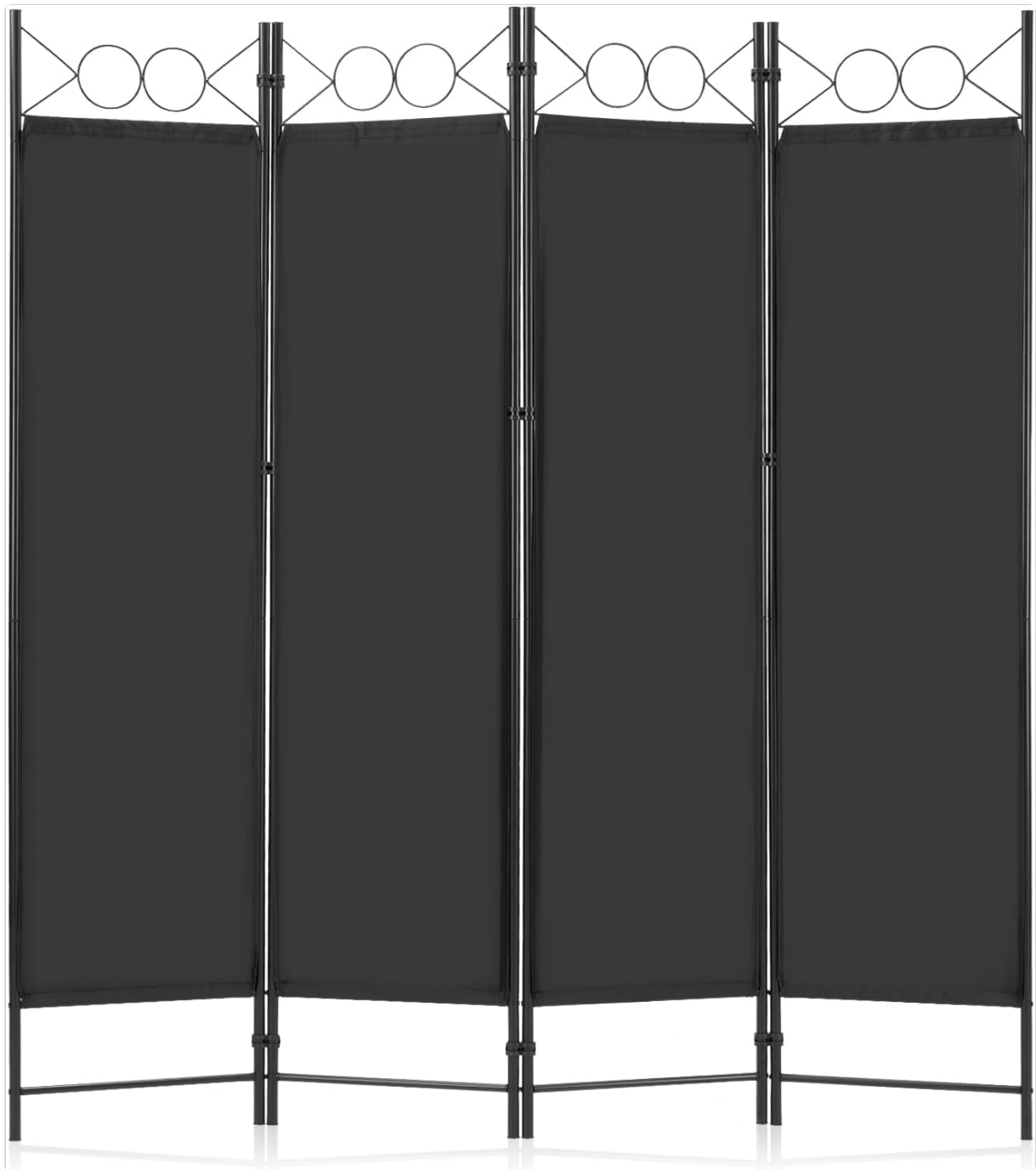
Image: The DUMOS 4 Panel Partition Room Divider shown fully extended, providing privacy.