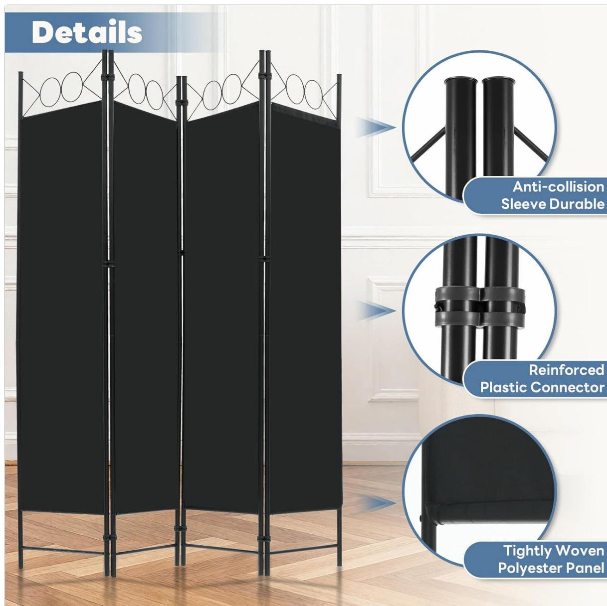
Image: Detailed view of the anti-collision sleeve, reinforced plastic connector, and tightly woven polyester panel.