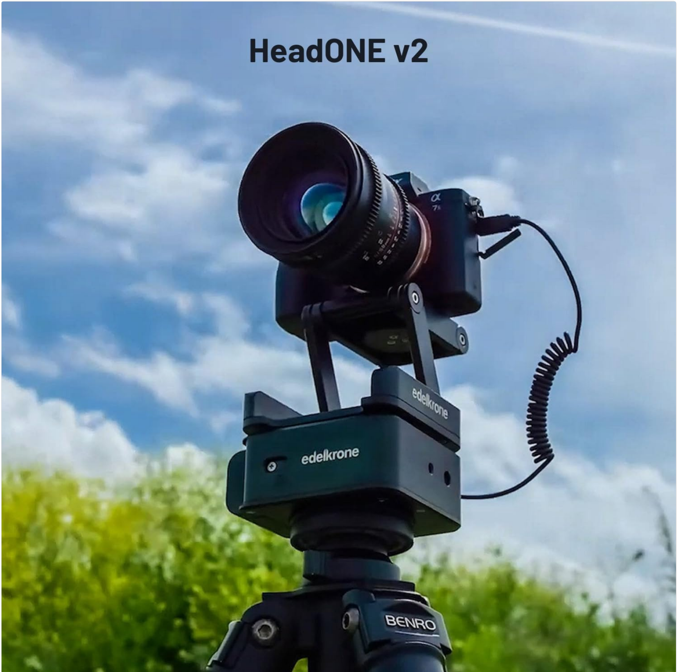
Image: HeadONE v2 with a camera mounted, ready for outdoor use.