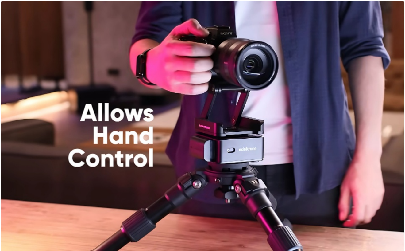
Image: The HeadONE v2 setup for motion control, compatible with both cameras and phones.