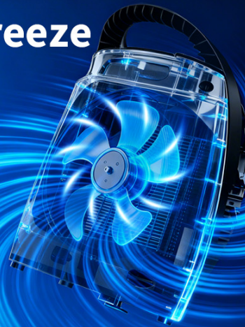
Image: Visual guide to achieving the ideal temperature with the heater's controls.