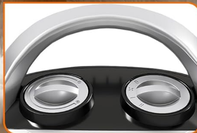
Image: The heater's control panel with two knobs for mode selection and temperature adjustment.

Set Your Desired Mode Fan only: Cool air Mode A: Warm 750W Mode B: Warmer 1500W