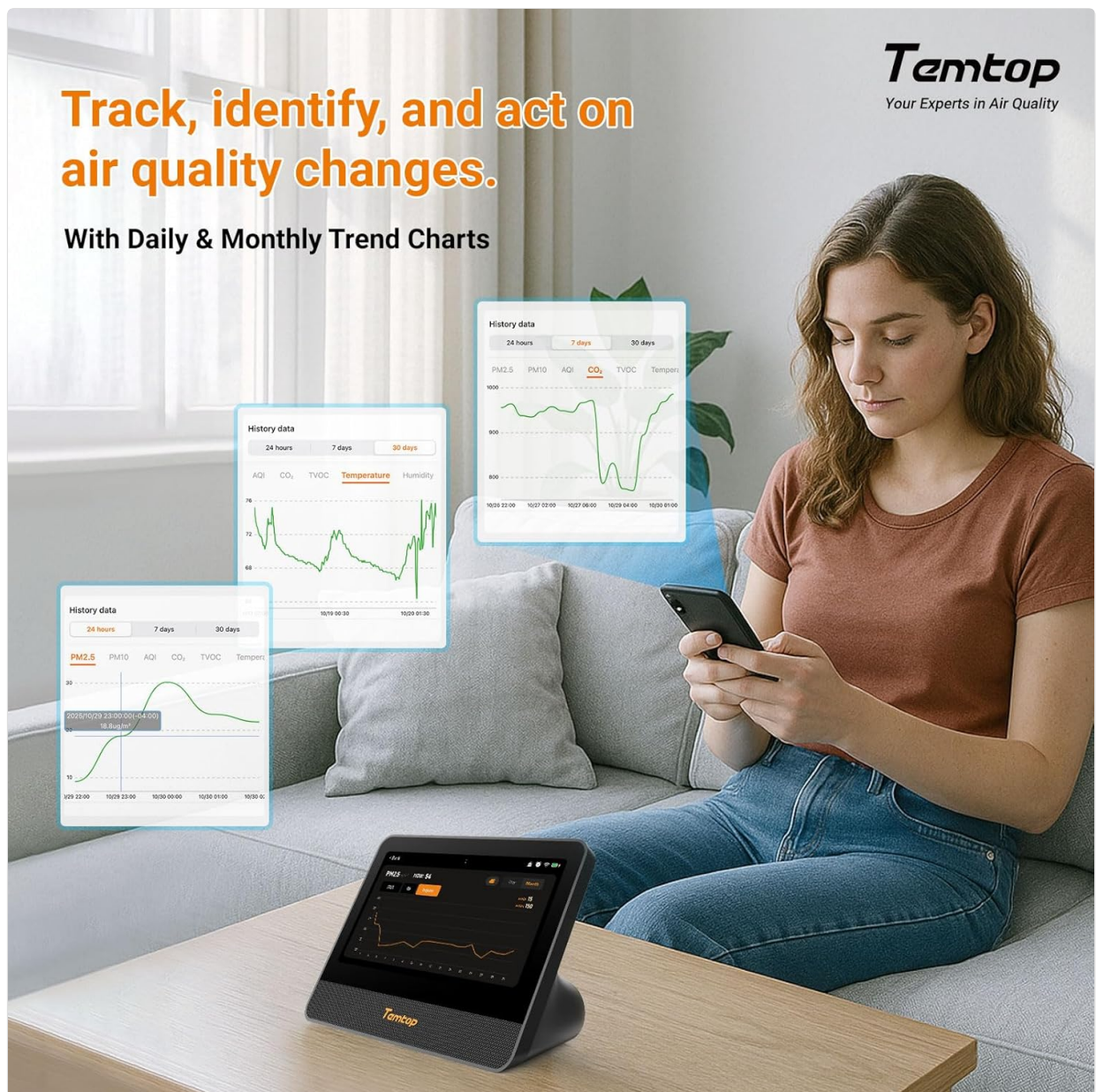
A user reviewing historical air quality data and trends on the Temtop mobile application.

Your browser does not support the video tag.