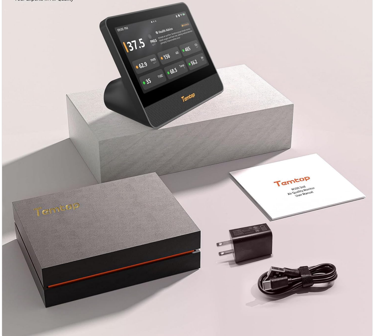
The Temtop M100 2nd Gen Air Quality Monitor, including the main unit, user manual, and charging accessories.