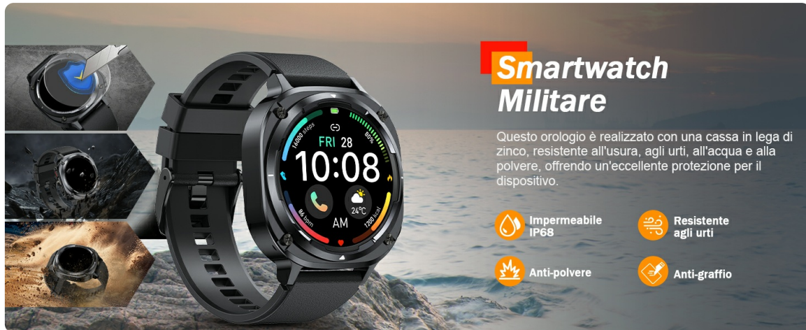
Figure 10: The smartwatch demonstrating its IP68 water resistance, suitable for various outdoor conditions.

The TIMU S90 Smartwatch is IP68 waterproof, meaning it is resistant to dust and can withstand immersion in water up to 1.5 meters for 30 minutes. It is suitable for daily use, including hand washing and light rain, but not recommended for hot showers, saunas, or diving.