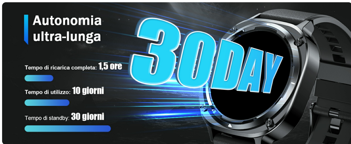
Figure 2: The smartwatch connected to its magnetic charging cable, illustrating the charging process and battery life.

Before first use, fully charge your smartwatch. Connect the magnetic charging cable to the charging points on the back of the watch and plug the USB end into a power adapter (not included) or a computer's USB port.