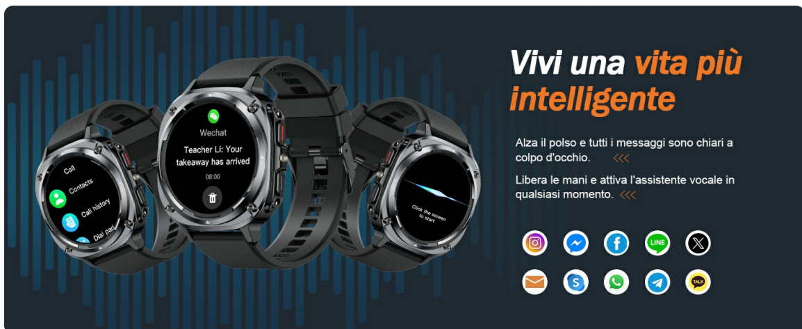
Figure 4: The smartwatch showing message notifications and the voice assistant feature for convenient interaction.

Receive real-time message notifications from various social media applications directly on your smartwatch. Configure which app notifications you wish to receive through the companion app settings.