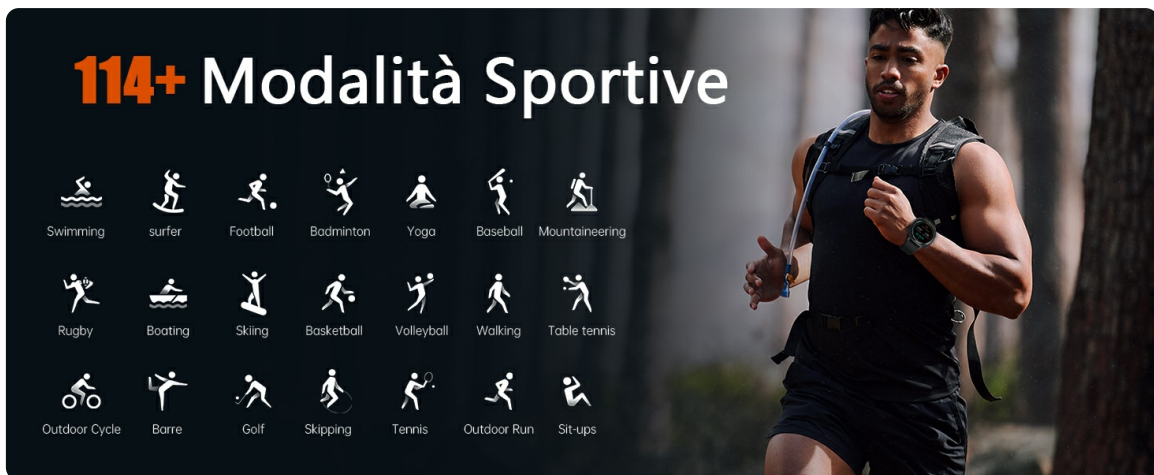
Figure 7: Overview of the 114+ sports modes available on the smartwatch, with icons representing different activities.

The smartwatch supports over 115 sports modes, allowing you to track various activities and monitor your performance in real-time. Data such as calories burned, distance, and steps are recorded and can be viewed in the app.