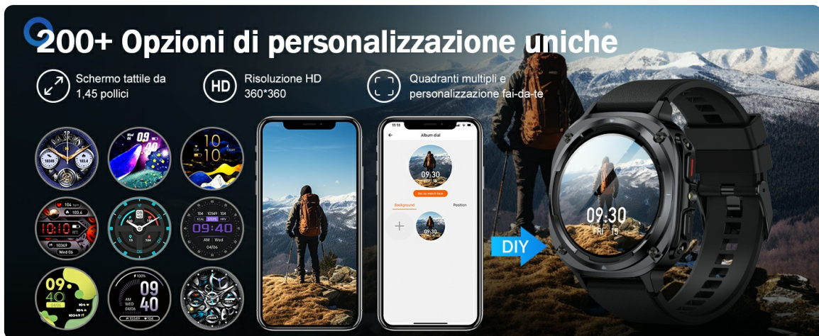
Figure 9: Watch face customization options, including pre-set designs and the ability to create custom watch faces using personal images.

Personalize your smartwatch experience with over 200 unique customization options, including multiple watch faces and DIY customization features through the app.