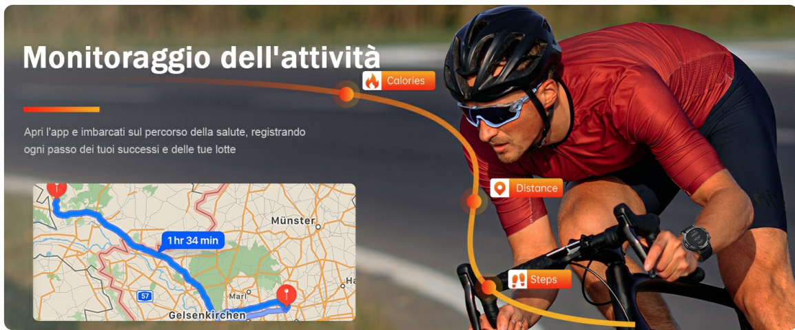
Figure 8: Activity monitoring interface, showing cycling data including calories, distance, and steps, along with a route map.