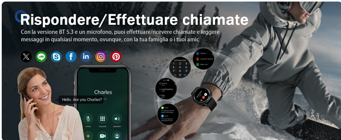
Figure 3: The smartwatch's interface for making and answering calls, showing integration with a smartphone.