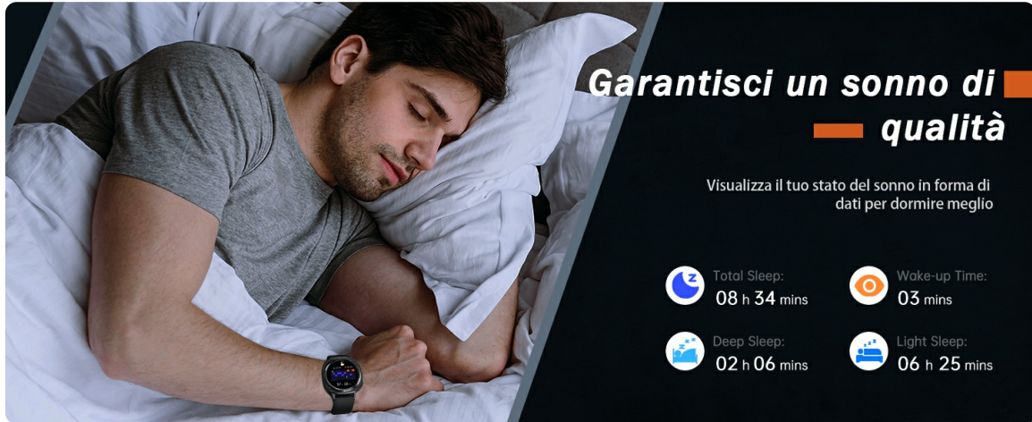
Figure 6: Sleep monitoring interface on the smartwatch, showing total sleep, deep sleep, and light sleep duration.