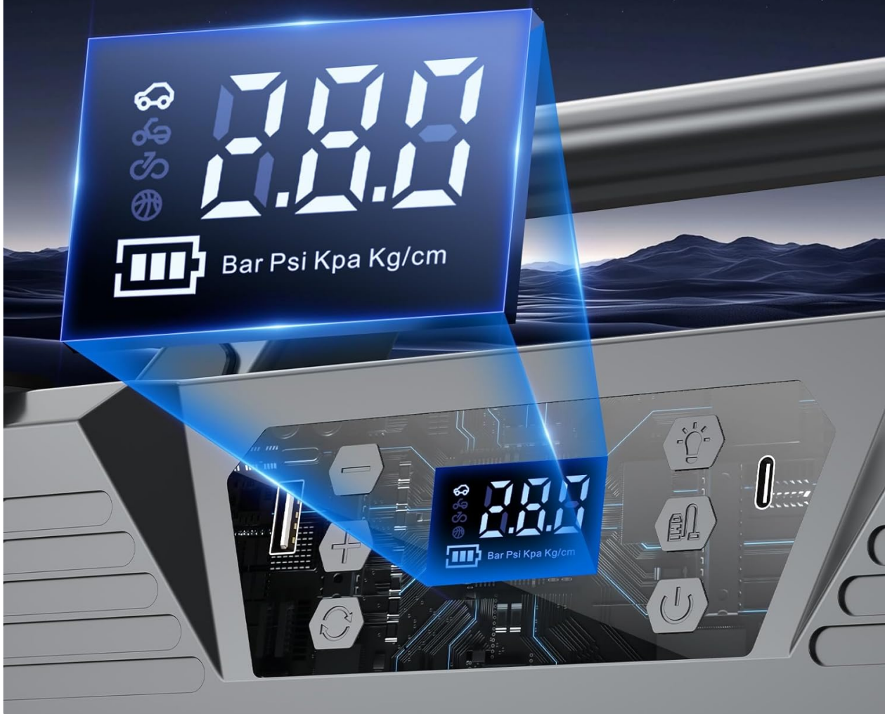
Image: A close-up view of the Sharmeal GL995's smart digital pump display, showing pressure units (Bar, Psi, Kpa, Kg/cm) and control buttons for easy inflation.