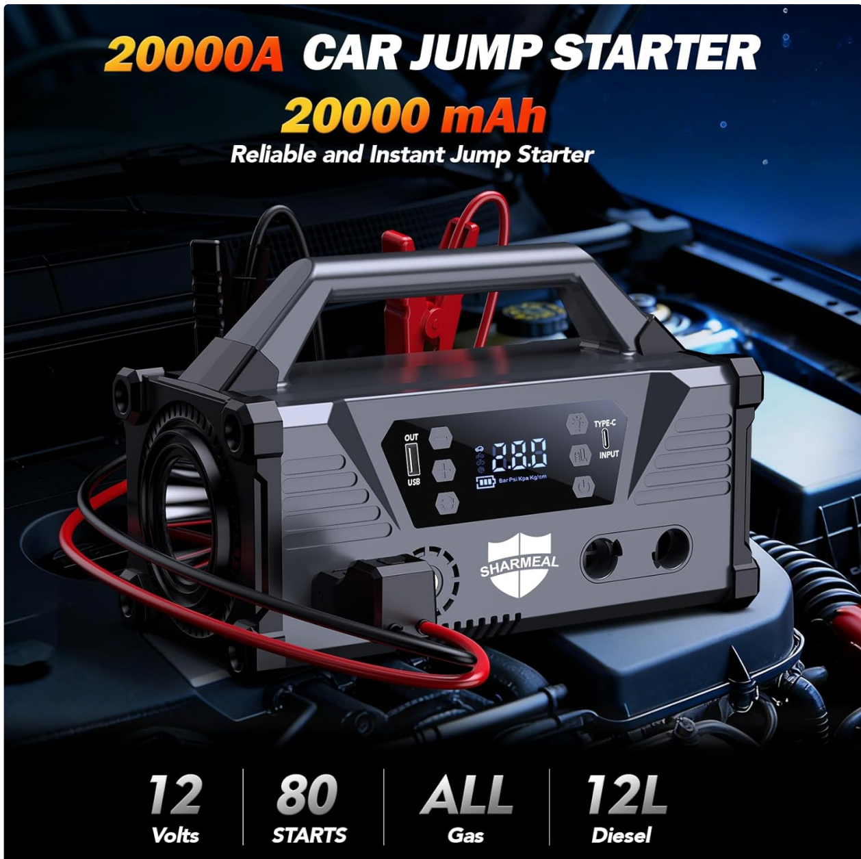
Image: The Sharmeal GL995 jump starter unit with its smart jumper cables connected to a vehicle battery, ready for operation. The unit's digital display is visible.