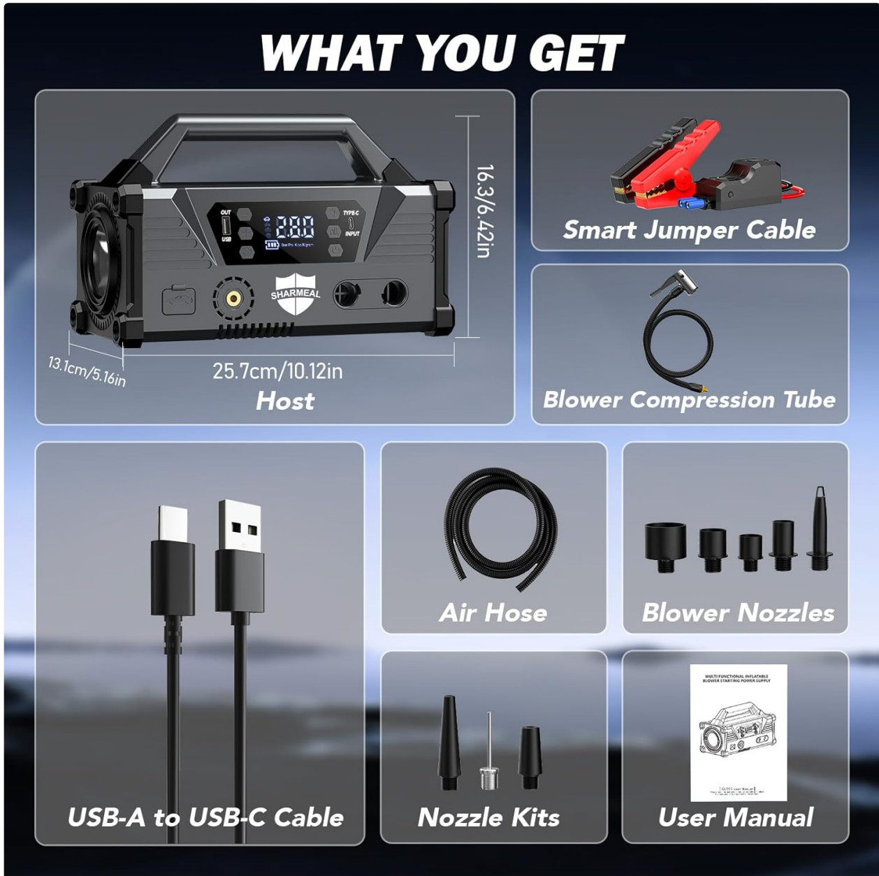
Image: Sharmeal GL995 unit with all included accessories: smart jumper cable, blower compression tube, air hose, blower nozzles, USB-A to USB-C cable, nozzle kits, and user manual.