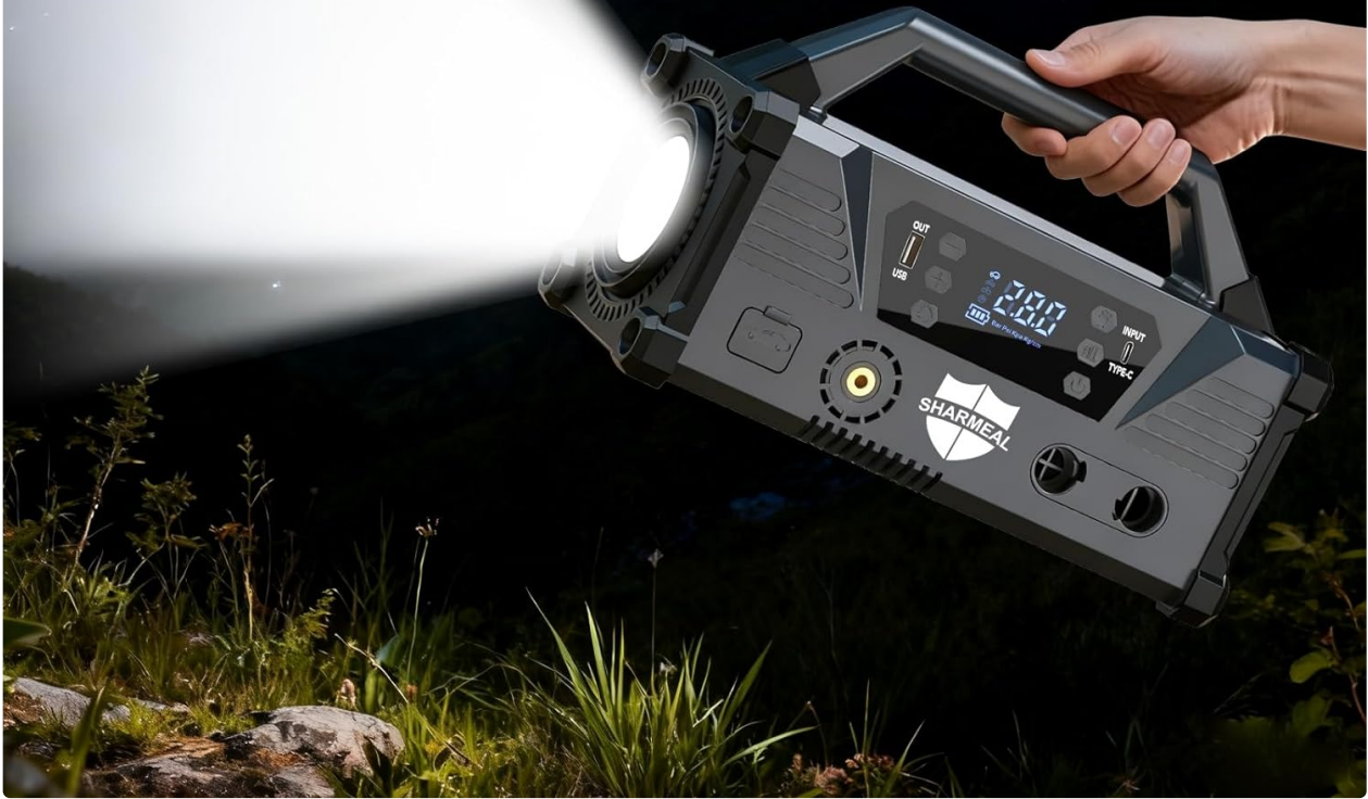
Image: The Sharmeal GL995 unit's powerful 8W, 1200 lumen flashlight illuminating a dark outdoor environment, demonstrating its strong light output.