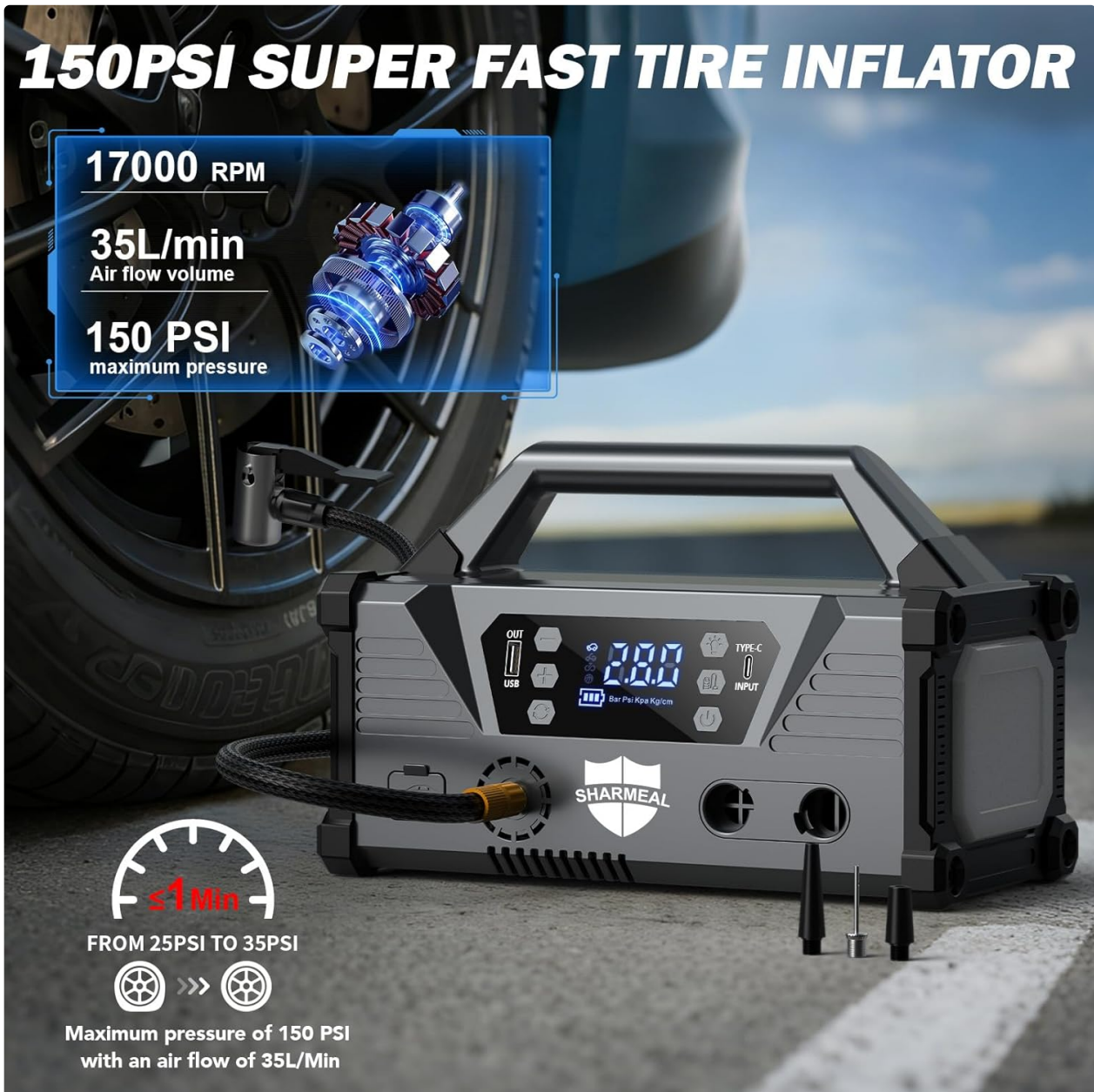
Image: The Sharmeal GL995 unit actively inflating a car tire, showcasing its 150 PSI super fast tire inflator feature with a digital display showing pressure readings.