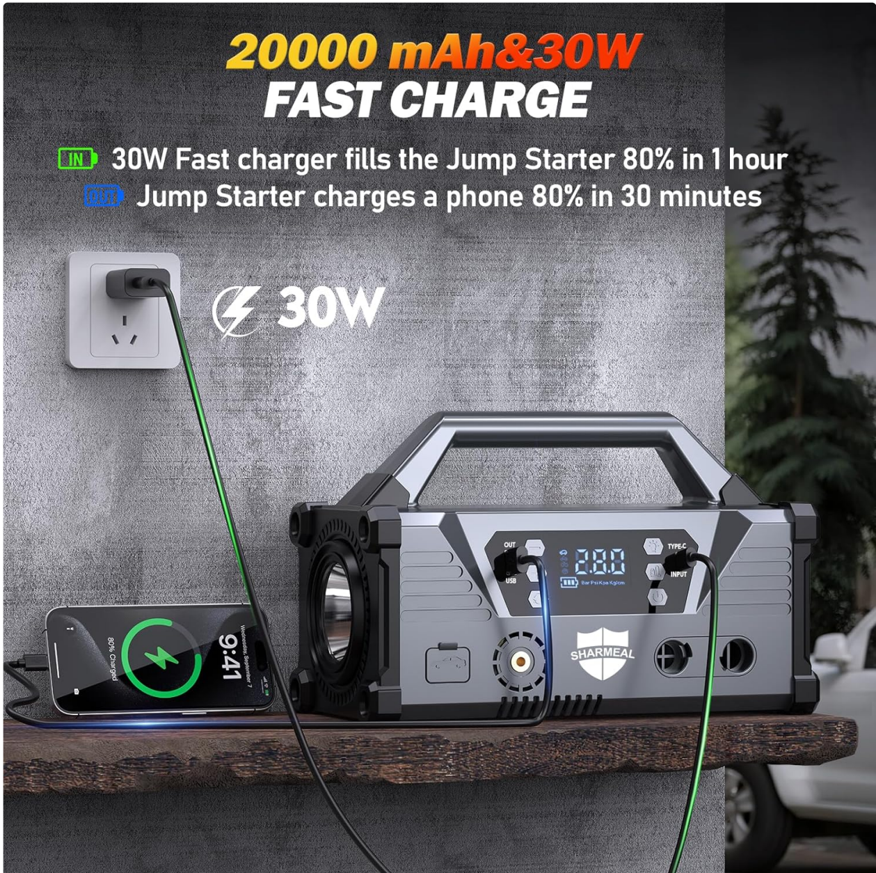
Image: The Sharmeal GL995 unit connected to a wall charger via its Type-C input, demonstrating its fast charging capability. A smartphone is also shown being charged by the unit's USB output.