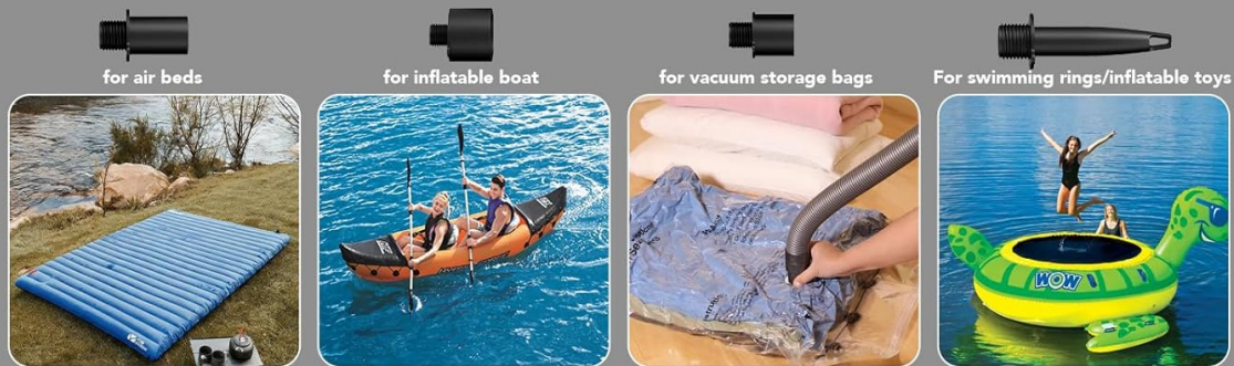
Image: The Sharmeal GL995 unit demonstrating its additional double air port with various nozzles for different applications such as air beds, inflatable boats, vacuum storage bags, and inflatable toys.