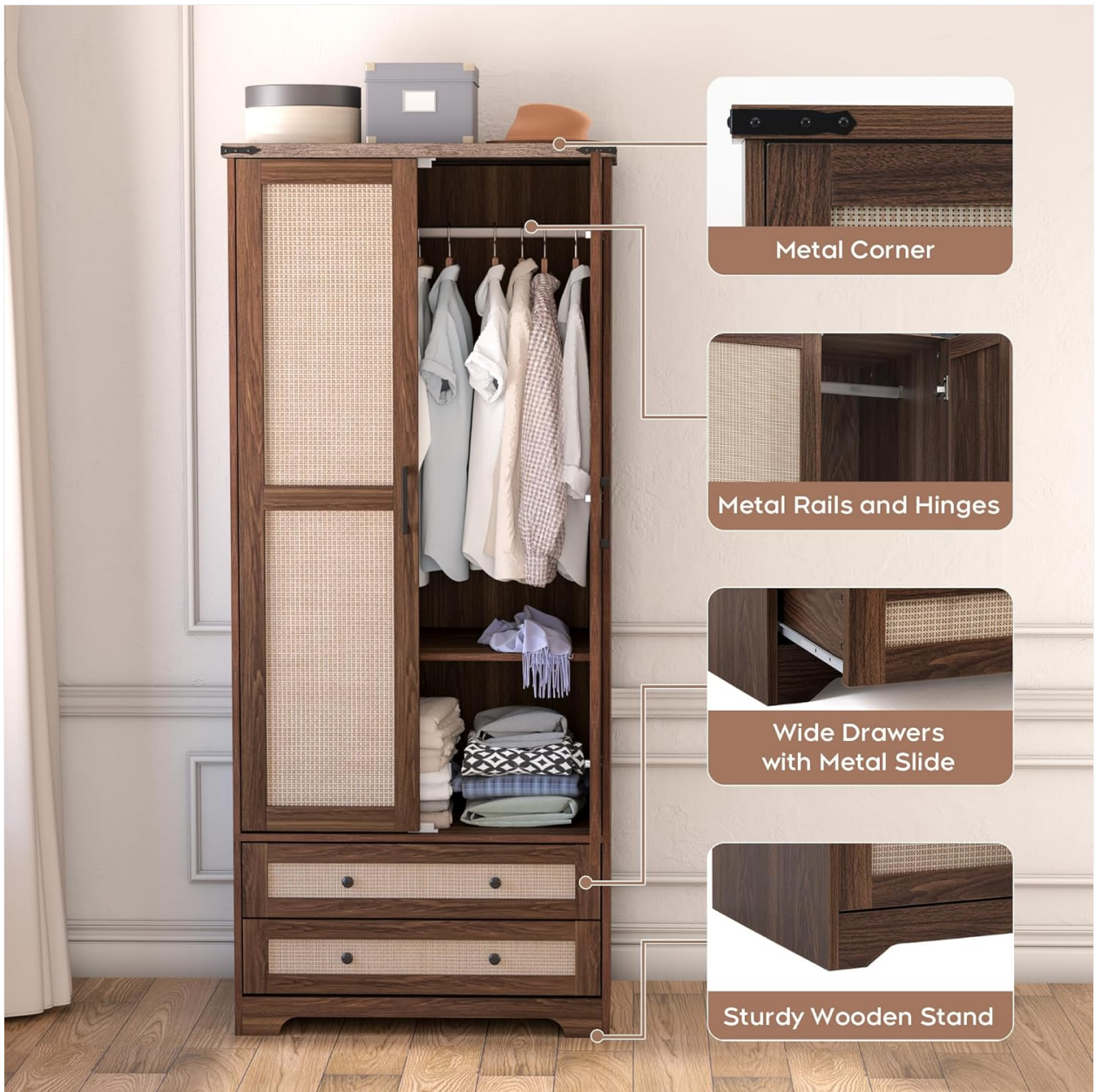
Figure 4: Quality construction details, including metal corners and drawer slides.