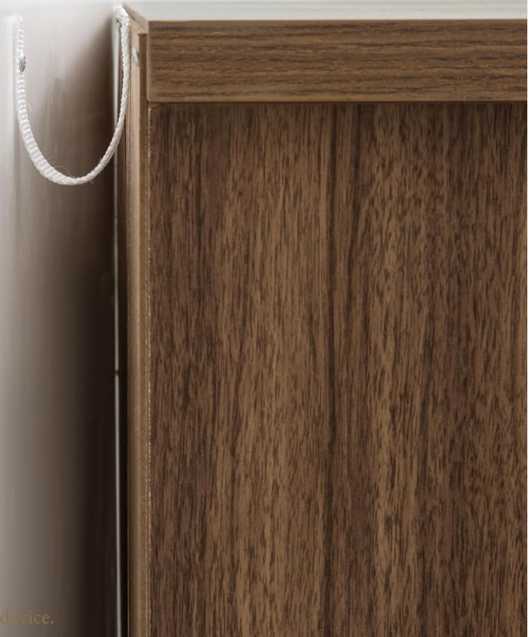
Figure 1: Anti-falling device installation. Secure the armoire to the wall to prevent accidental tipping.