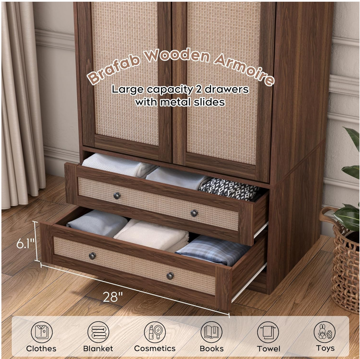
Figure 3: Large capacity drawers. Ideal for folded items and accessories.