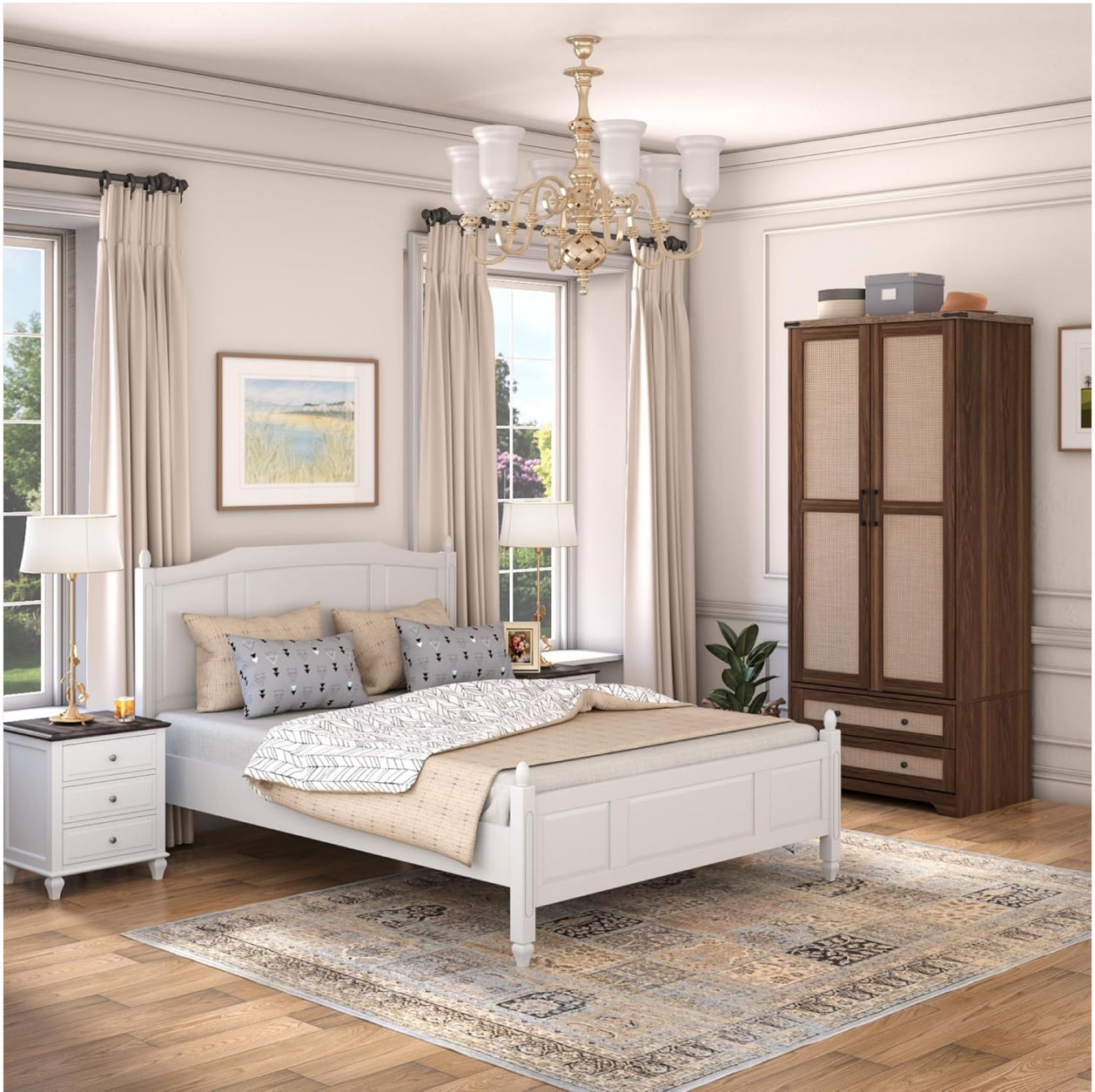
Figure 5: Armoire in a bedroom setting, showcasing its versatile design.