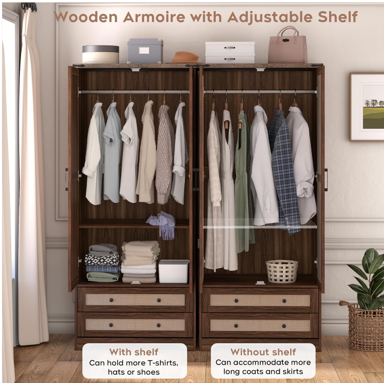
Figure 2: Adjustable shelf configuration. The shelf can be moved to accommodate various clothing items.