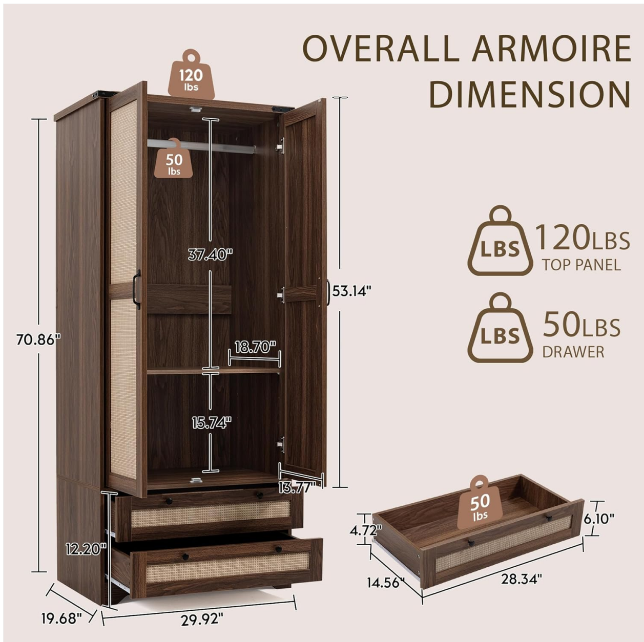
Figure 6: Overall armoire dimensions and weight capacities.