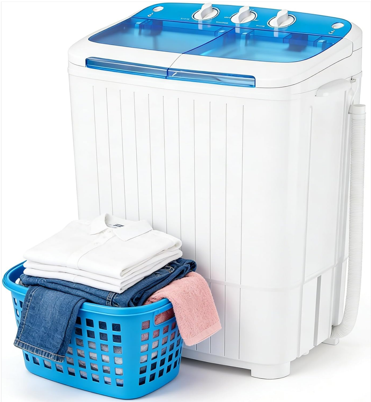
Figure 1: SUNCROWN Portable Twin Tub Washing Machine