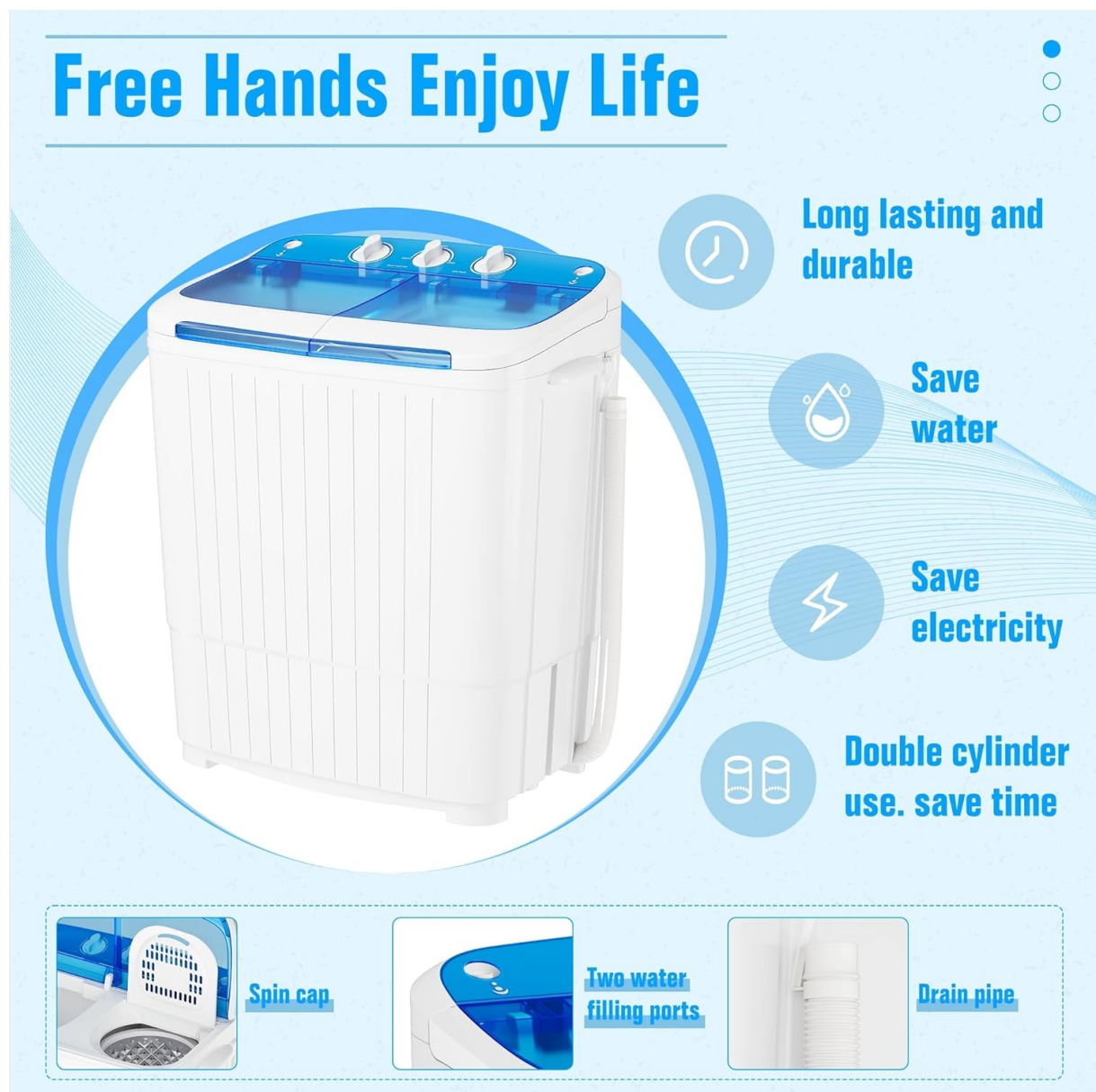
Figure 2: Control Panel and Tubs