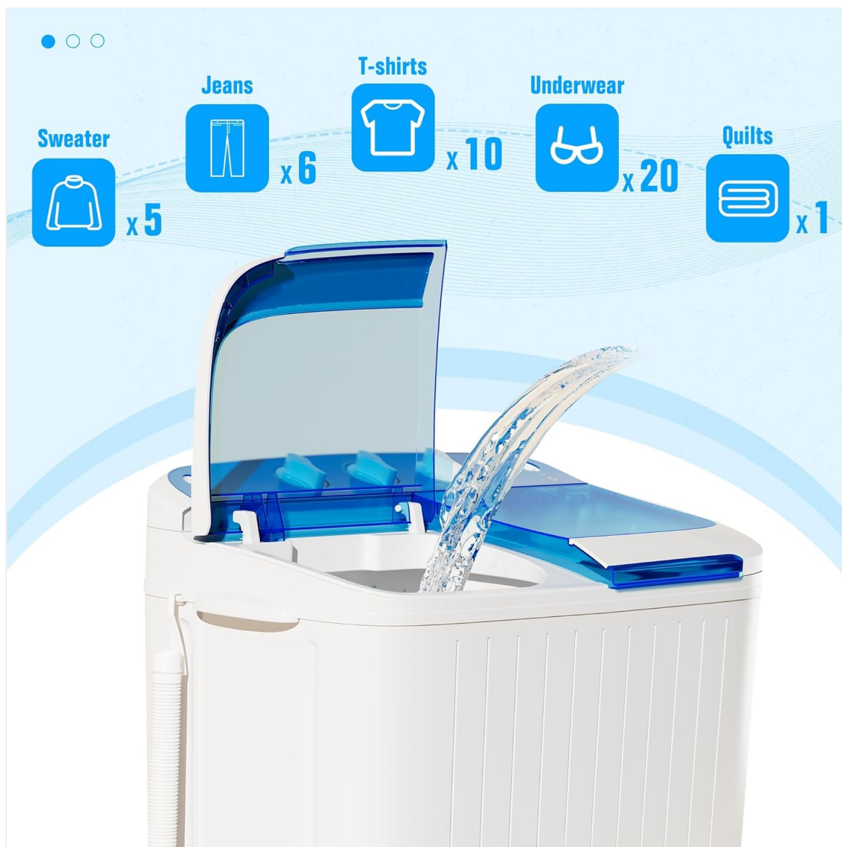
Figure 6: Loading Clothes into the Washing Tub