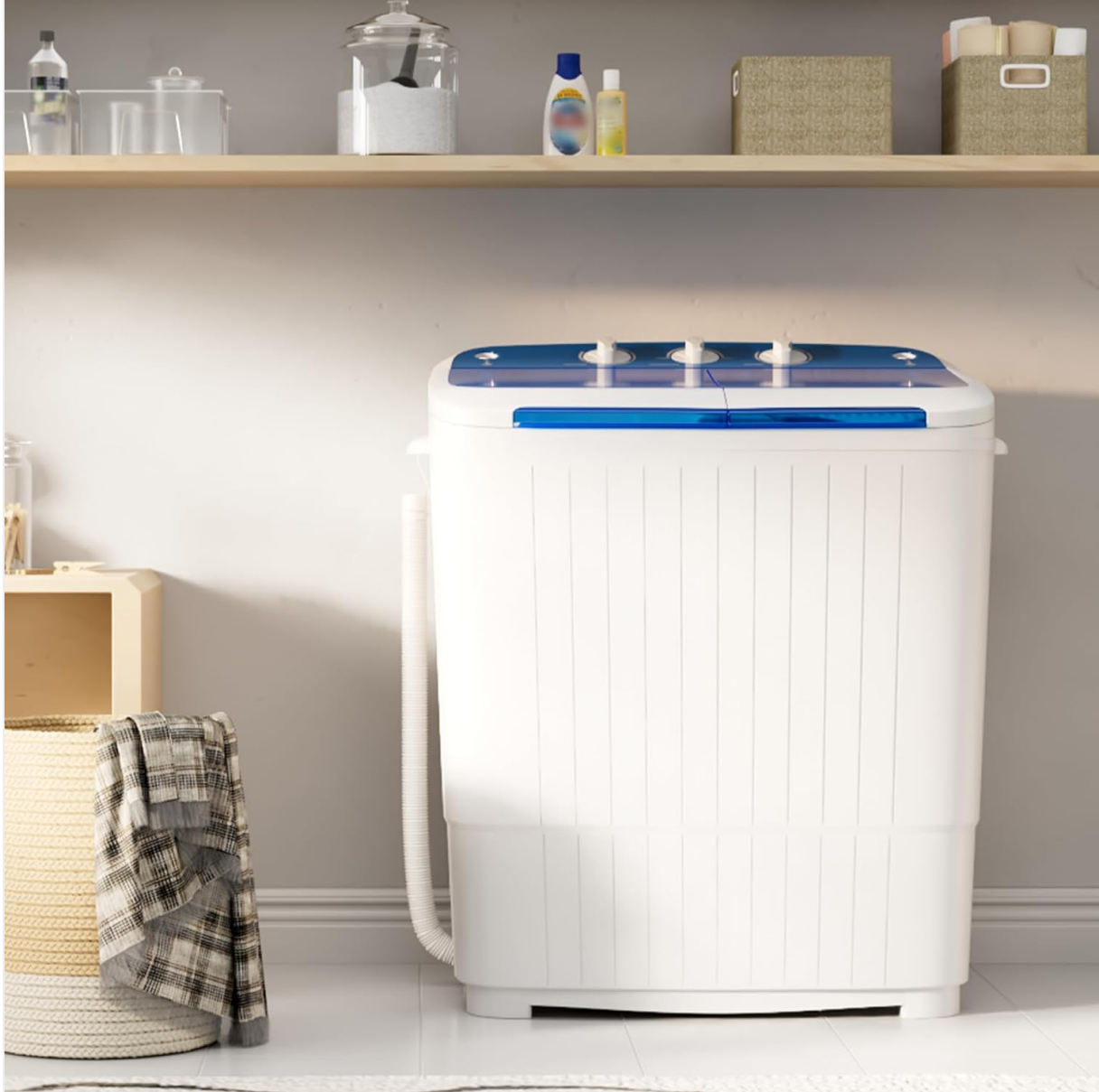
Figure 4: Optimal Placement in a Bathroom