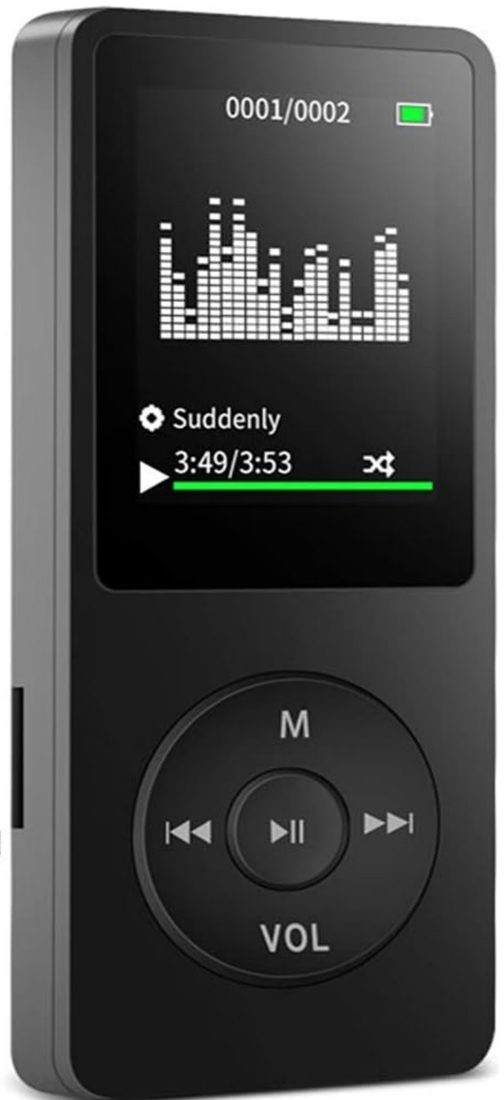
Figure 3: Micro SD card capacity and expansion.