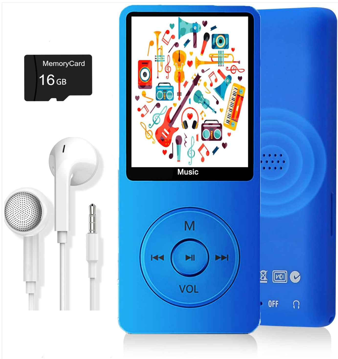
Figure 1: Dyzeryk MP3 Player (Model JS-01) with accessories.