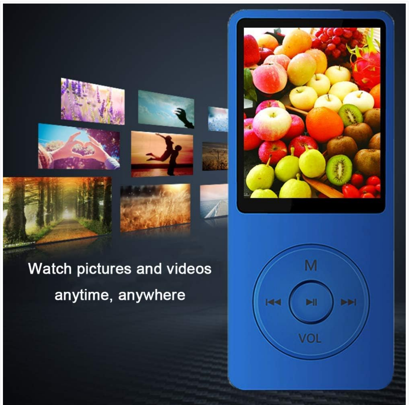
Figure 4: Watching pictures and videos on the device.