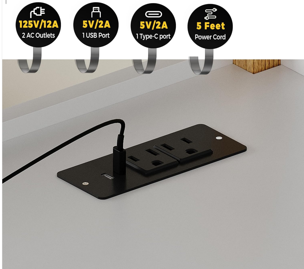
Image 5.2: The integrated power strip on the desk provides convenient access to AC, USB, and Type-C charging ports.