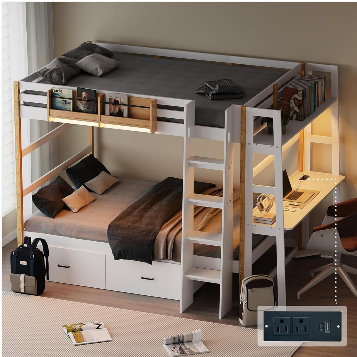
Image 1.1: The Kikihouse Full Over Full Bunk Bed, showcasing its integrated desk, LED lighting, and under-bed storage drawers.