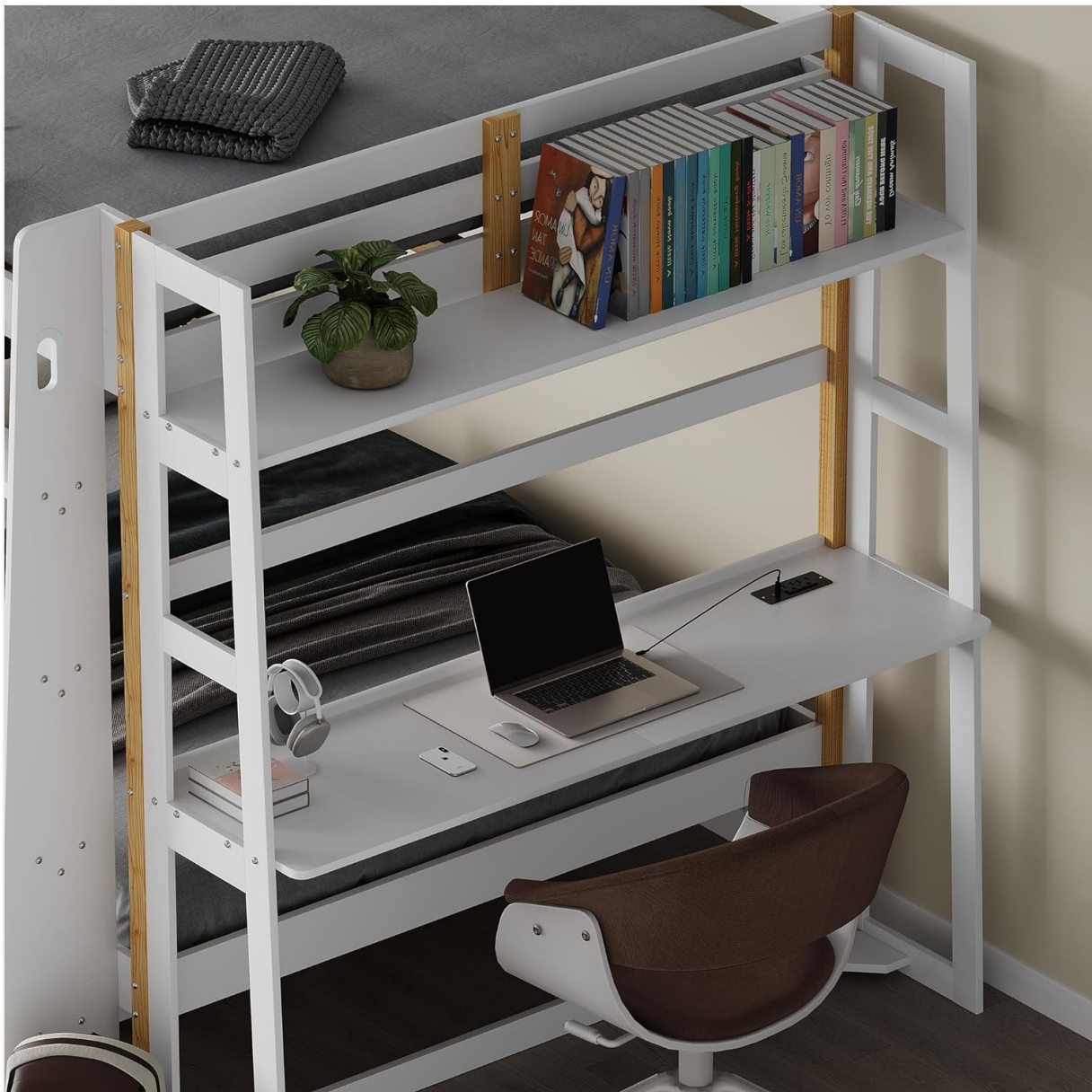
Image 5.4: The side desk provides a functional workspace, complemented by an upper bookshelf for storage.