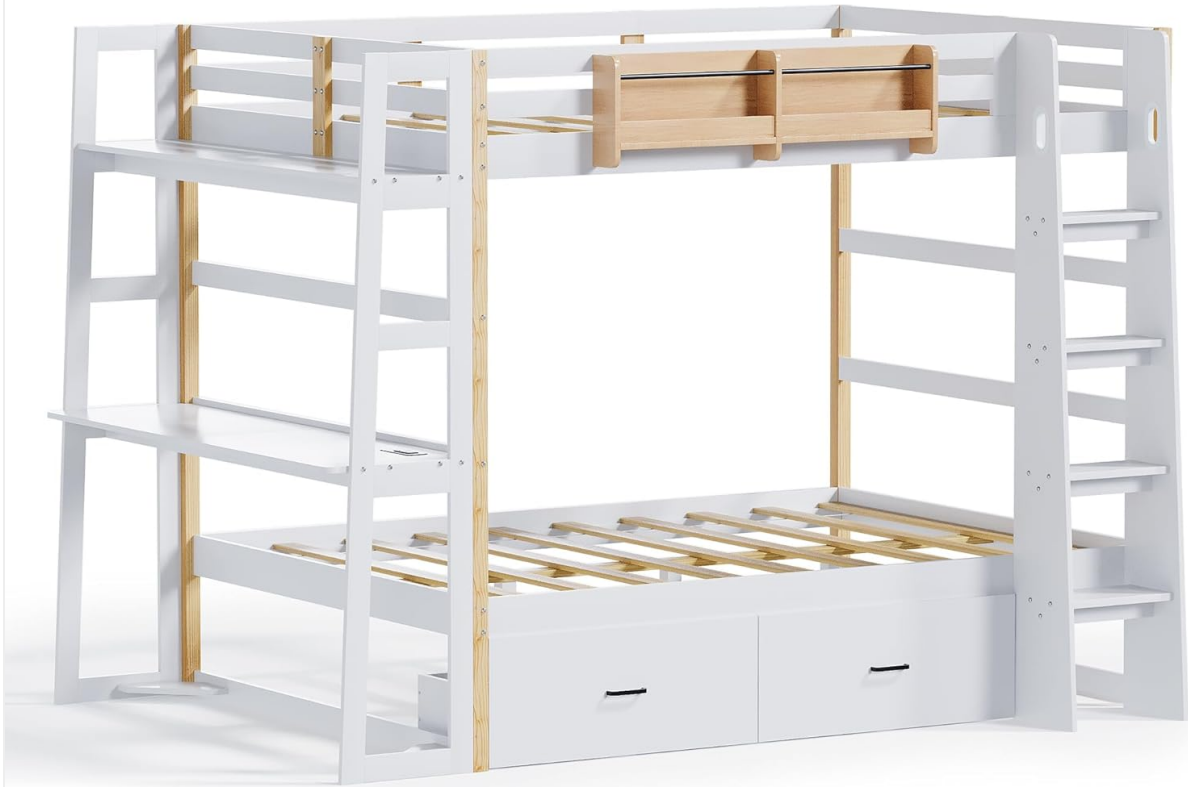
Image 8.2: Detail of the solid wood frame construction, highlighting durability.