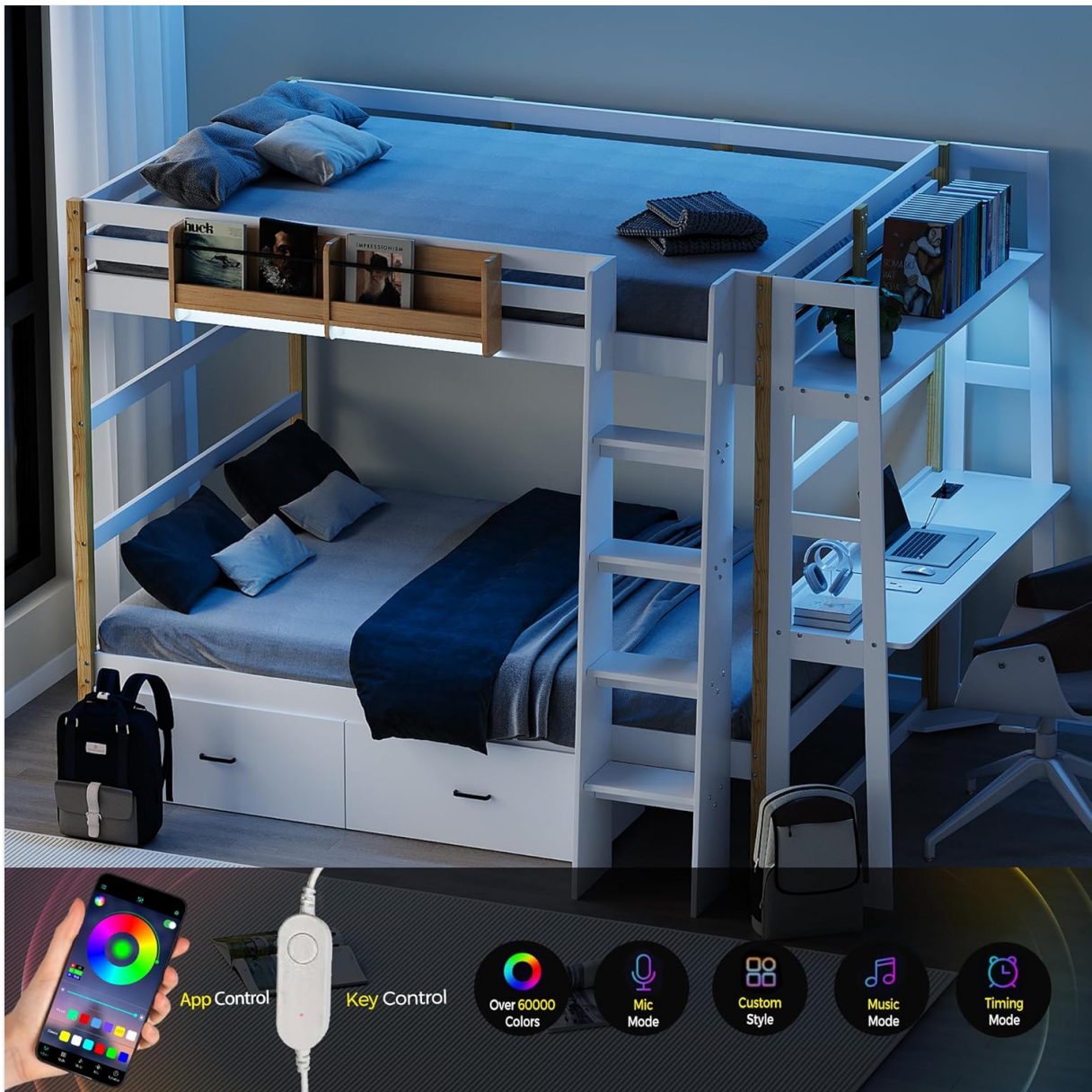
Image 5.1: The LED lighting system can be controlled via a mobile application or a physical button, offering various color and mode options.