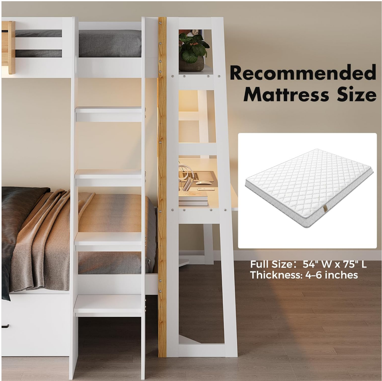
Image 8.1: Recommended mattress dimensions for the Full over Full bunk bed.