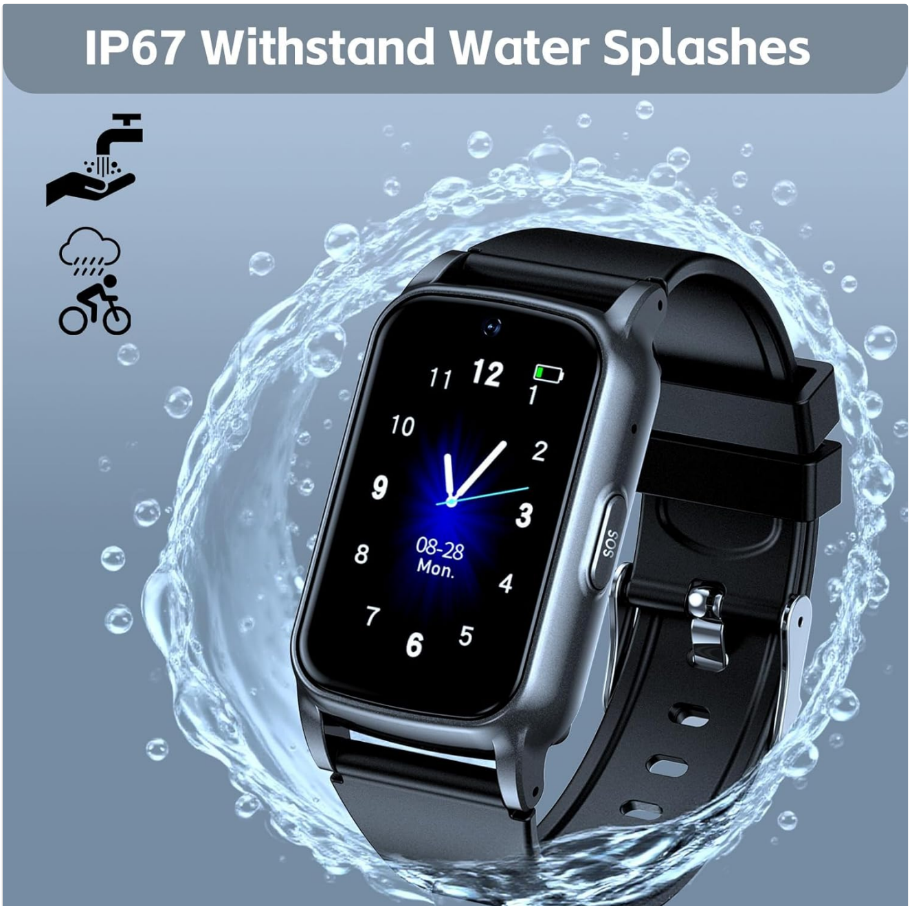
Image: The watch is designed to withstand water splashes and brief immersion, making it suitable for everyday use.