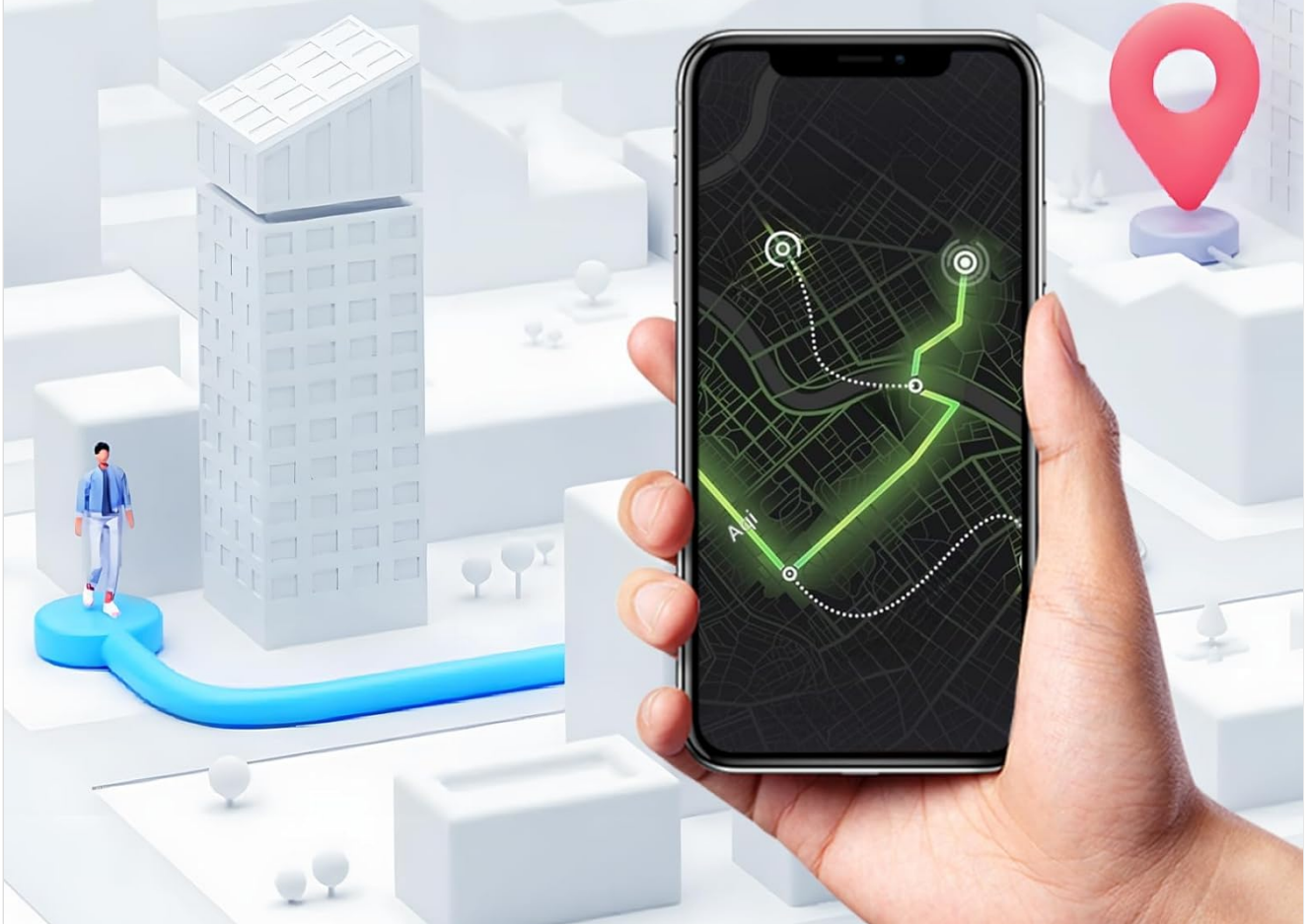
Image: The watch utilizes multiple positioning modes for accurate location tracking, displayed on a smartphone map interface.

adopt GPS+Beidou+LBS+WIF +TDOA+Inertial gyroscope multi-mode