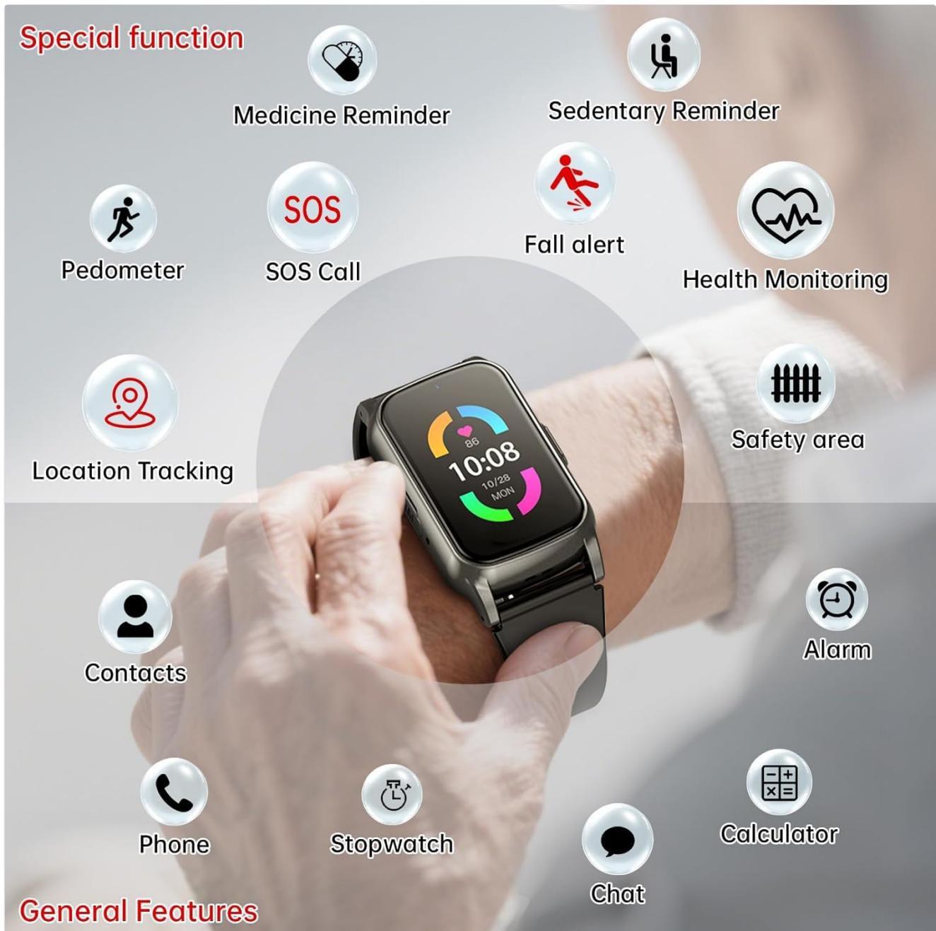
Image: An overview of the watch's diverse functions, including health monitoring, safety features, and daily utilities.