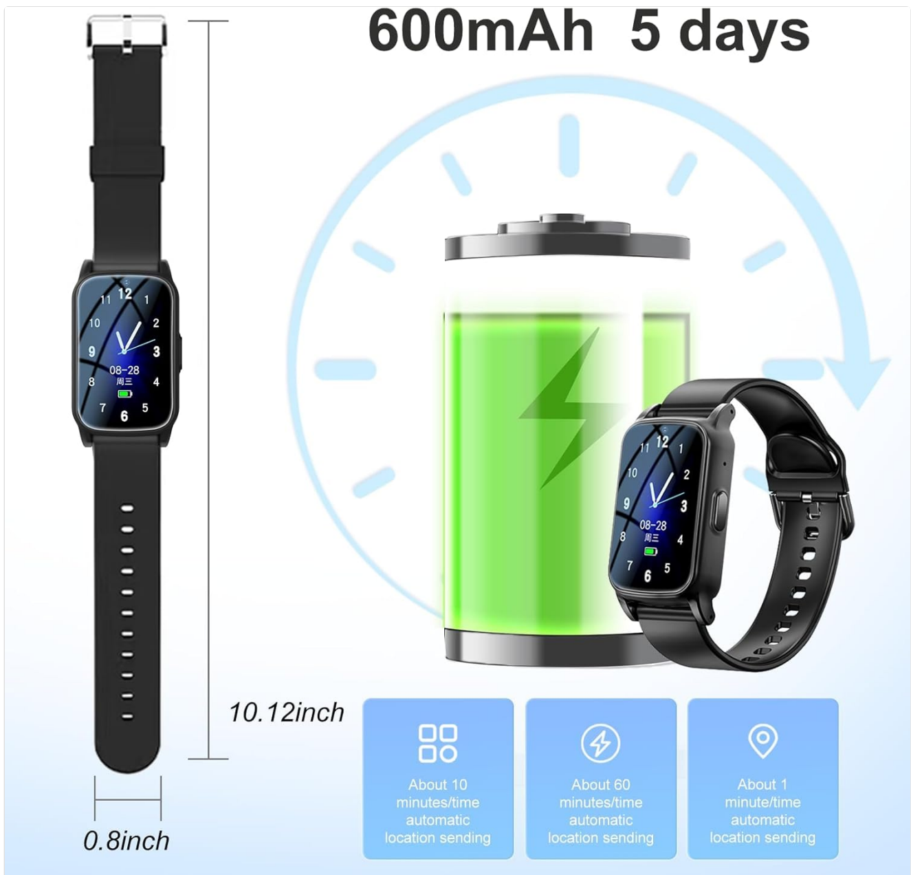
Image: The watch features a 600mAh battery, offering approximately 5 days of usage on a single charge.