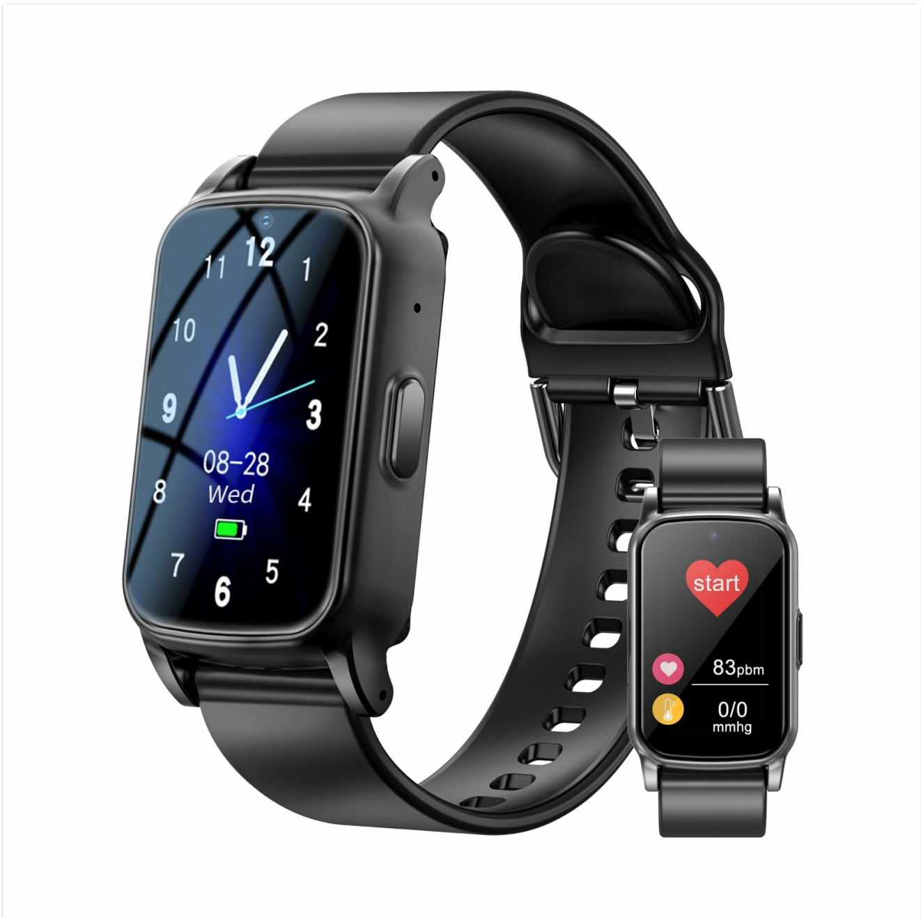
Image: The watch's fall detection feature automatically alerts caregivers when a fall is detected.