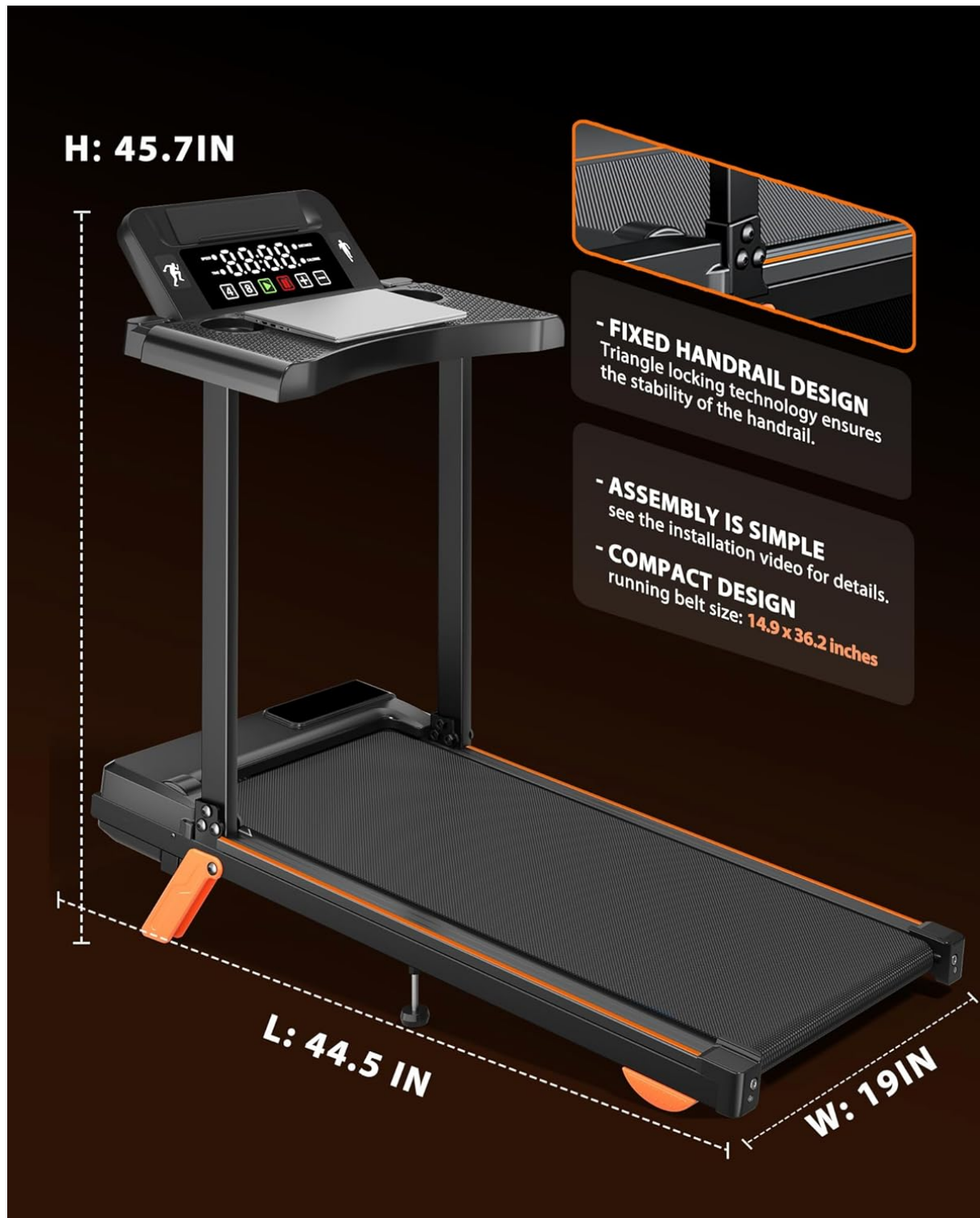
Image: The EVKRUN EUX1 Treadmill highlighting its fixed handrail design and compact dimensions (L: 44.5 IN, W: 19 IN, H: 45.7 IN).

Video: Detailed installation guide for the EVKRUN EUX1 Walking Pad Treadmill.