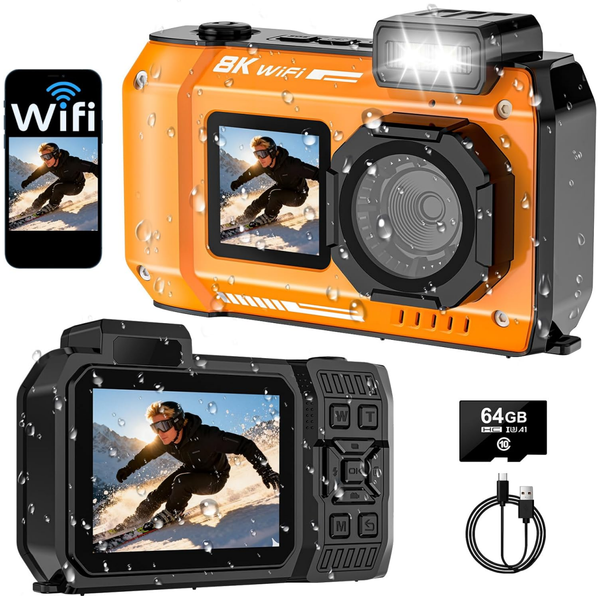
Image: The SPUNALP UHD 8K Underwater Camera in orange, shown with a 64GB SD card, USB cable, and wrist lanyard.