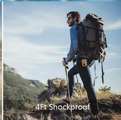
Image: The SPUNALP UHD 8K Underwater Camera highlighting its rugged design, showcasing its waterproof, dustproof, and shockproof capabilities.

Your browser does not support the video tag.