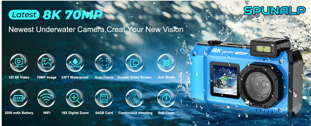
Image: The camera being used underwater, highlighting its 33-foot waterproof rating.