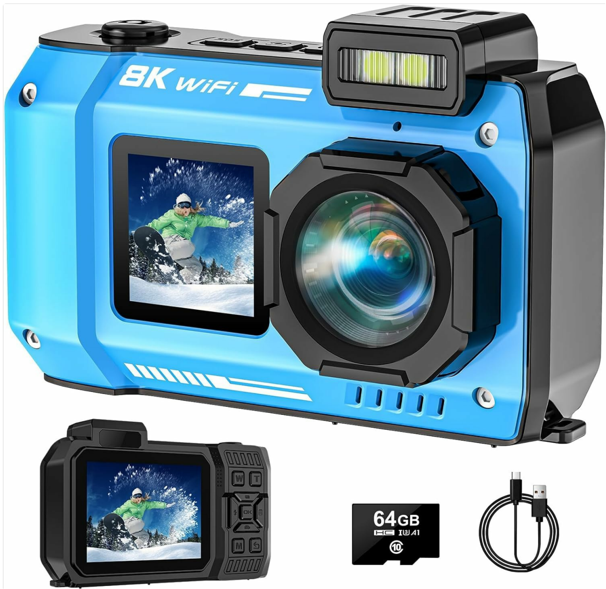
Image: Rear view of the camera, showing the main display and control buttons.