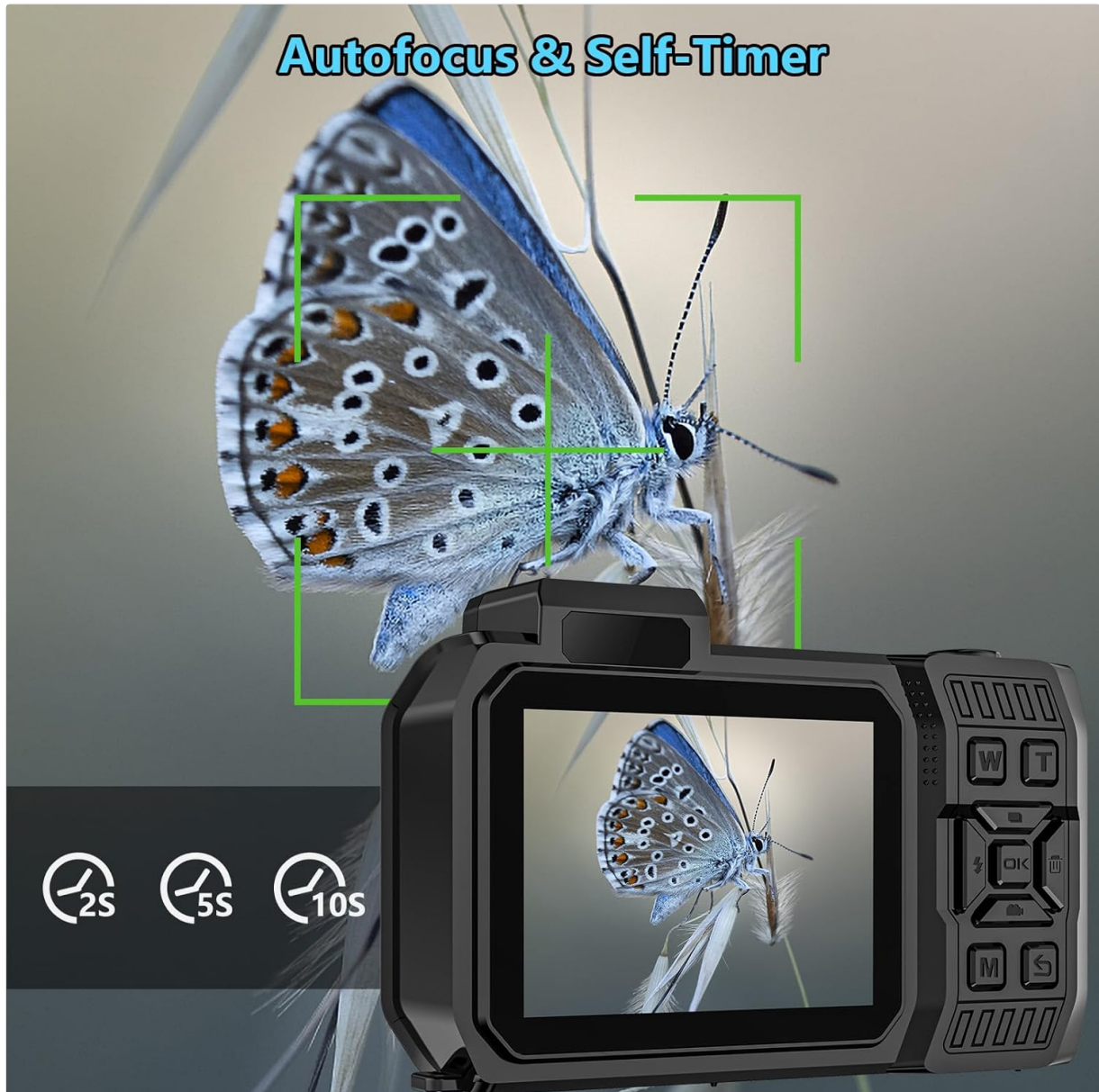
Image: The camera demonstrating its autofocus capability and self-timer settings.