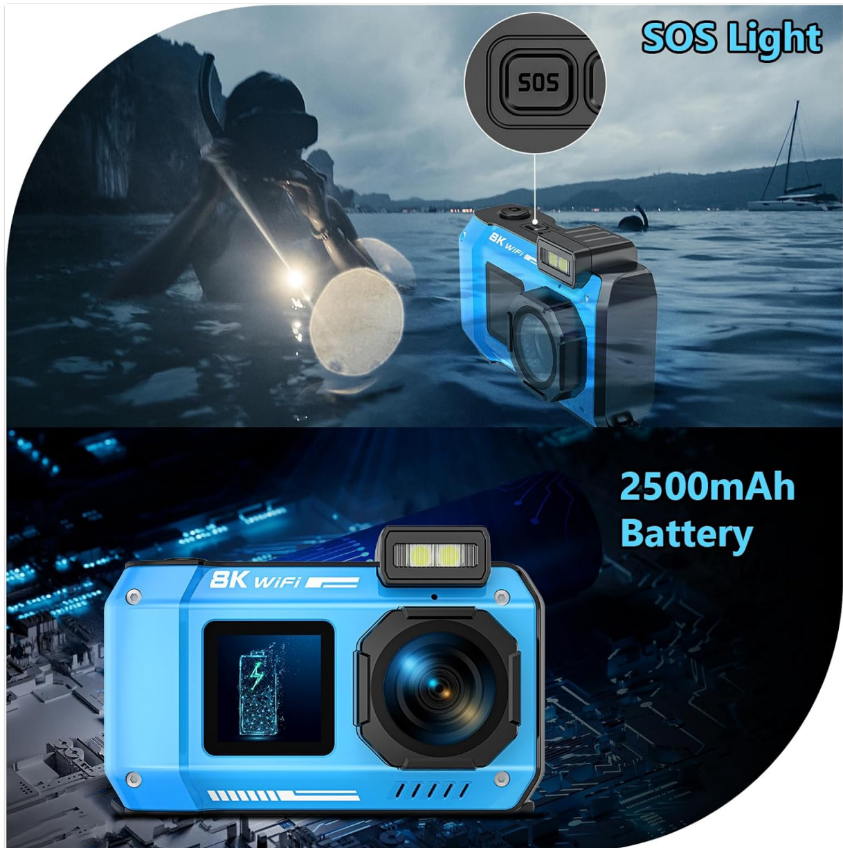
Image: The camera highlighting its 2500mAh battery capacity and SOS light function.