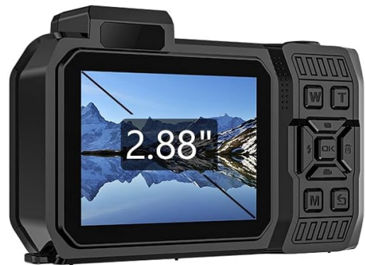
Image: The SPUNALP CM026 camera and its included accessories.