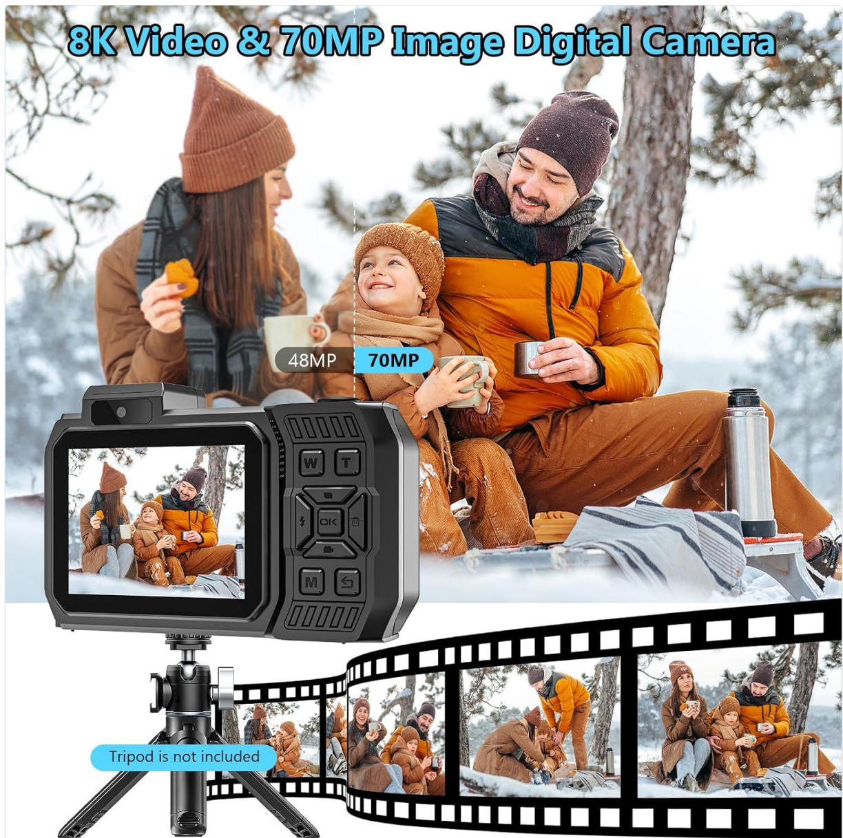
Image: The SPUNALP CM026 camera, showcasing its ability to capture high-resolution images and videos in diverse settings.