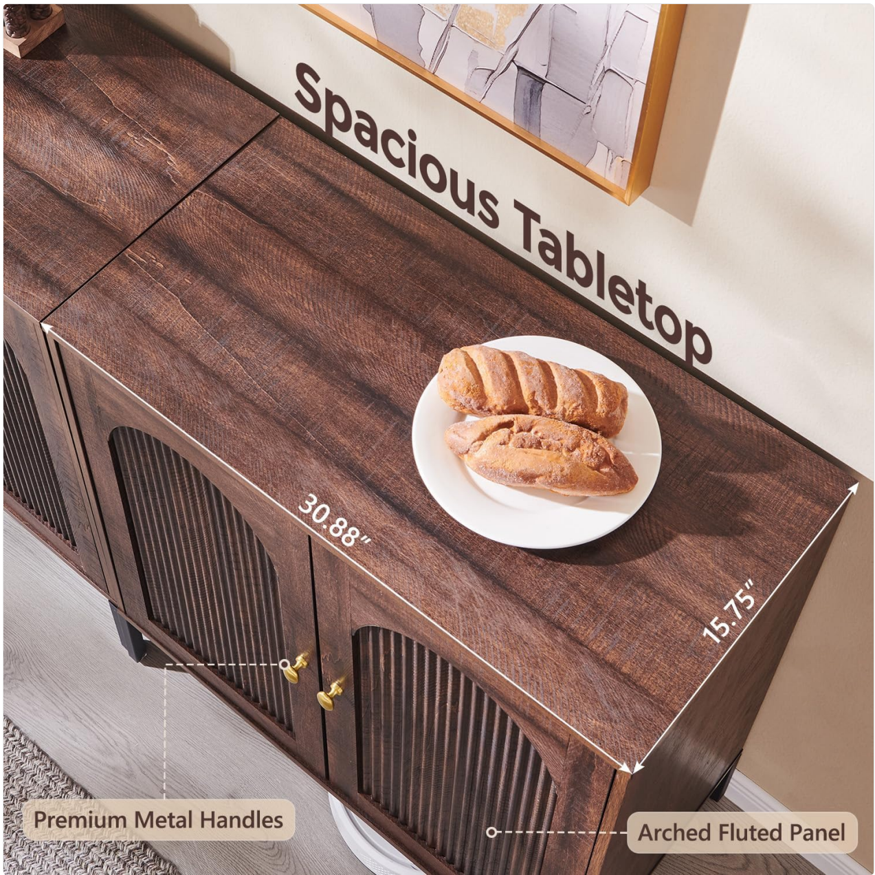
Image: The generous tabletop surface, ideal for everyday essentials and decor.