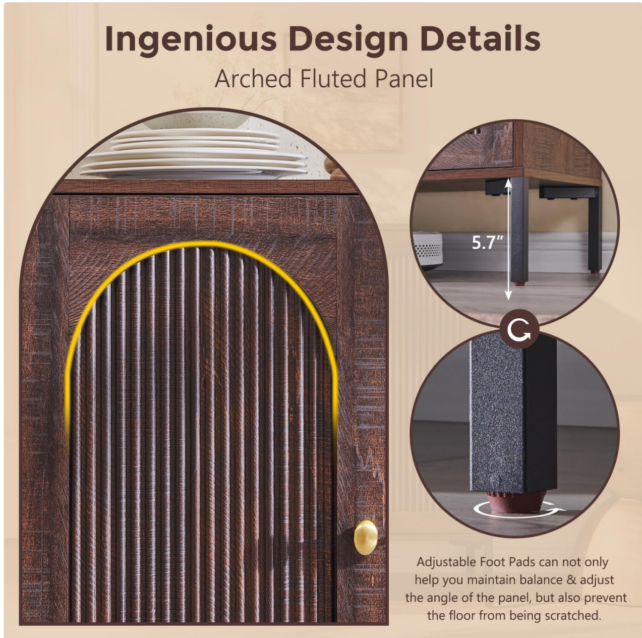
Image: Detailed view of the cabinet's design elements, including the arched fluted panel and adjustable foot pads.