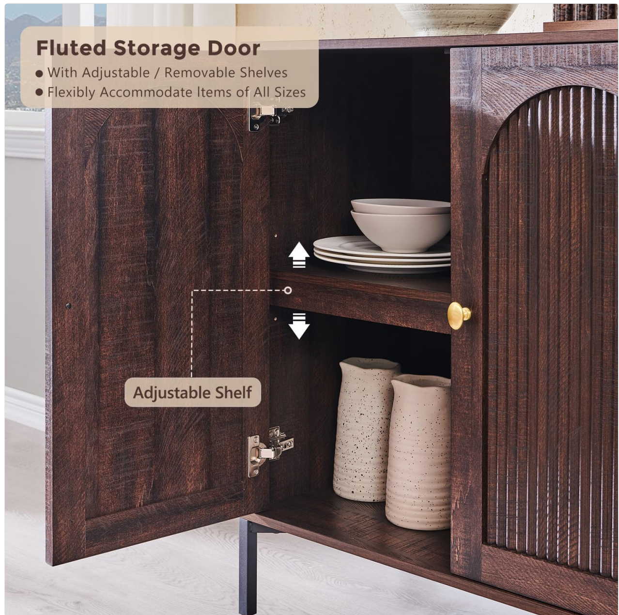
Image: Detail of the adjustable shelf within the cabinet, demonstrating its flexibility.

The cabinet features one adjustable wooden shelf that can be positioned at three different heights. To adjust the shelf, carefully remove it from its current position, reposition the shelf pins to the desired height, and then place the shelf back onto the pins. This flexibility allows you to customize the storage space for various items, from books and dinnerware to small appliances.