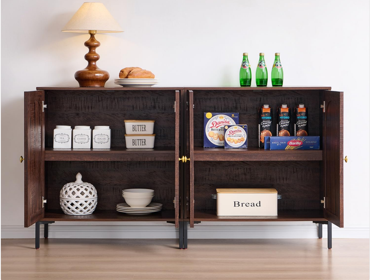
Image: Interior view of the cabinet, demonstrating spacious and organized storage capabilities.