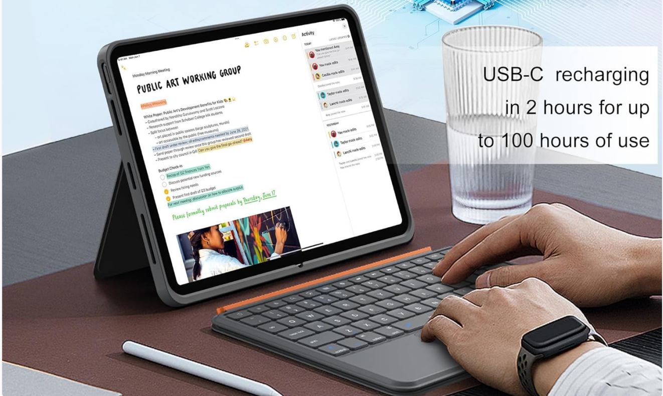
Figure 6: The adjustable stand supports multiple viewing angles.

USB-C recharging in 2 hours for up to 100 hours of use