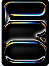
iPad Pro 11" (M5) 2025 iPad Pro 11" (M4) 2024