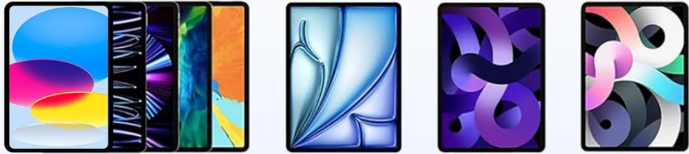
Not compatible with iPad Air 11" 2024(M2) Air 10.9" (5ev/4th Gen)\ Pro 11" (4th/3rd/2nd/1st Gen)