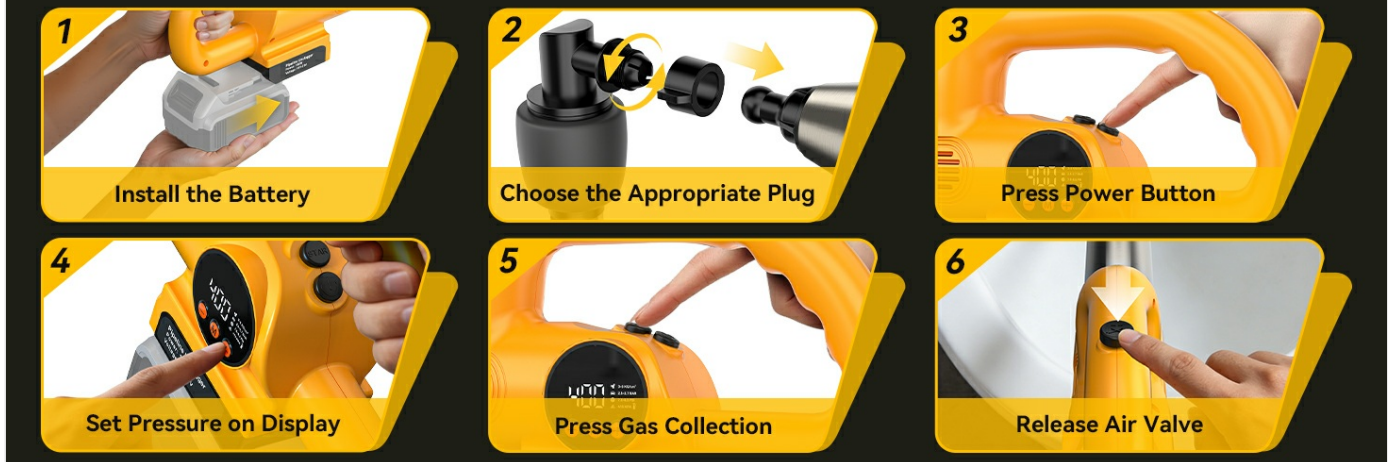
Figure 6: Step-by-step operation for unclogging.

Your browser does not support the video tag.