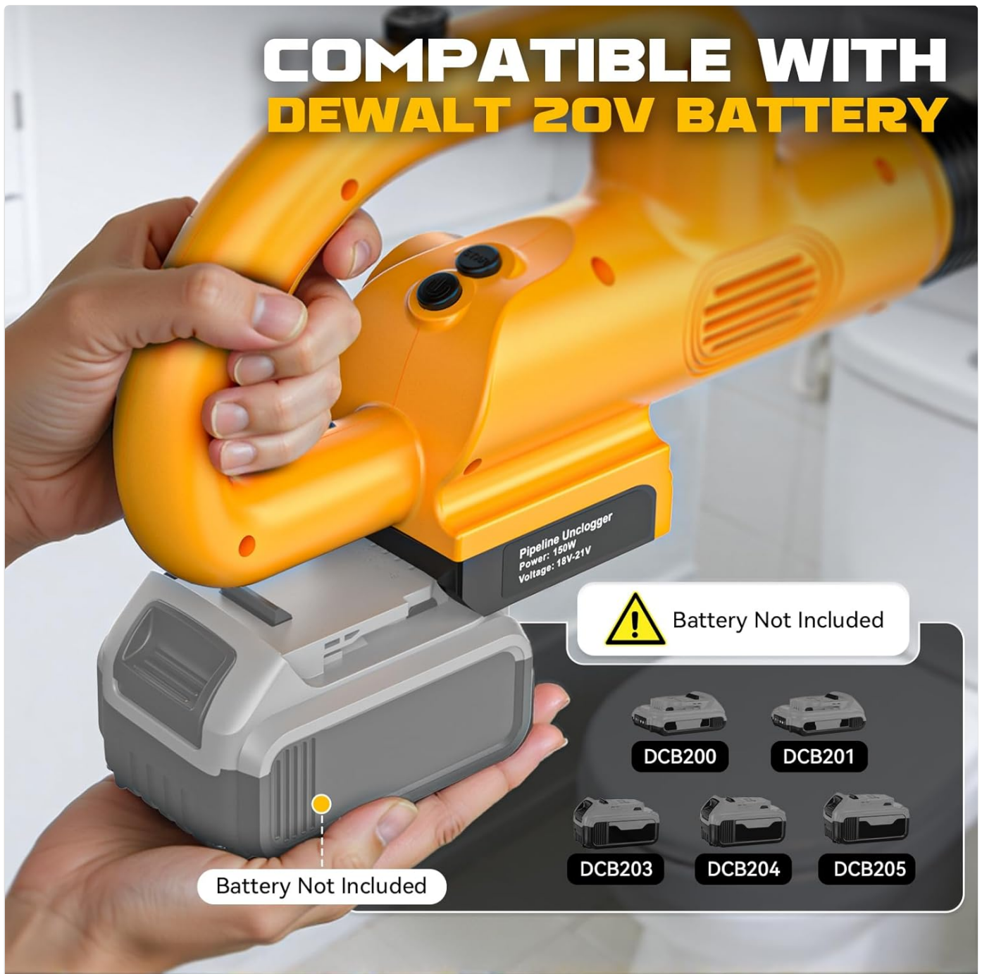
Figure 4: DeWalt 20V battery compatibility.