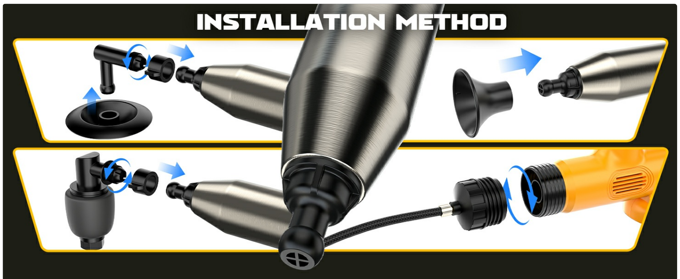
Figure 5: Installation method for various attachments.