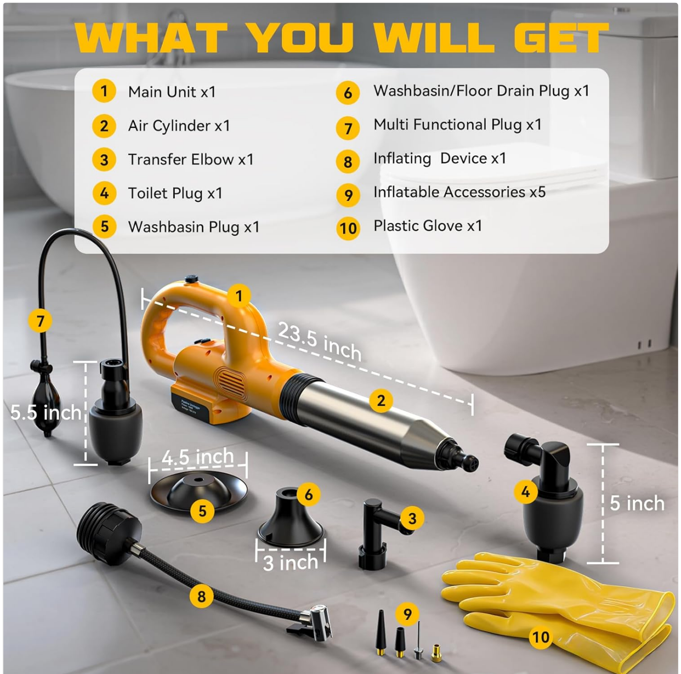
Figure 1: All components included in the Ecarke 2-in-1 Electric Toilet Plunger and Inflator kit.