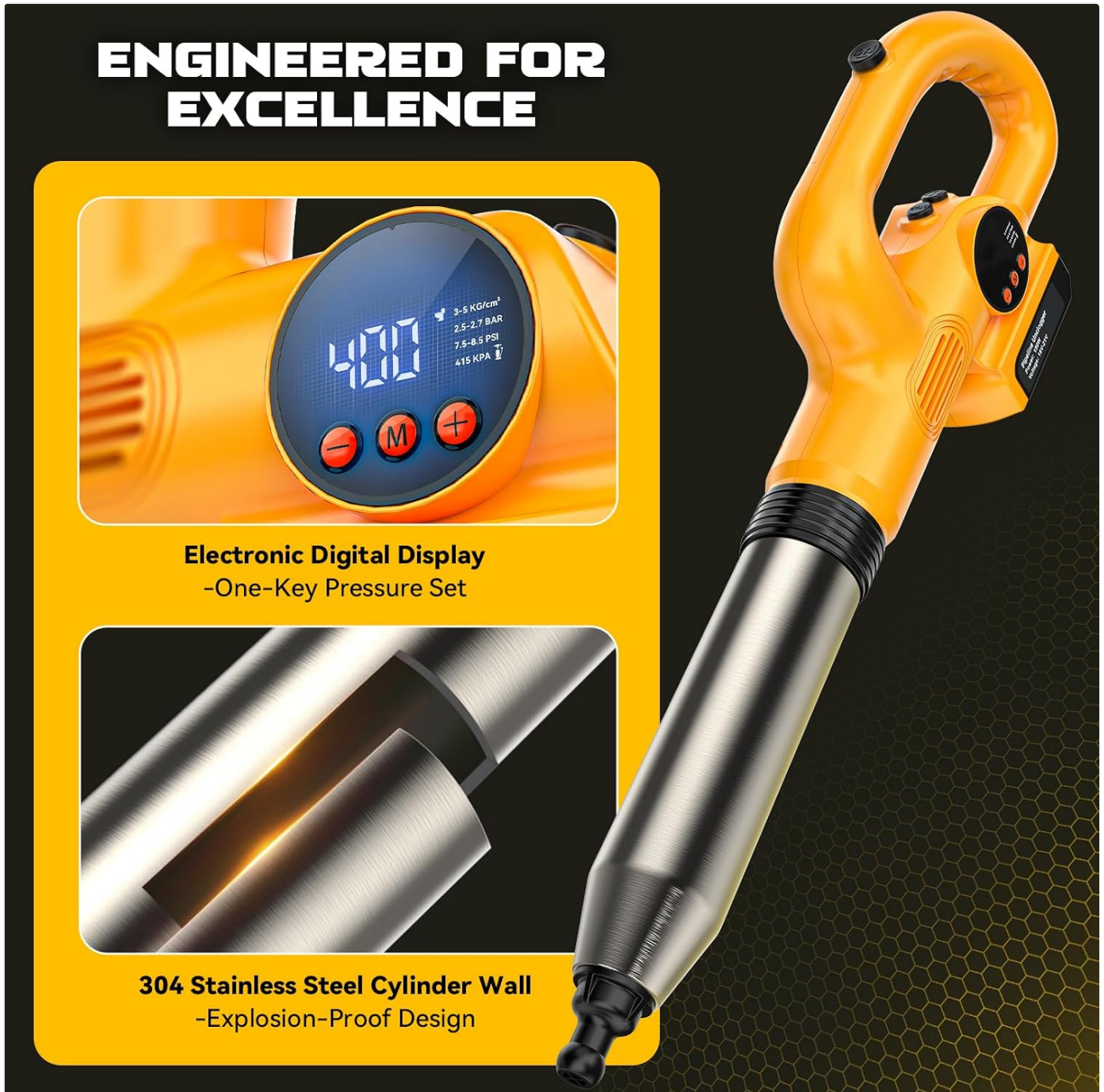
Figure 2: Electronic digital display and robust stainless steel construction.