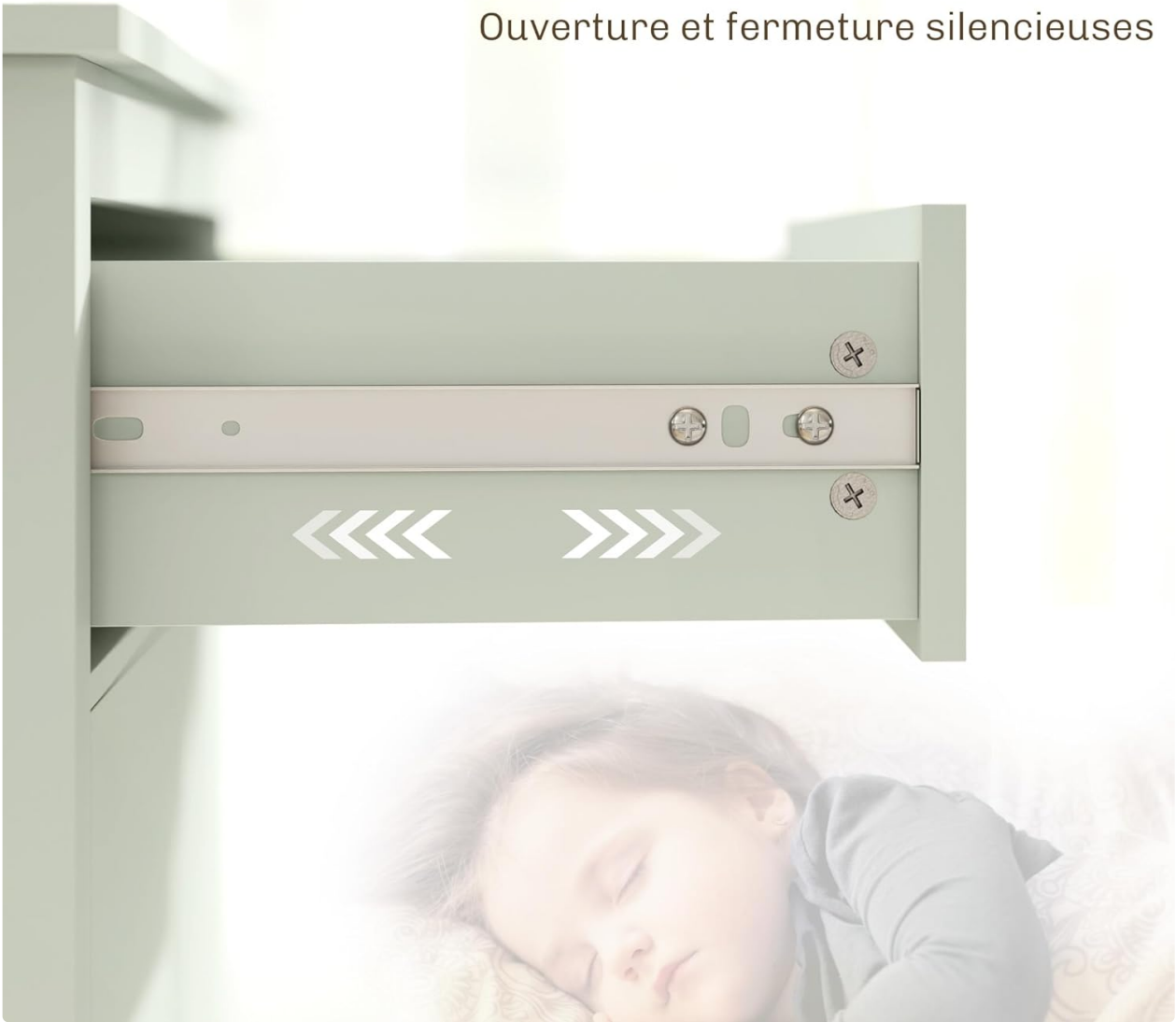
Image: Silent Drawer Guide. This detail shows the smooth-gliding mechanism of the drawer, designed for quiet operation.