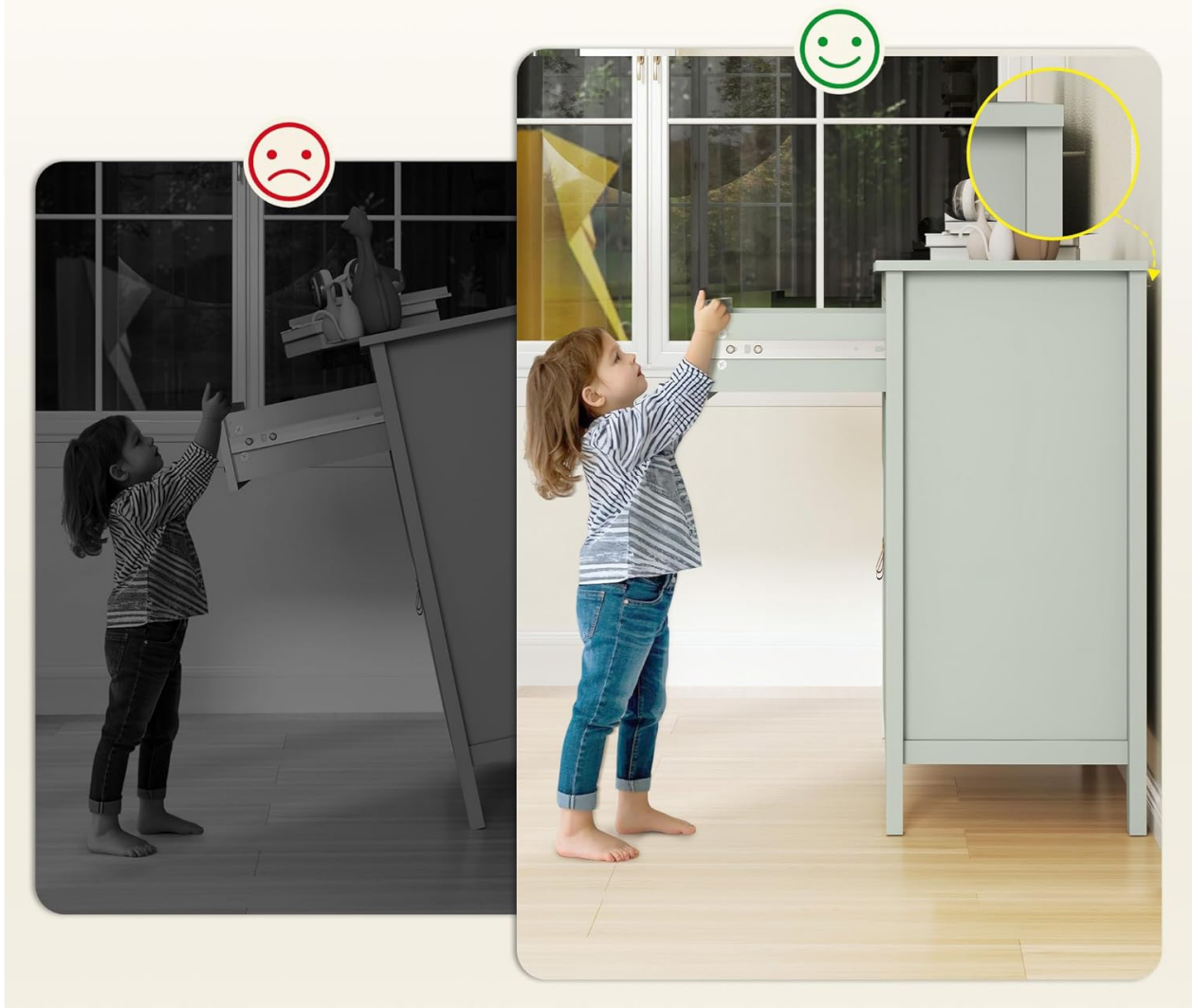
Image: Anti-Tipping Device Installation. This image illustrates the importance of securing the cabinet to the wall to prevent tipping, especially when children are present. The left side shows a child reaching for an unsecured cabinet, while the right side shows the cabinet safely secured.

Assurer la sécurité dans l'utilisation quotidienne