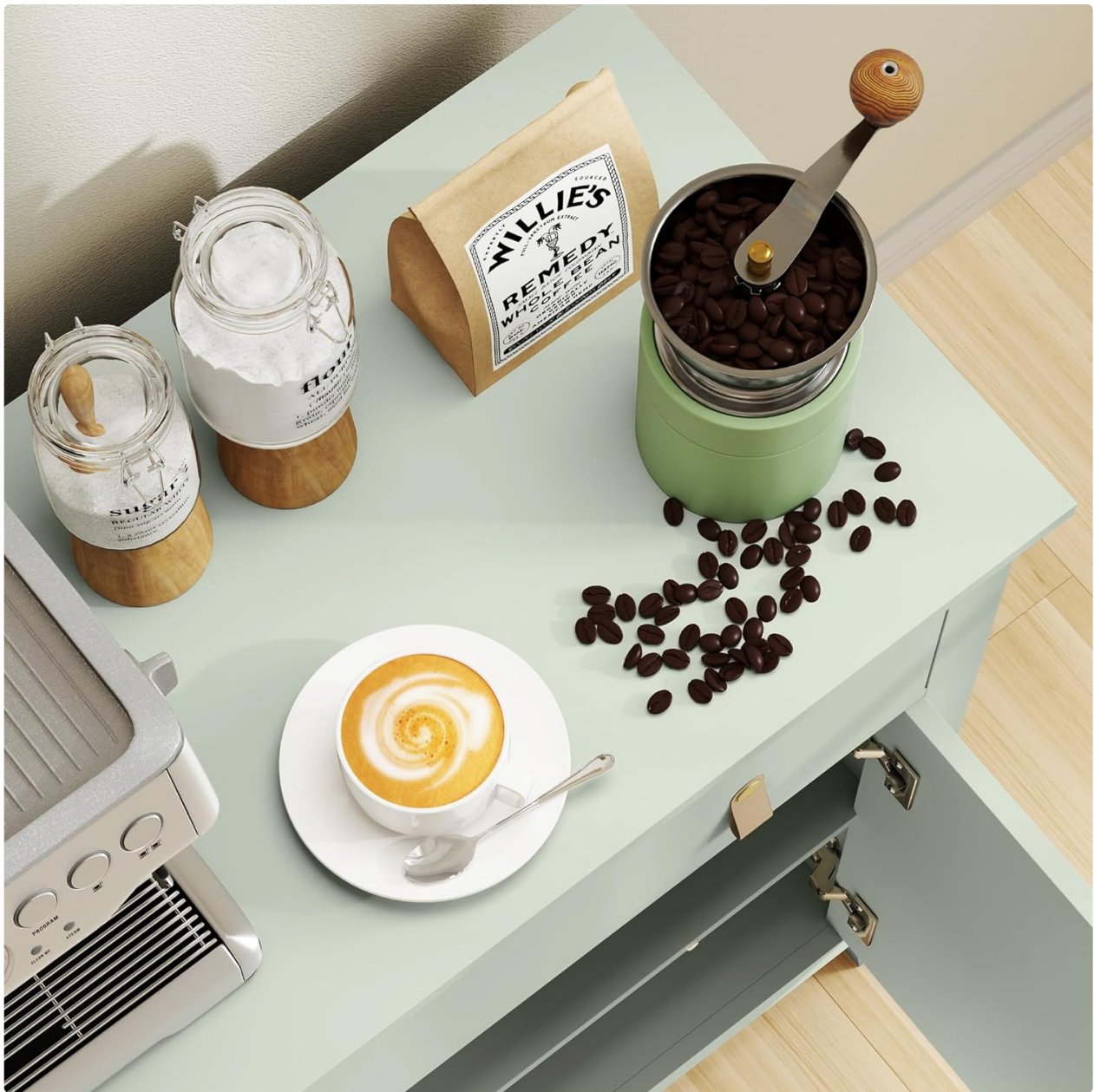
Image: Top Surface Display. This image shows the cabinet's top surface being used to hold various kitchen items, illustrating its practical use as a display or serving area.