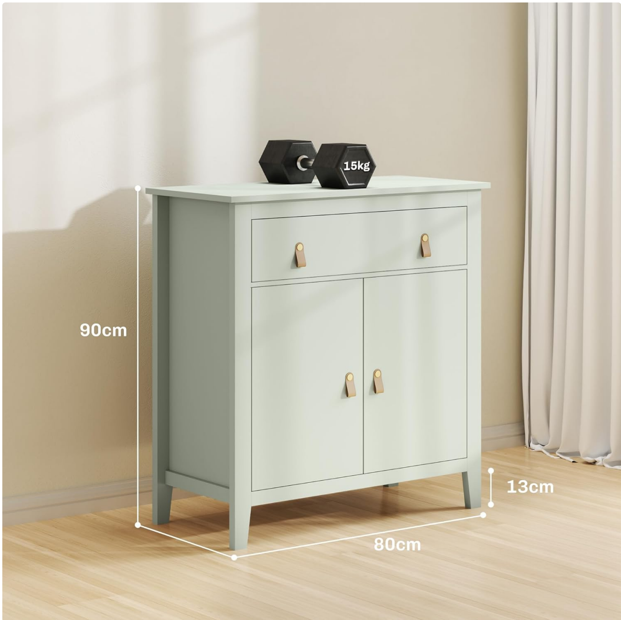
Image: Product Dimensions. This diagram provides a visual representation of the cabinet's key measurements, including its overall height, width, and the clearance from the floor.