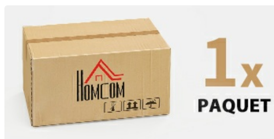
Image: Package Contents. The product is delivered in one package. Ensure the package is intact upon arrival.

Verify that all components are present and undamaged before proceeding with assembly. Refer to the included assembly instructions for a detailed list of parts and hardware.