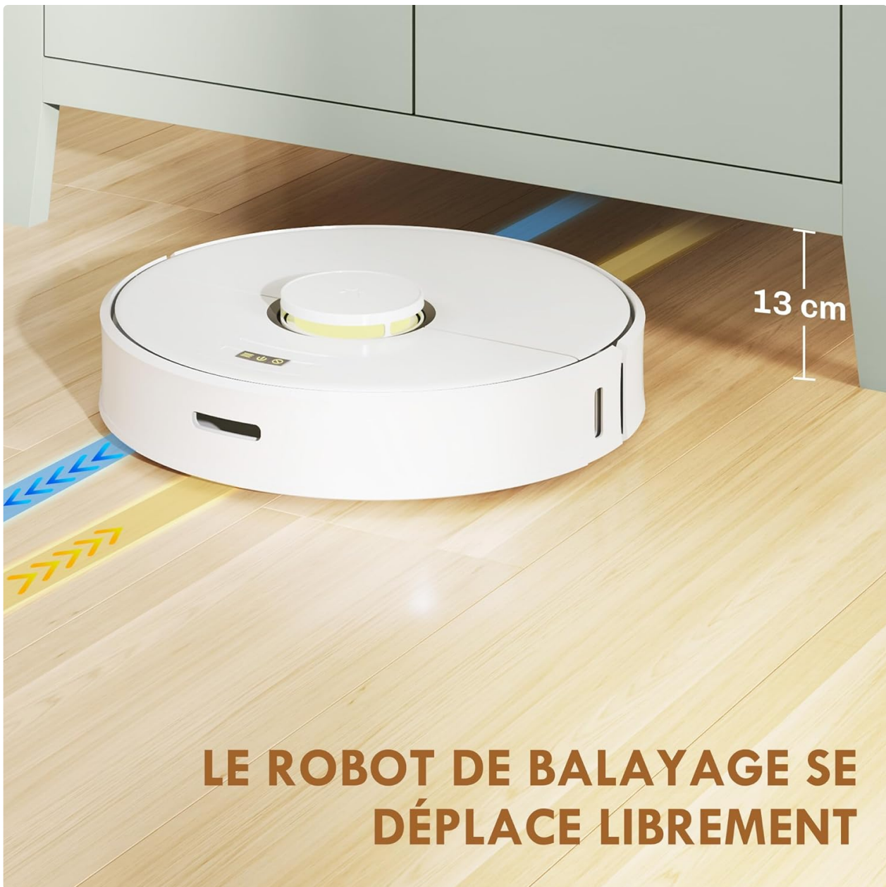
Image: Robot Vacuum Clearance. This image demonstrates the 13 cm clearance beneath the cabinet, allowing for convenient cleaning by robot vacuum cleaners.