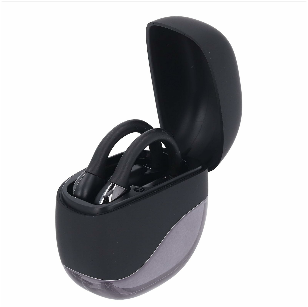
Image: Earphones placed inside the open charging case.