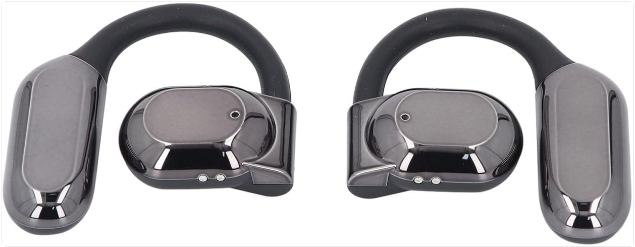
Image: Front view of both Dpofirs earphones, showing their design.