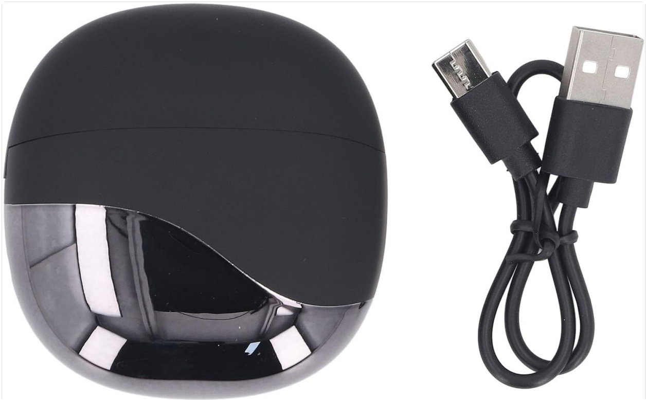
Image: The charging case and the included USB charging cable.