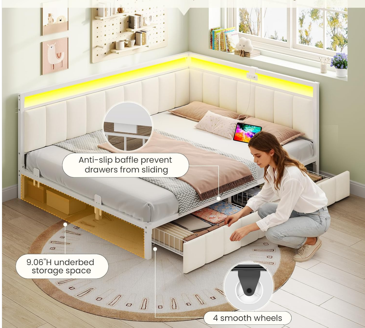
Figure 5.3: The two large under-bed storage drawers offer practical organization.

Provide ample space to store your clothes and bedding