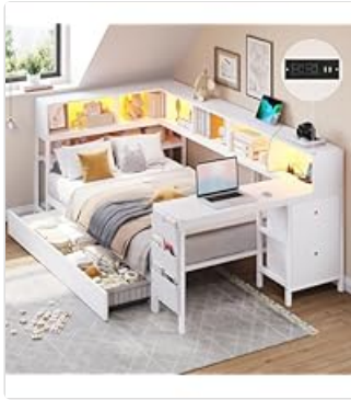
Figure 4.5: Plastic corner protectors are included for added safety.