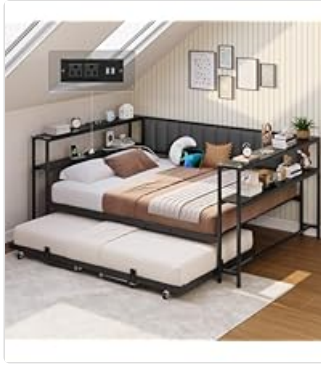
Figure 4.4: Mattress slide stoppers keep your mattress securely in place.