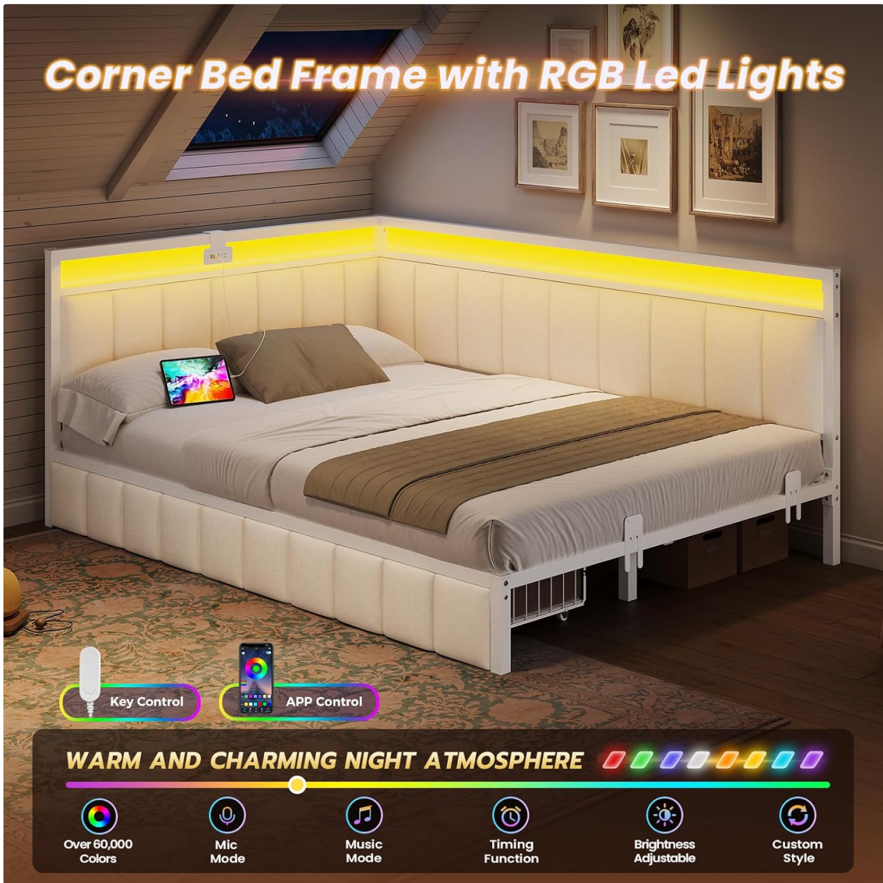
Figure 5.1: RGB LED lights offer multiple control options and modes for a customizable visual experience.