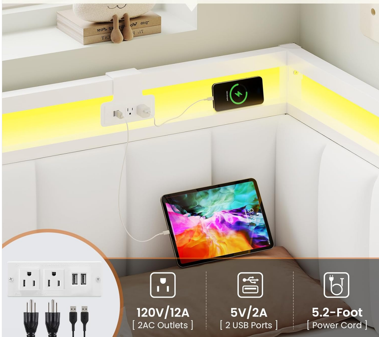
Figure 5.2: The convenient charging station provides power for multiple devices.

Hang it Anywhere on the Bed Rail According to your Needs