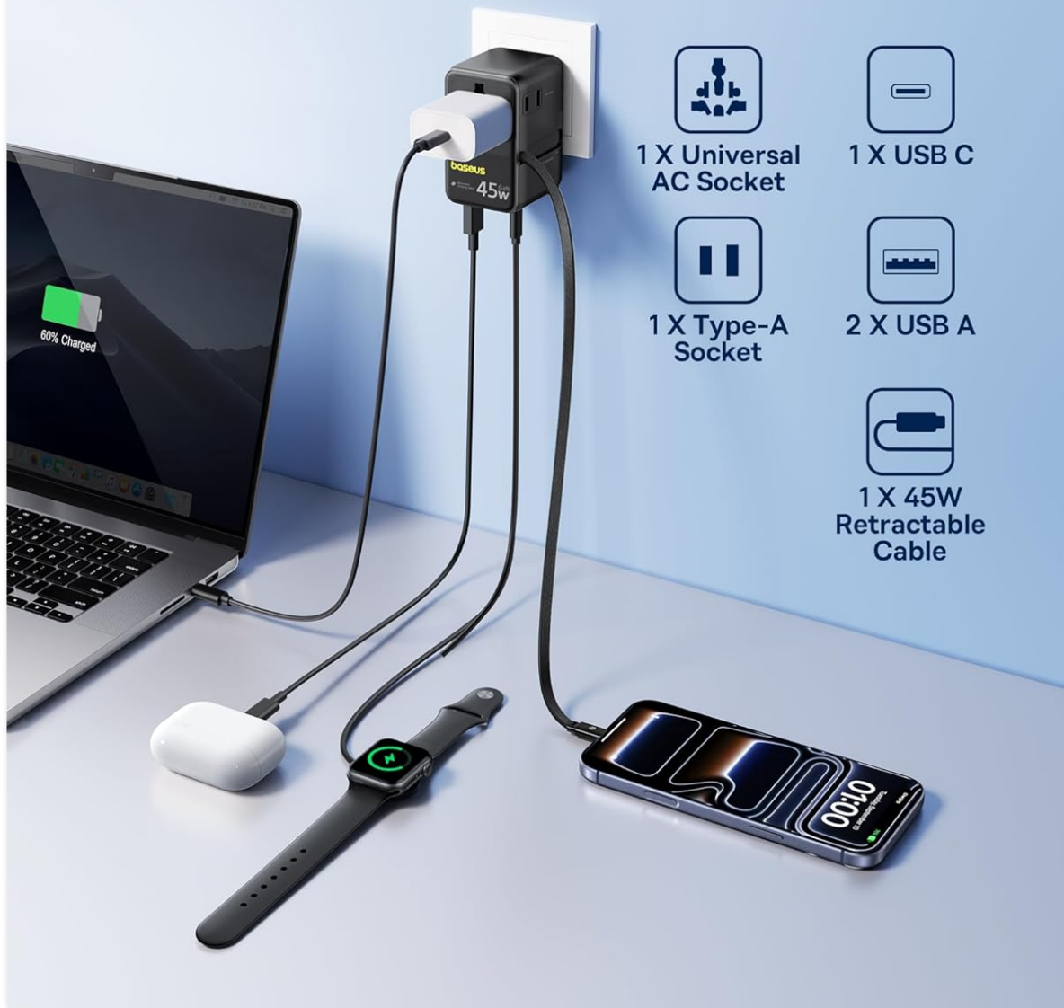
Image: The adapter connected to a wall outlet, actively charging a laptop, smartphone, smartwatch, and earbuds, demonstrating its 6-in-1 multi-device charging capability.