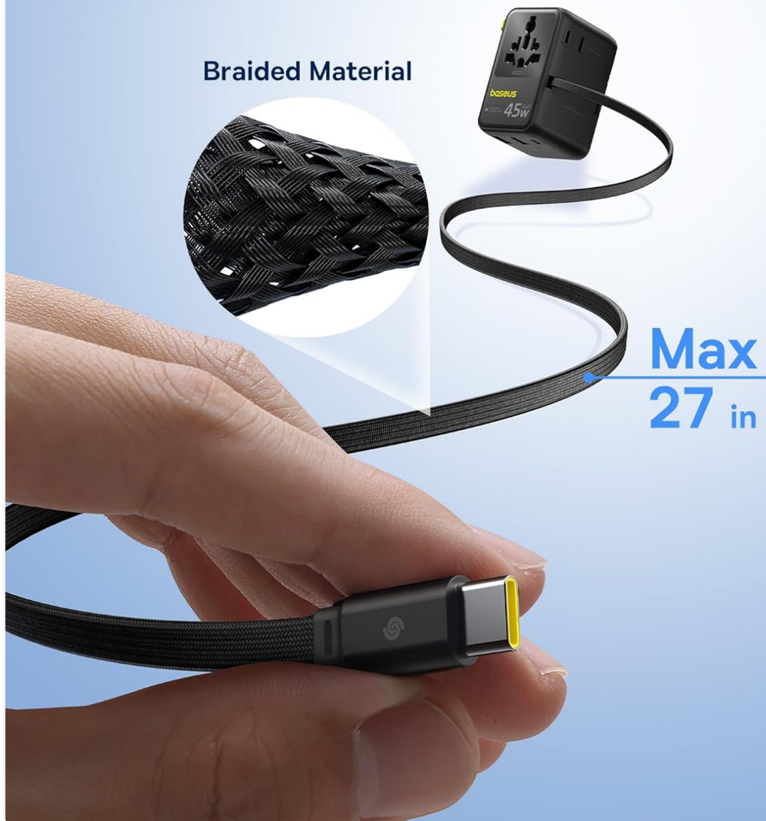
Image: The retractable USB-C cable extended from the adapter, showing its braided texture and maximum length, emphasizing its convenience.