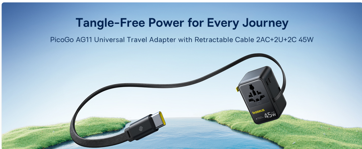
Image: The Baseus Picogo AG11 adapter showcasing its adaptability with different plug configurations for EU/KR, UK, USA/JP, and AUS/CN regions, highlighting its universal design.

The Baseus Picogo AG11 is a 45W 6-in-1 universal travel adapter designed for global compatibility. It features 4 different plug types (Type C/A/G/I) to connect in over 200 countries and regions, including Europe, Asia, USA, and Australia. This compact adapter simplifies your charging needs by consolidating multiple plug types into one device.