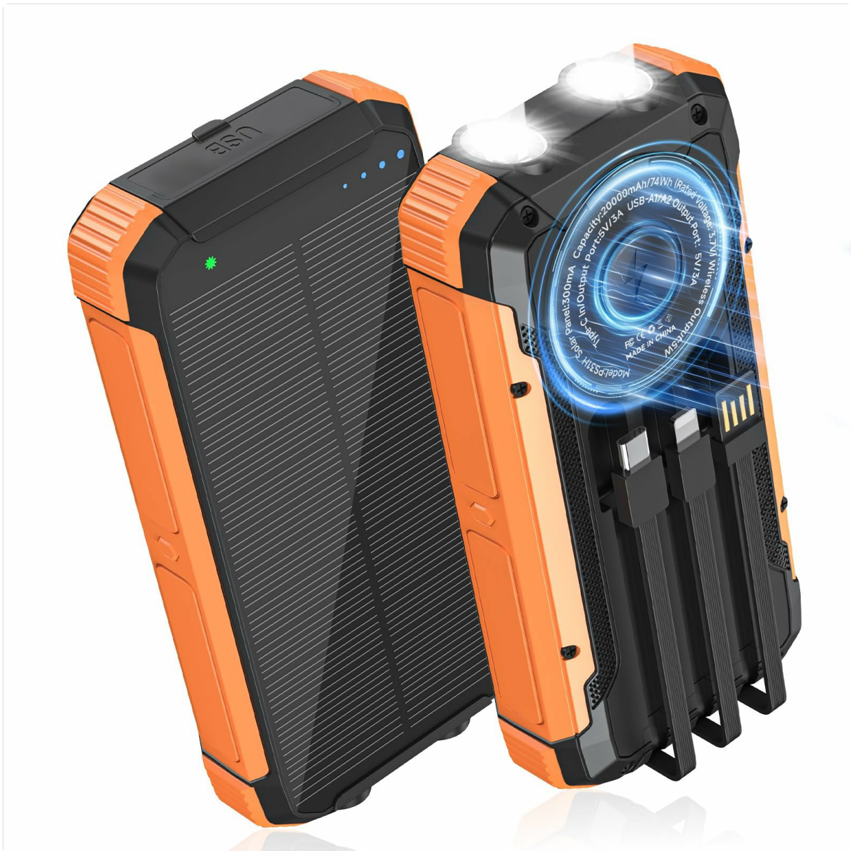
Front view of the ERRBBIC PS31H Solar Charger Power Bank, showcasing its solar panel and rugged design.