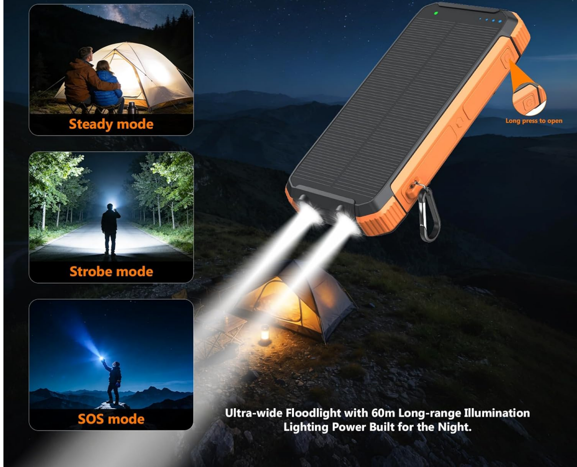
Illustration of the power bank's dual LED flashlight in steady, strobe, and SOS modes, useful for outdoor activities.