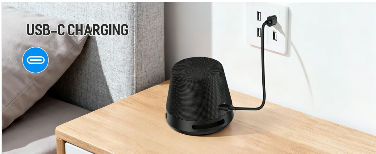
Image: The speaker charging via USB-C cable on a wooden surface.

Before first use, fully charge the speaker using the provided USB-C cable. Connect the USB-C end to the speaker's charging port and the other end to a compatible USB power adapter (not included).