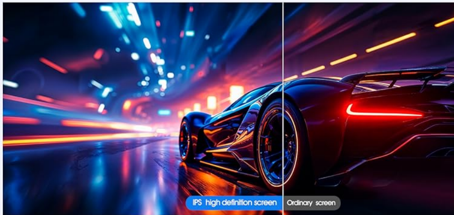
Image: A visual comparison demonstrating the superior clarity and vividness of the IPS high-definition screen on the SUXI A3 Tablet compared to a standard display.