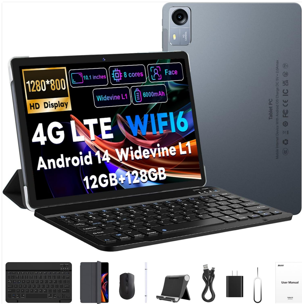
Image: The SUXI A3 Tablet in Starry Grey, presented with its detachable keyboard and stylus. The screen highlights key specifications including its 10.1-inch HD display, 4G LTE and WiFi 6 connectivity, Android 14 operating system, 12GB RAM + 128GB storage, and 6000mAh battery capacity.