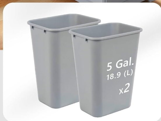
2x5 Gallon Trash Can

Image: Thoughtfully designed details including the rubber wood tabletop, vintage paneling, and brass handles.