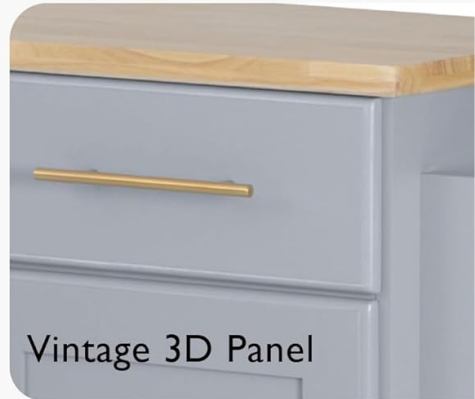
Vintage 3D Panel