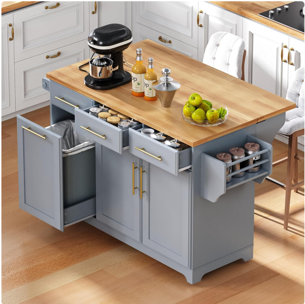
Image: The kitchen island with its drop-leaf extended, providing additional counter space.