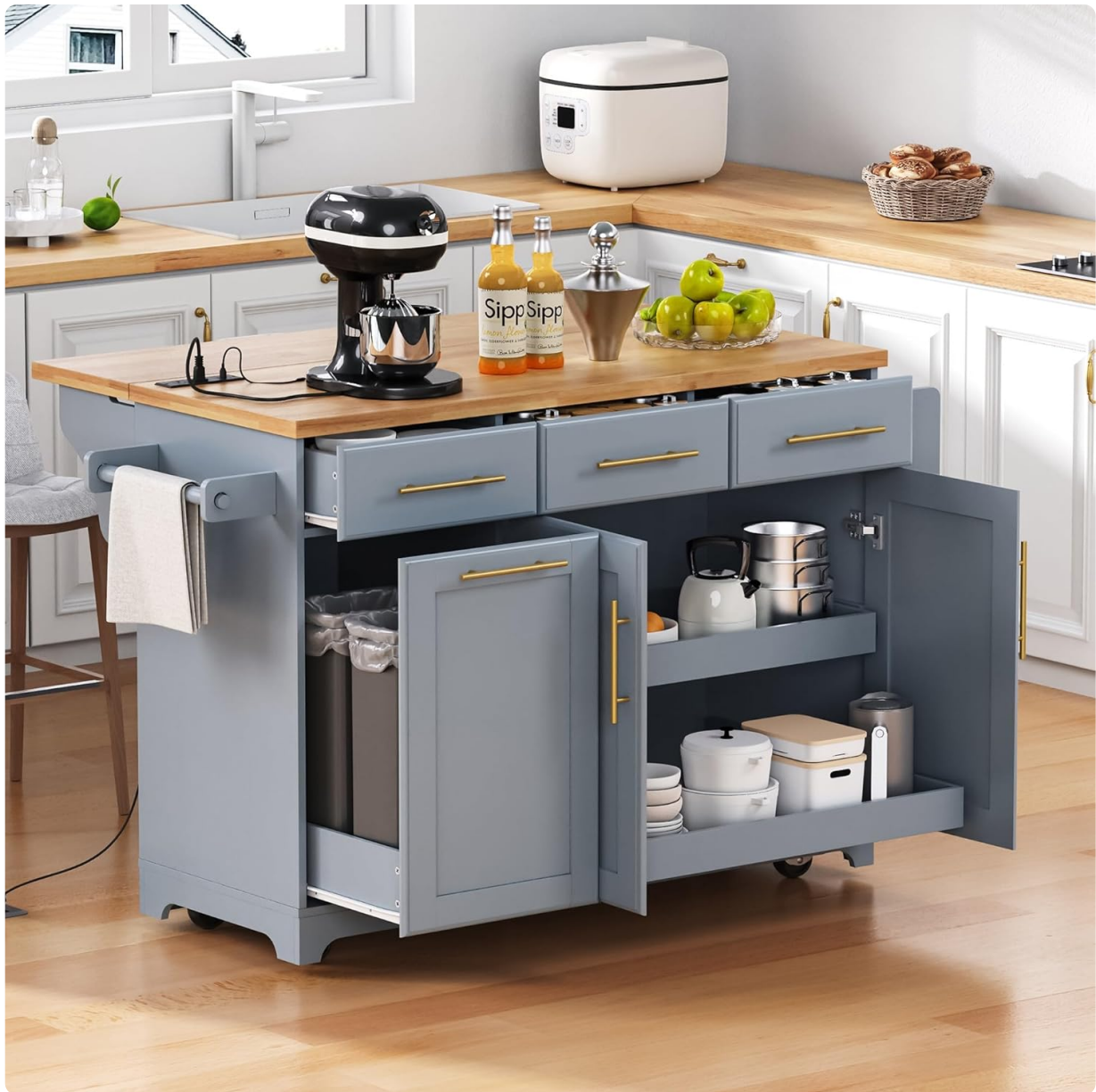
Image: The Virubi kitchen island showcasing its design and various storage compartments.