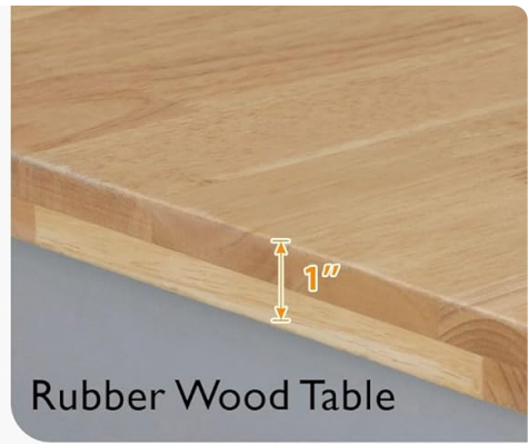
Rubber Wood Table

Please expect colour variance between actual product and photos due to different lighting conditions and online viewing device settings.