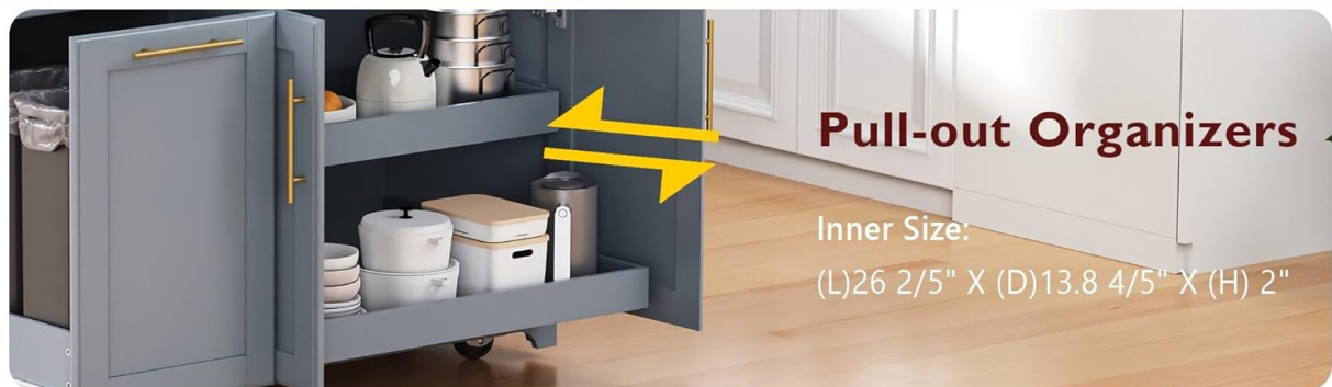
Image: View of the large capacity storage with pull-out organizers.