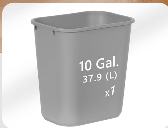
10 Gallon Trash Can