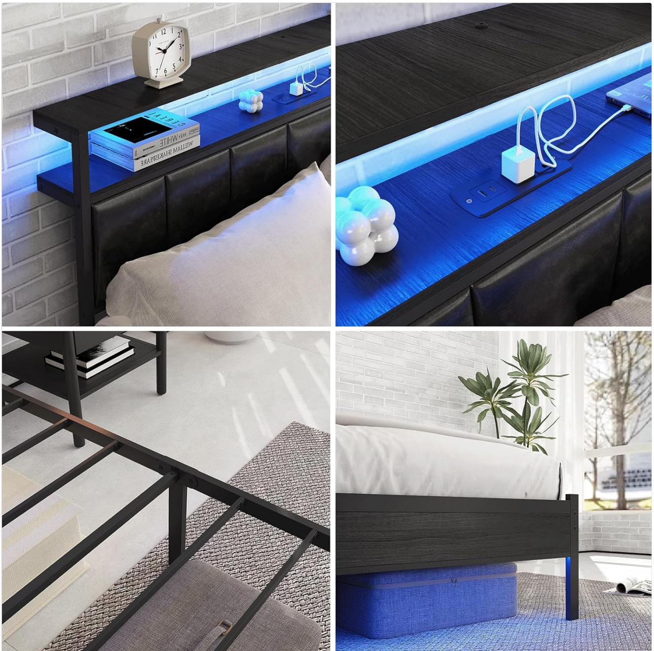
Image 4.2: Detailed view of headboard features and frame construction.