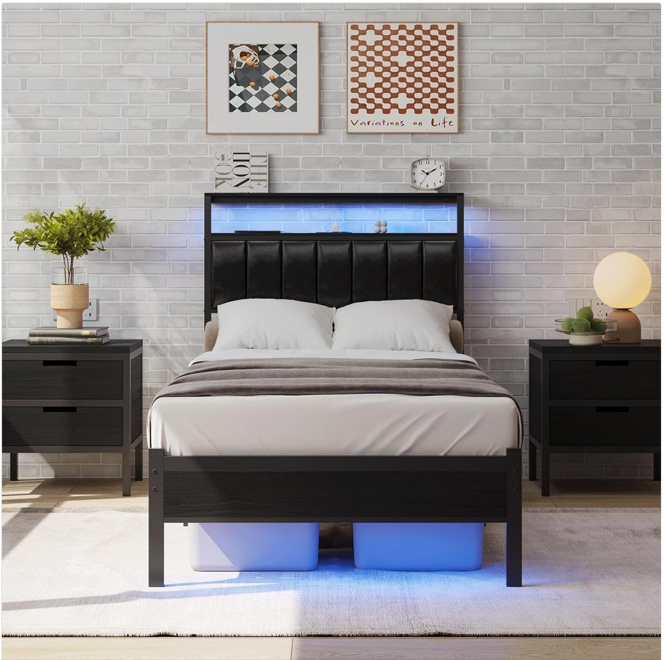
Image 1.1: Fully assembled CollaredEagle Twin Size Bed Frame in a bedroom setting.